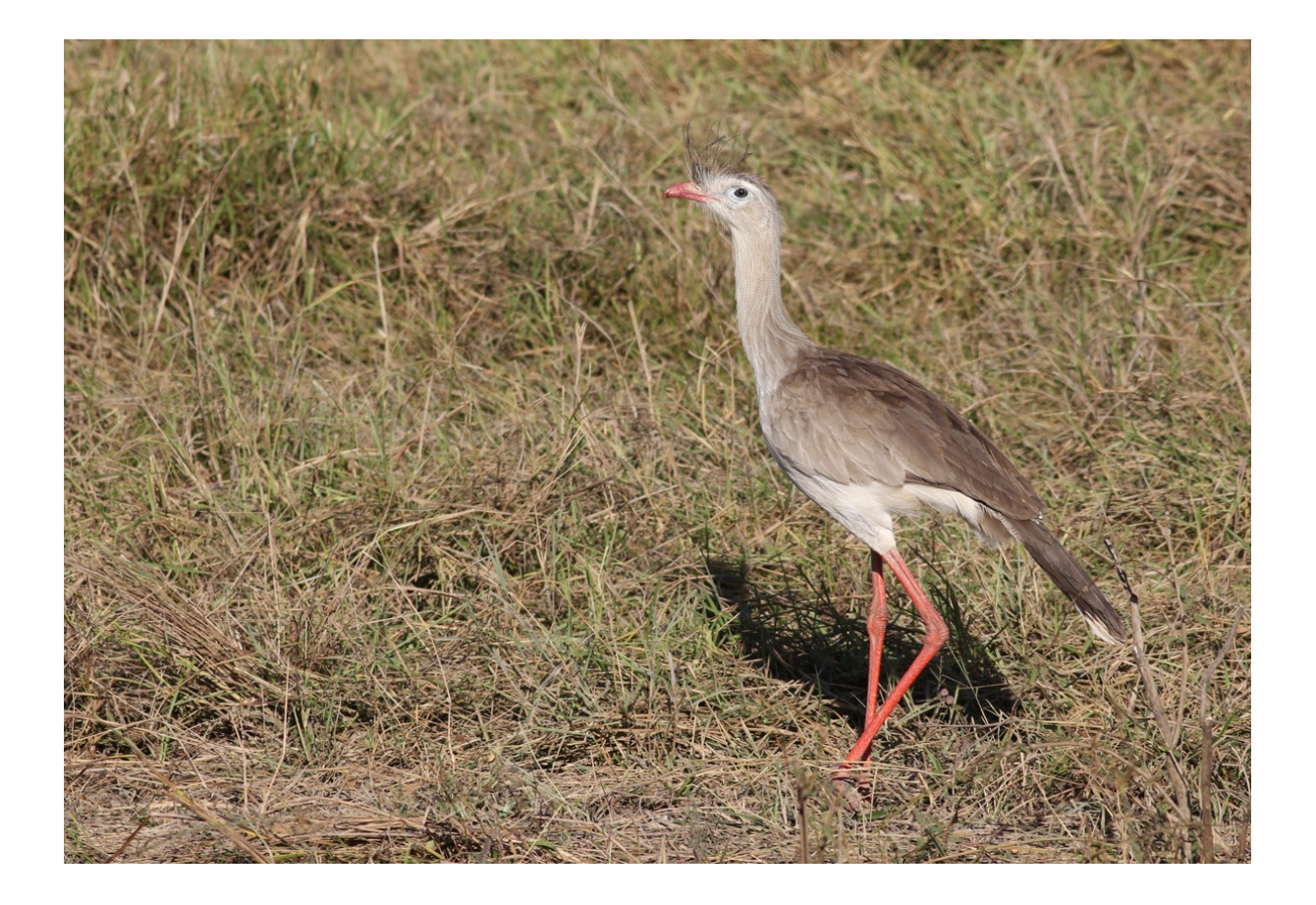
Red-legged Seriema (above) and "Pantaneiros" (below)