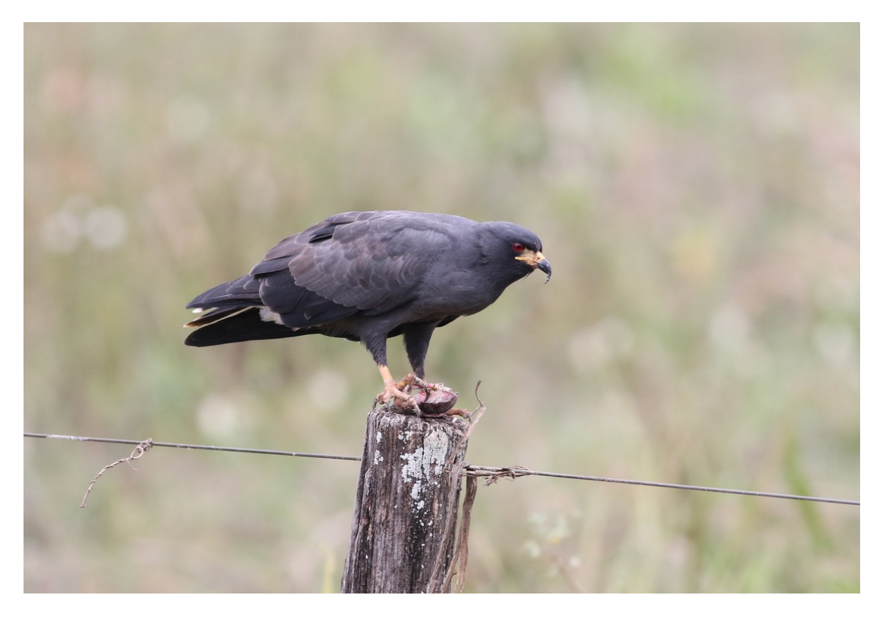
Male Snail Kite (above) and Savannah Hawk (below)