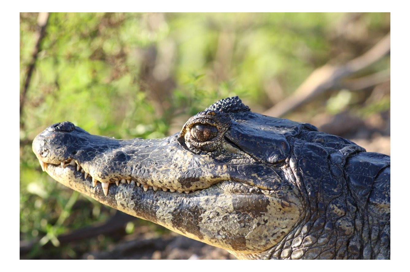
Pantanal Caiman (above) and Green Iguana (below)