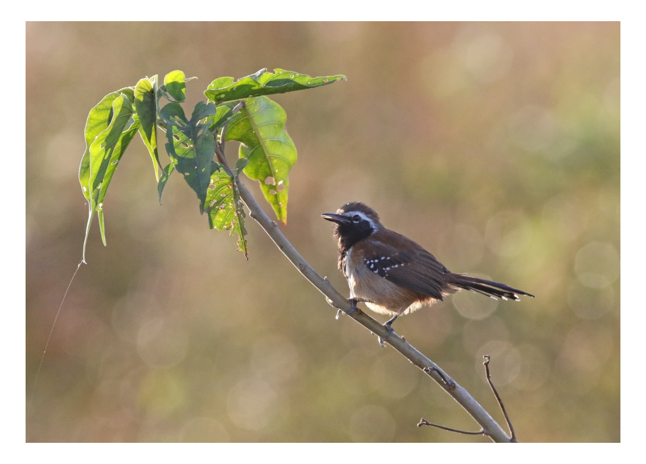
Male Rusty-backed Antwren (above) and Scarlet-headed Blackbird (below)