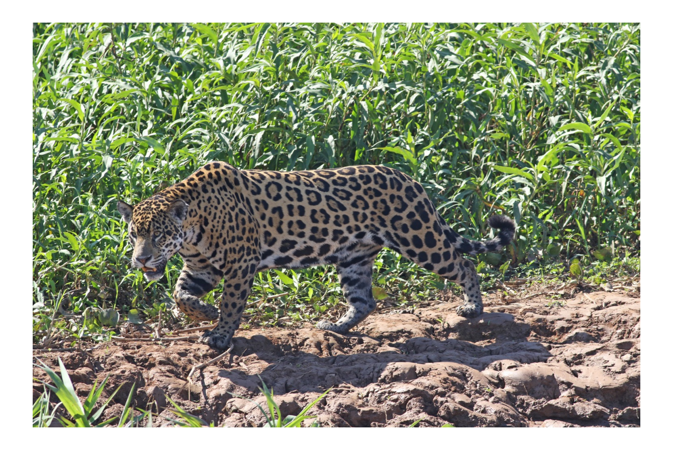
The same female and mother of the two well grown cubs (above) and the female from the Piquiri River (below)