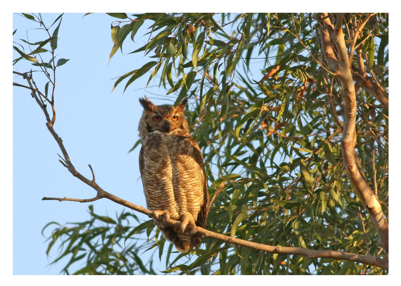
Great Horned Owl (above) and the common but nonetheless stunning Scaled Dove (below)