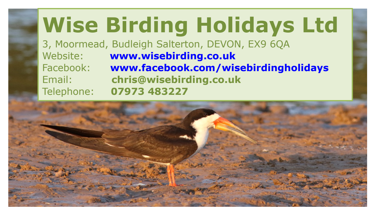
Black Skimmers were numerous on the rivers

Conservation Donation – Following this Northern Pantanal tour £200 was transferred to the Wise Birding Holiday's central conservation fund. This will be used to support a conservation project in the future, yet to be determined. For the last three years Wise Birding Holidays has been supporting a number of small conservation projects. However, we now believe that to make a bigger difference to conservation it seems better to pool the donations from most of our tours into one central fund. Once a target amount has been reached this money will then be used to support a single project in the hope of achieving more for species conservation. At present this amount stands at £2,500. Some tours will still continue to donate money to help some of the smaller projects that we feel will still benefit from such smaller donations. Please visit our <u>Conservation News</u> and <u>Latest News</u> links to find out more.