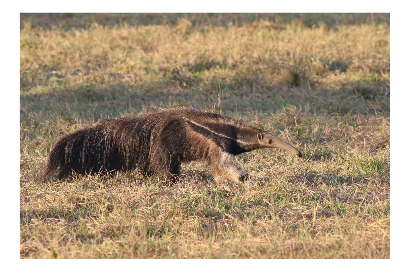
Giant Anteater near Pousa Alegre (above) and Southern Tamandua or Lesser Anteater at Piuval Lodge (below)