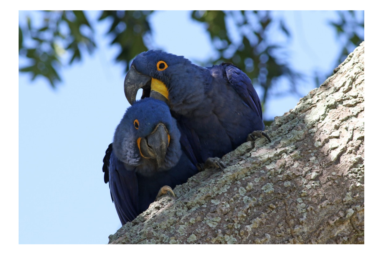
The beautiful Hyacinth Macaws were often outside our rooms at Porto Jofre (above) and a female Bare-faced Currasow in the early morning at Rio Claro (below)