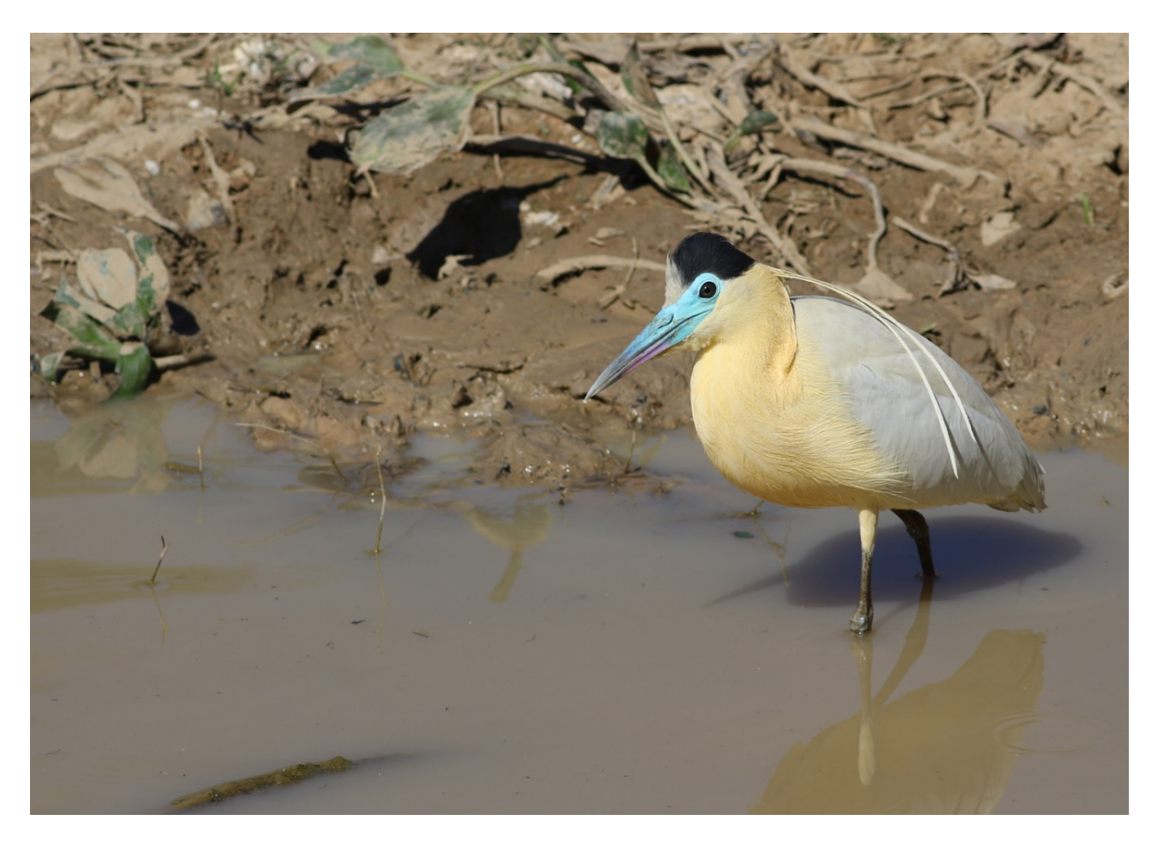
Probably the most beautiful of the herons, the Capped Heron(above) and the equally stunning Roseate Spoonbill (below)