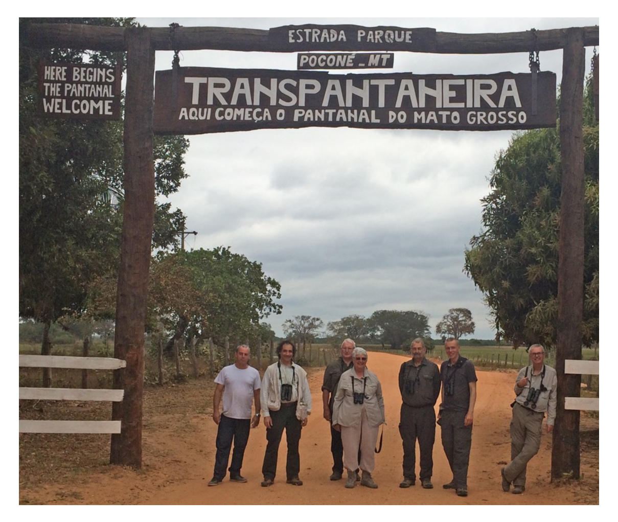
Our group (above) and Black-collared Hawk (below)