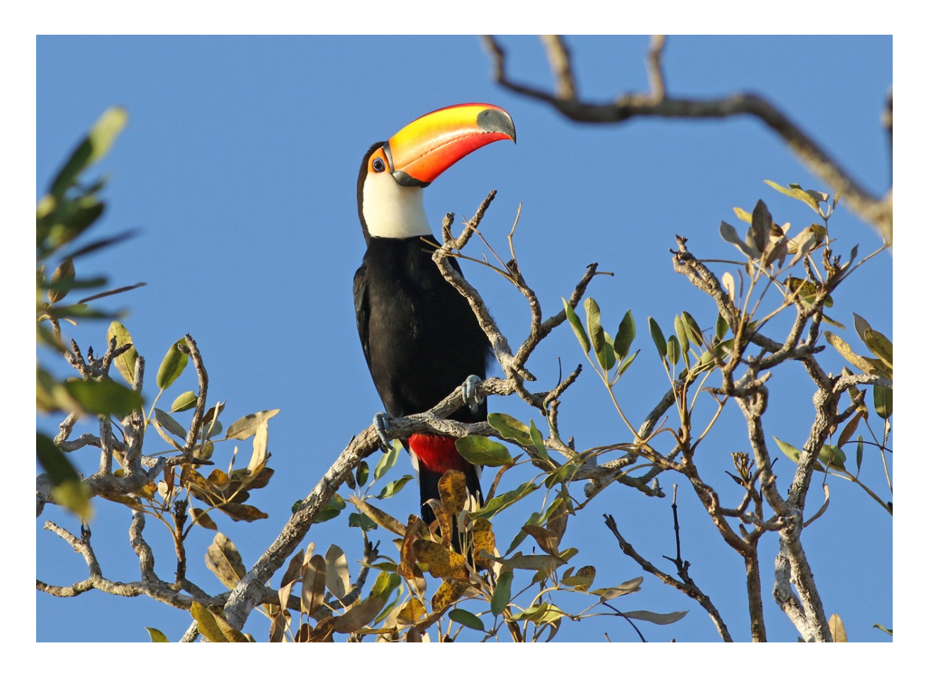
The Toco Toucan (above) and Chestnut-eared Aracari (below) are both stunning birds with character!