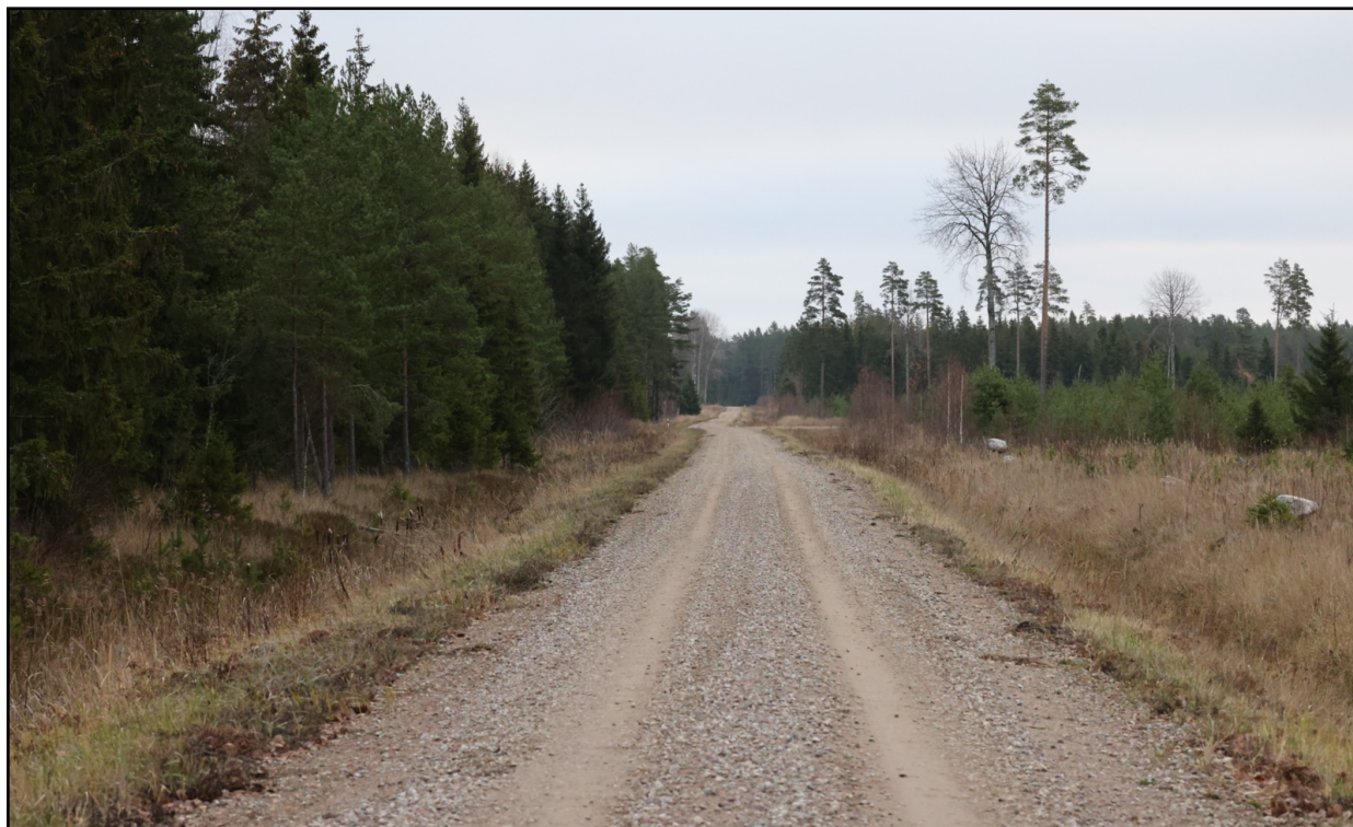
Typical habitat that was searched both day and night for Lynx