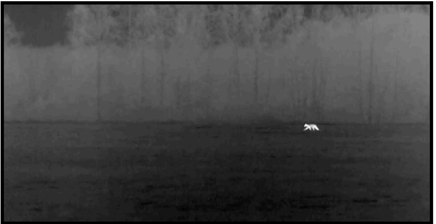
Eurasian Lynx: Screen grab from MP's thermal video taken during the tour

10th Nov: Absolutely amazing prolonged sighting of the second Lynx. Thought to be a female or possibly young animal due to size. First seen walking in a field in spotlight at distance, then appearing on the track in our van lights less than 100 metres from us. Finally laying under a tree not more than 50 meters. Absolutely amazing!