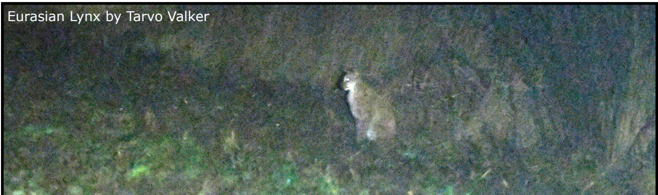
Eurasian Lynx by Tarvo Valker

Seen swimming for short period on one evening.