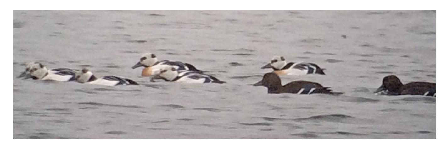
Steller's Eiders at Cape Undva, Saaremaa Island

For the last three years Wise Birding Holidays has been supporting a number of small conservation projects following the successful completion of a tour. However, we now believe that in order to make a bigger difference to conservation it seems better to pool the donations from most of our tours into one central fund. Once a target amount has been reached this money will then be used to support a single project in the hope of achieving more for species conservation. However, some tours will still continue to donate money to help some of the smaller projects that we feel will still benefit from such smaller donations. Please visit our Conservation News and Latest News links to find out more.