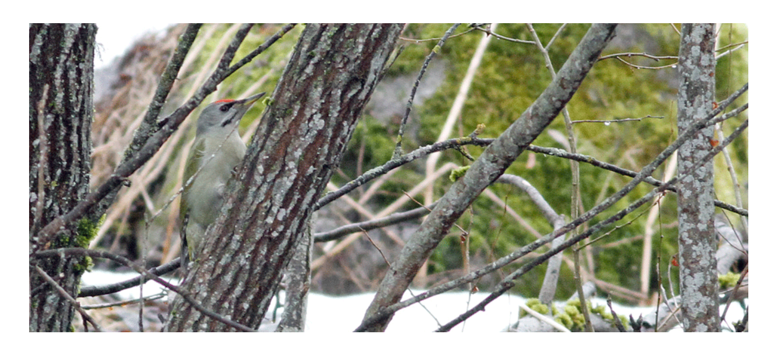
Male Grey-headed Woodpecker near Tudu