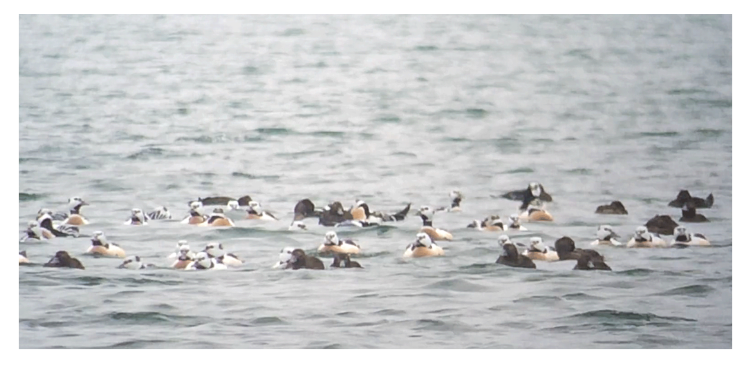
This Steller's Eider flock was part of at least 245 birds seen on our first day!

Nutcracker: A single bird showed well at Vidumae Nature Reserve, Saaremaa Island. Long-tailed Duck: Superb close views of a crazy displaying flock at Veere Harbour. Grey-headed Woodpecker: Very close views of a male low to the ground at Tudu. Black Woodpecker: A number of good views including a male on Saareemaa island. Puddings: Peach Cheesecake at the Padise Manor House and Pavlova at Haapsalu!