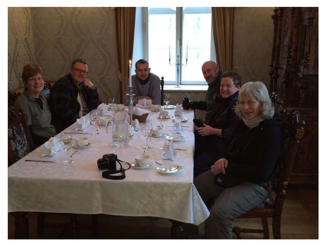
Pleasure and Pain!