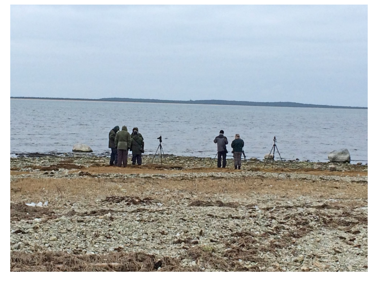
Watching Steller's Eiders at Cape Undva and birding the forests near Tudu