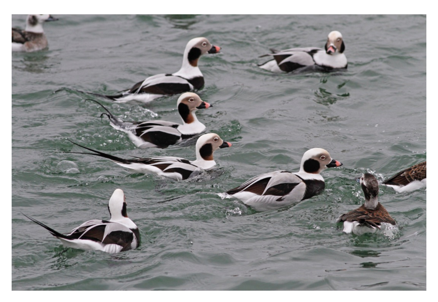
Long-tailed Ducks on Saaremaa Island