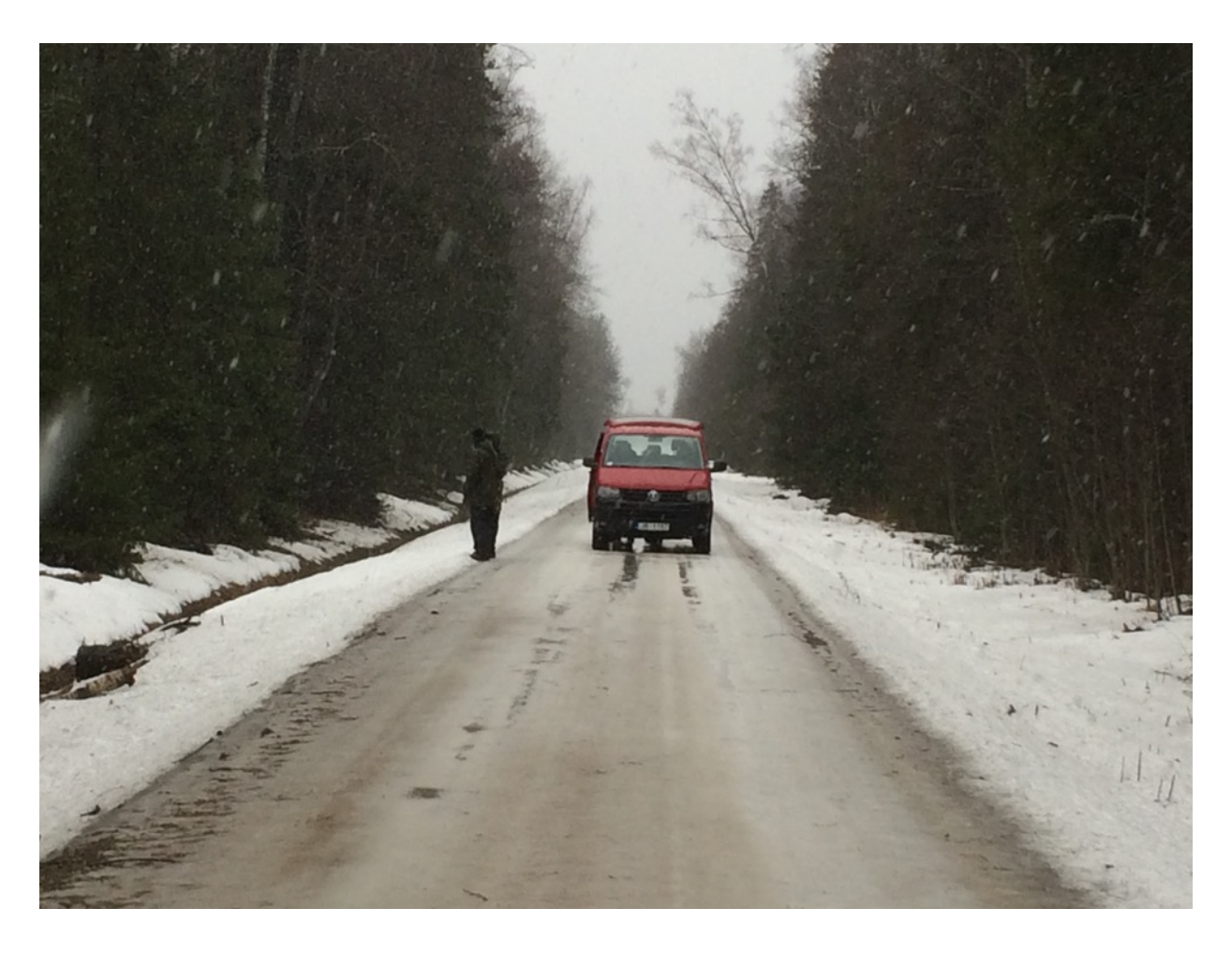
WISE BIRDING HOLIDAYS LTD – ESTONIA: Steller's Eiders & Woodpeckers, Feb 2015