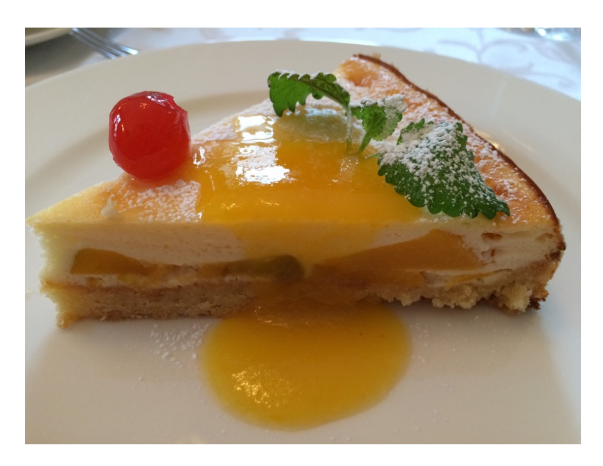
Just some of the fantastic desserts in Estonia