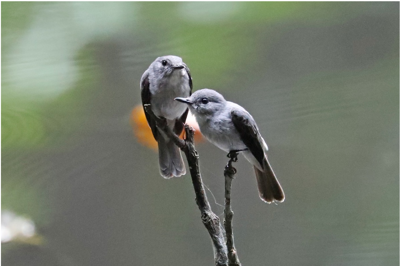
Cassin's Flycatchers at Ankasa