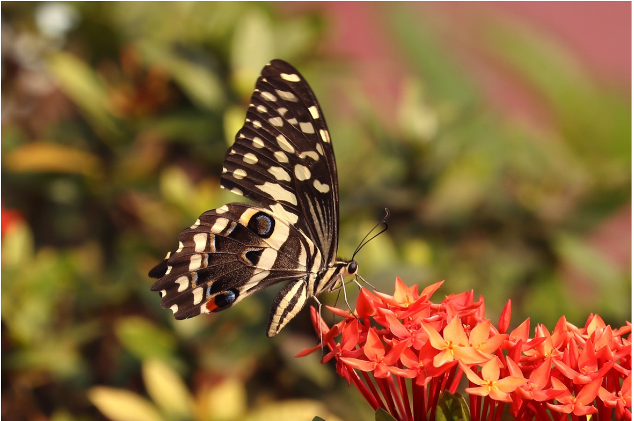
Citrus Swallowtail (above) and Blue Diadem (below) by Roger Wasley