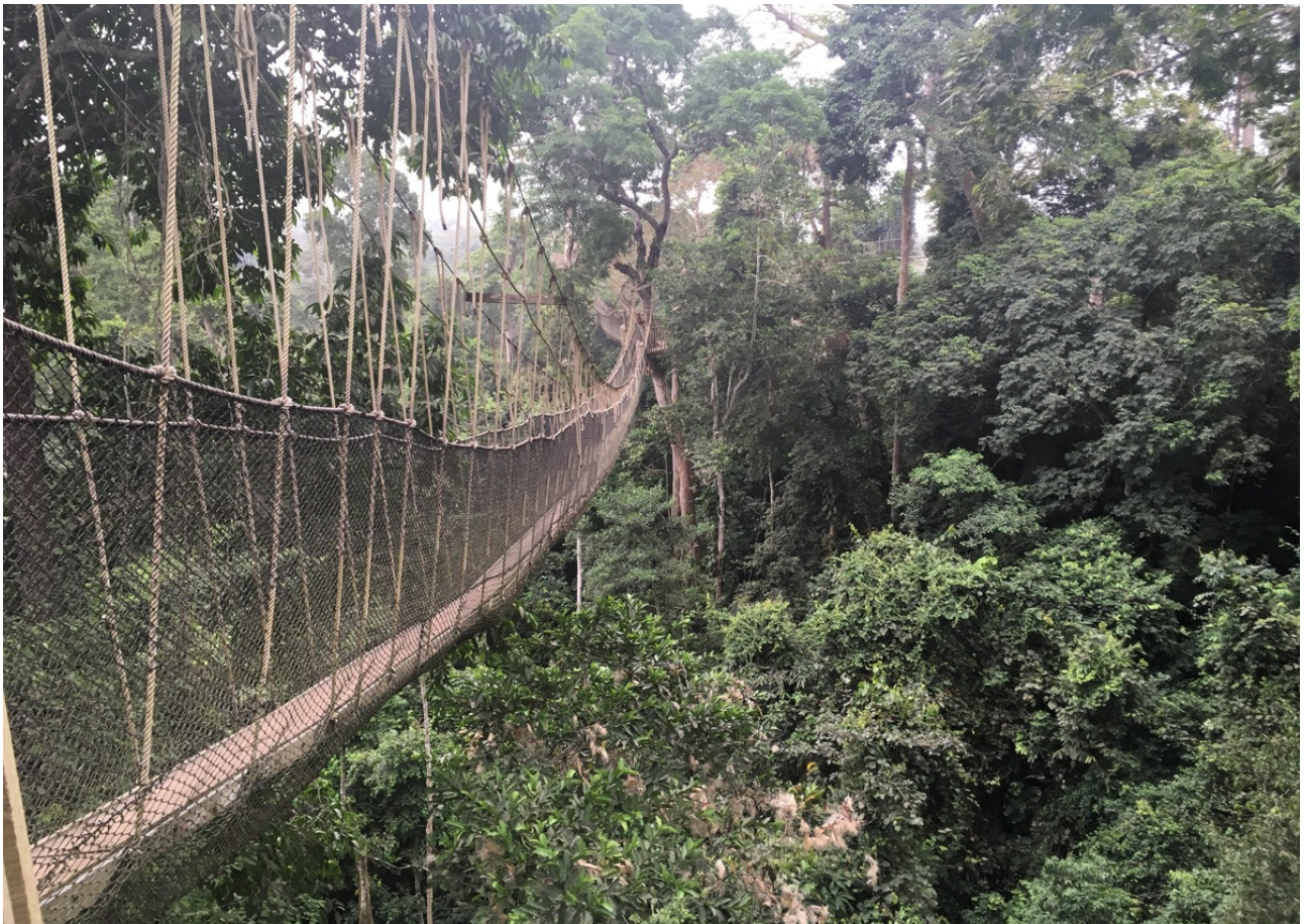
We spent much of our time birding from the wonderful canopy walkway whilst in Kakum National Park