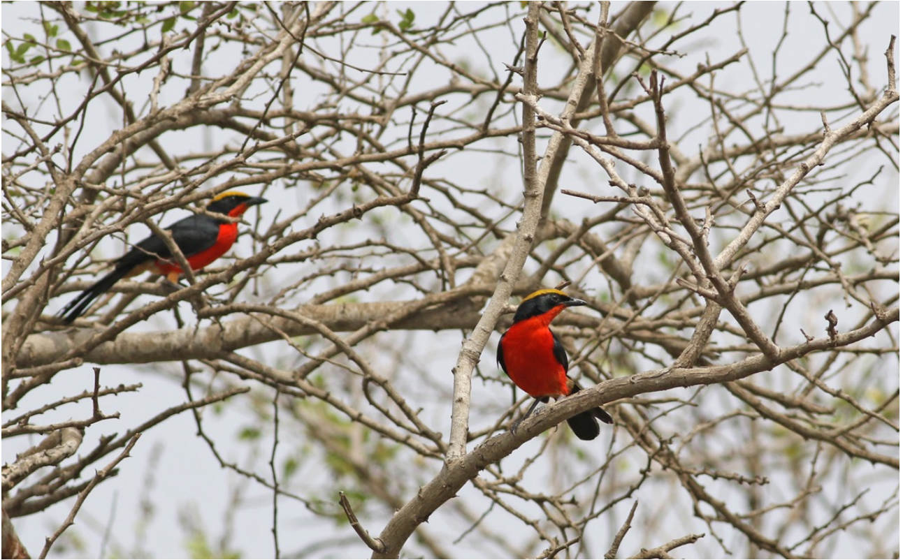
The Yellow-crowned Gonolek is a common but stunning species (above) and a singing male Yellow-throated Cuckoo at Atewa was a great surprise (below)