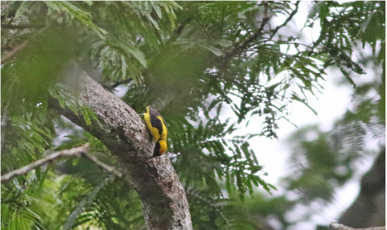
Preuss's Weaver or Golden-backed Weaver from the canopy walkway (above) and Mauritian Tomb Bats in the Sayu Cave at Shai Hills (below)