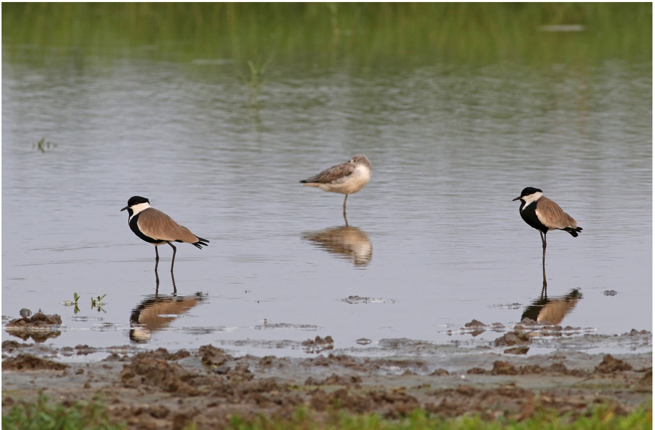
Spur-winged Lapwing and Common Greenshank at Sakumono Lagoon (above) Lesser Black-winged Lapwing or Senegal Lapwing, Winneba Plains by Peter Alfrey (below)