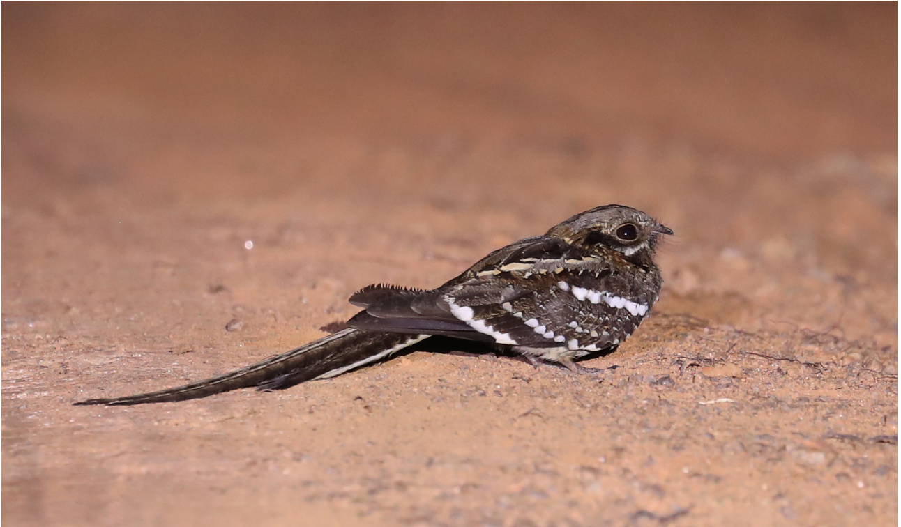
This Long-tailed Nightjar was one of four birds seen near Brimsu Reservoir (above) and the very smart Red-billed Helmet-shrike was at Ankasa (below)