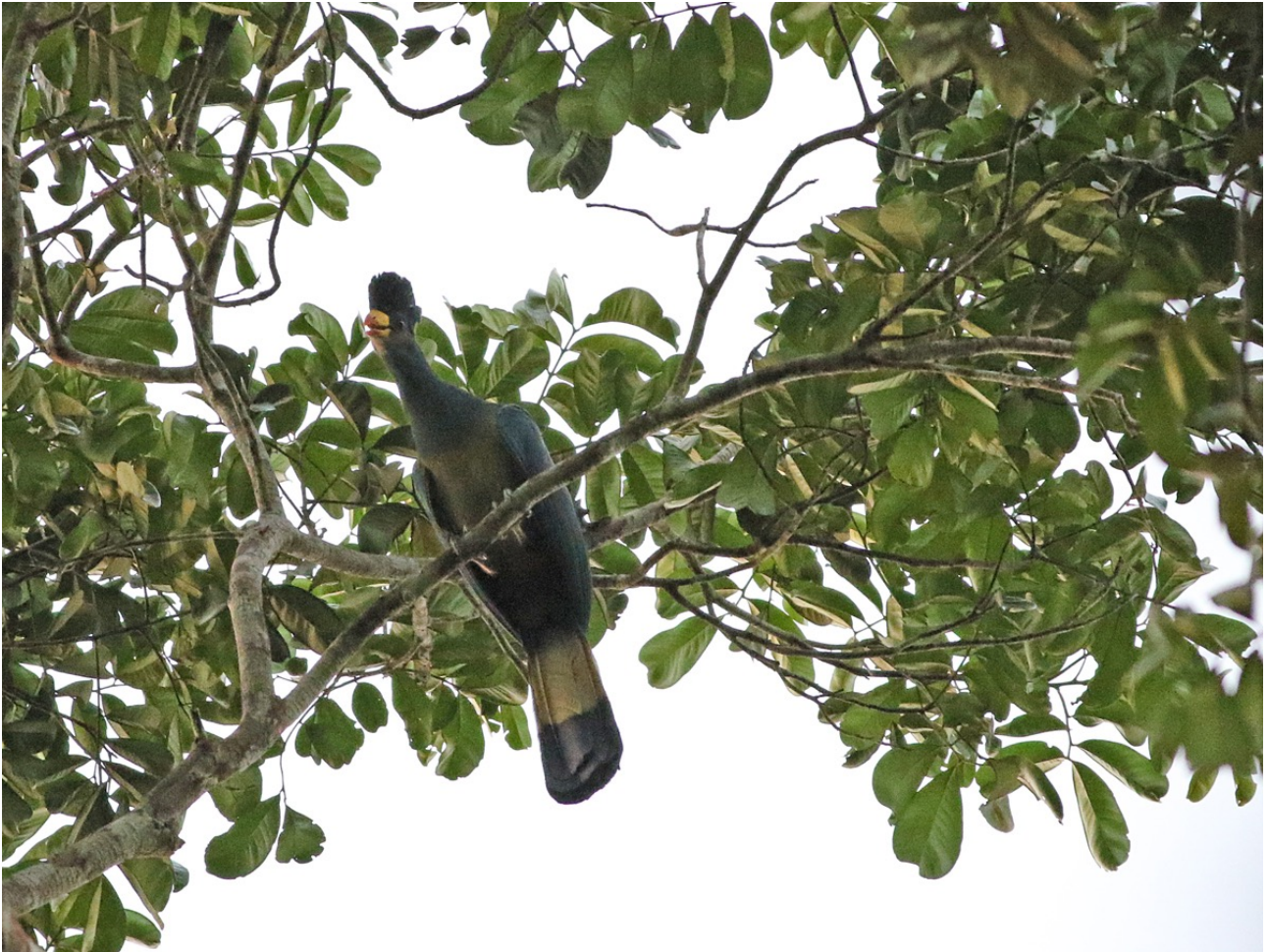
We were rewarded with views of six Great Blue Turacos at Ankasa (above) and a number of Yellow-billed Turacos like this bird at Kakum (below)