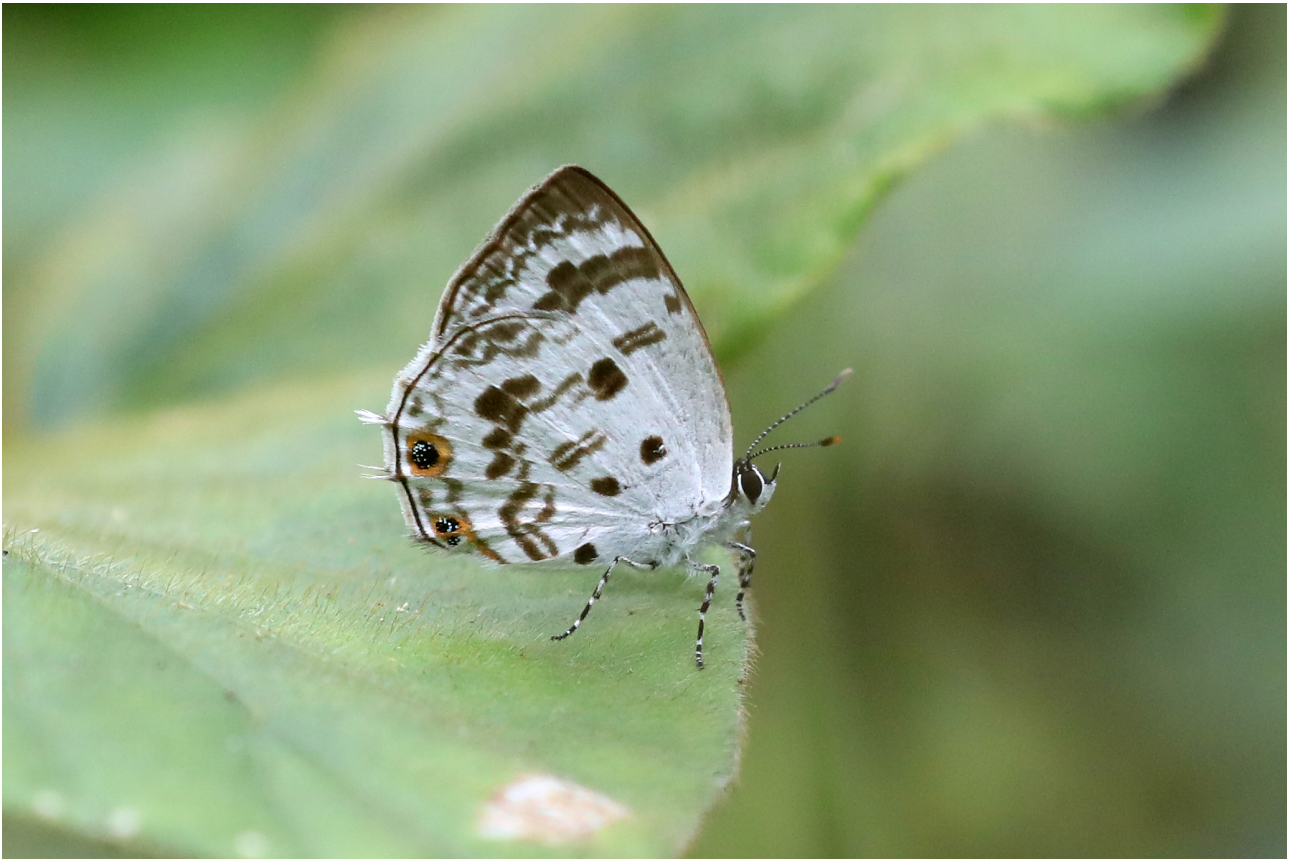
Common Indigo Ciliate Blue (above) and Soldier Pansy (below)