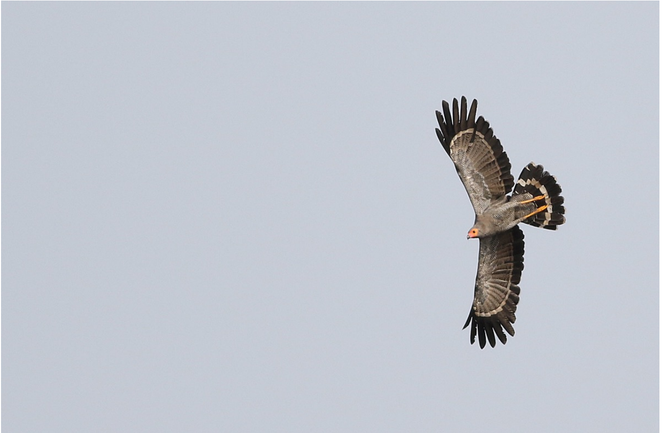
African Harrier Hawk or Gymnogene (above) and a wonderful Ayre's Hawk-eagle (below)