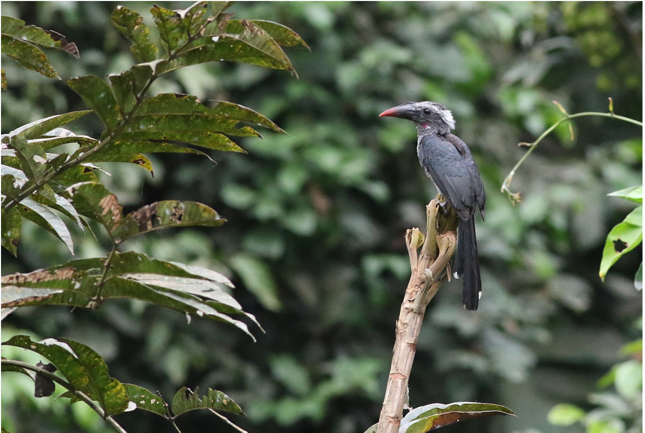
Black Dwarf Hornbill or Western Little Hornbill (above) and Western Piping Hornbill by Roger Wasley (below) were two of six hornbill species seen during the tour