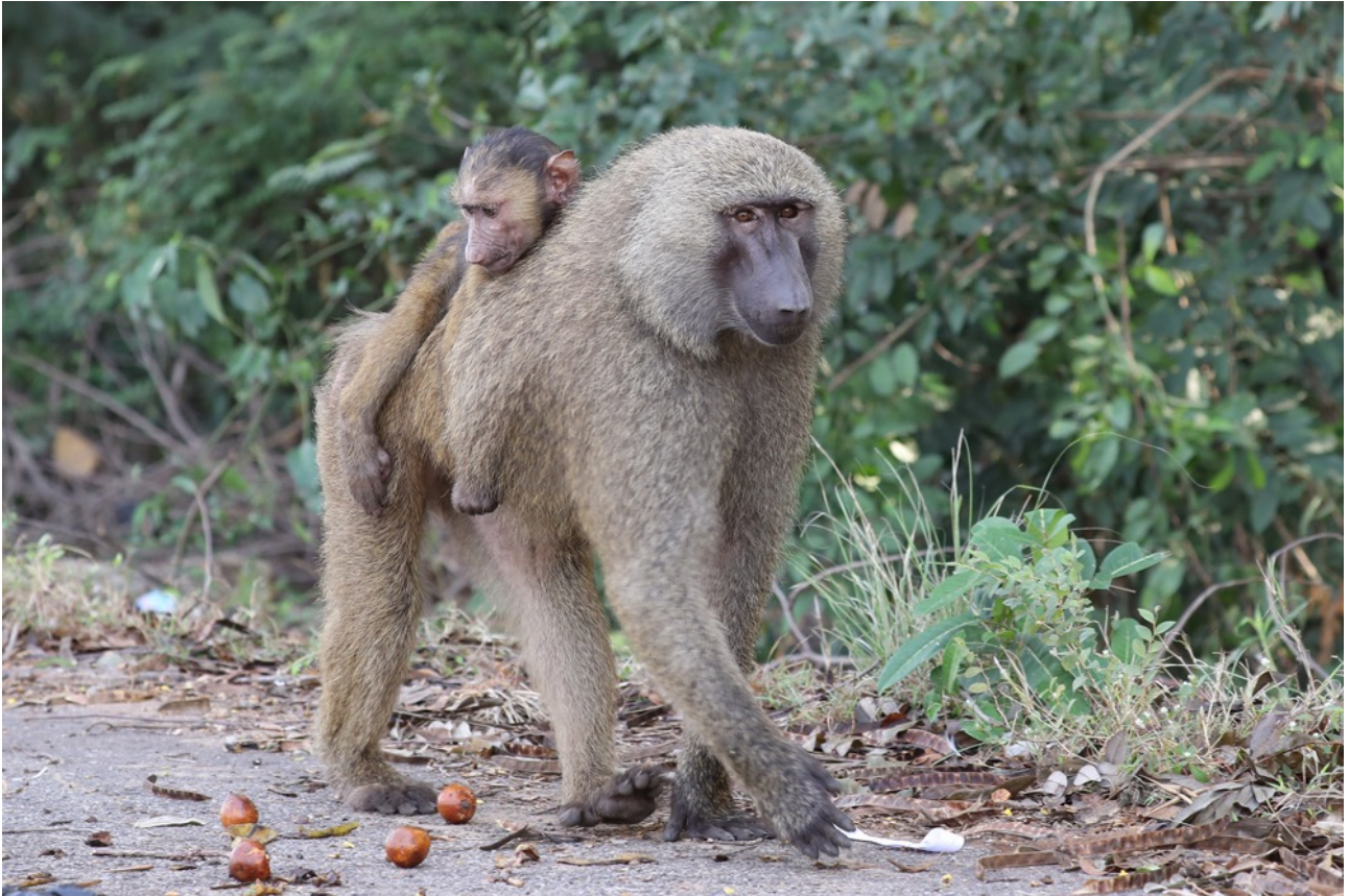
Olive Baboon (above) and a male Kob (below) were both seen well at Shai Hills.