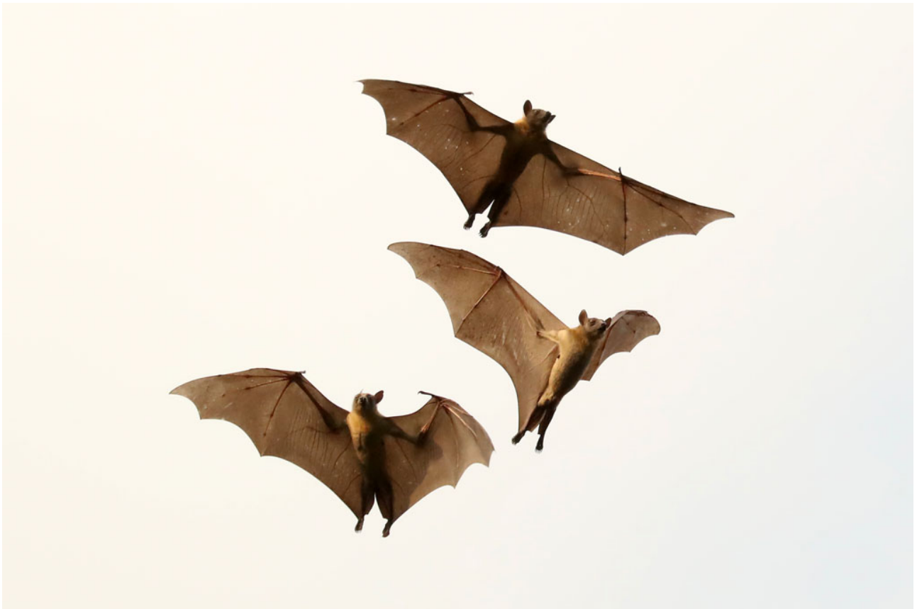
The huge colony of Straw-coloured Fruit Bats near Old Tafo was an impressive sight.