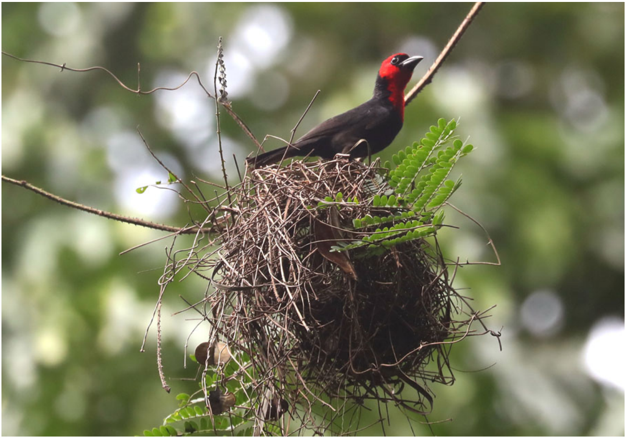
Crested Malimbe (above) and Blue-billed Malimbe (below) both by Roger Wasley