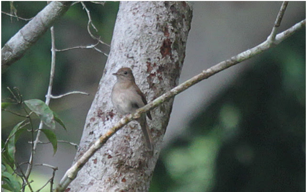
Olivaceous Flycatcher from the canopy walkway in Kakum (above) and Chocolate-backed Kingfisher posed for us whilst birding in Ankasa (below)