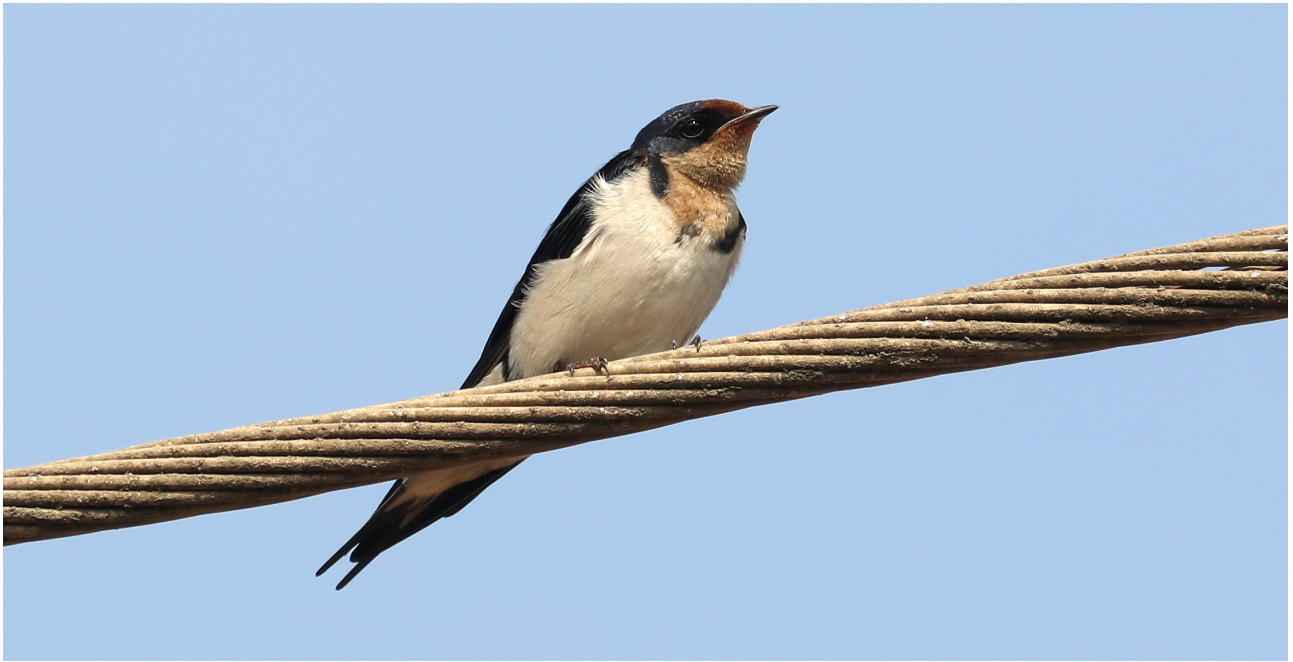
Ethiopian Swallow (above)