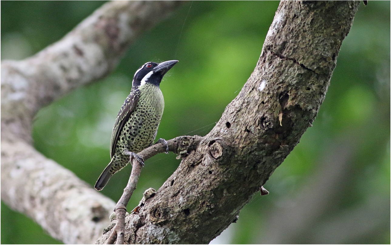
Hairy-breasted Barbet (above) and a pair of Hartlaub's Duck (below)