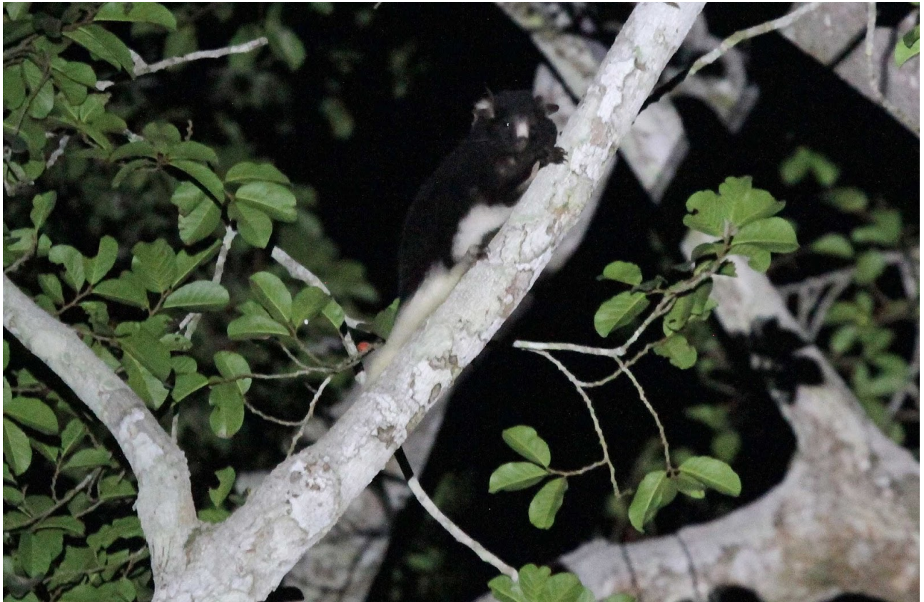
Pel's Anomalure, a gliding scaly-tailed squirrel, was seen in Kakum at night (above) Male Rock Agama (below)