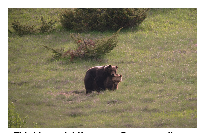
Third bear sighting, near Pescasseroli