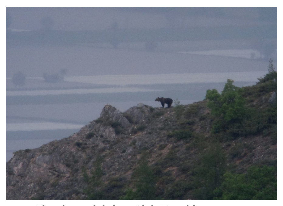
First bear sighting, Gioia Vecchio