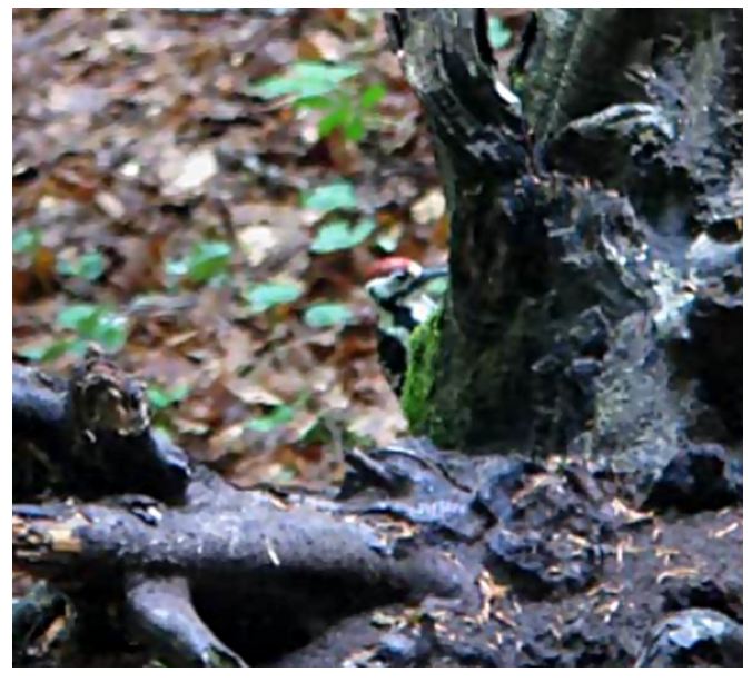
White-backed (Lilford's) Woodpecker, Difesa Forest