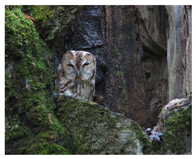
Tawny Owl, Difesa Forest