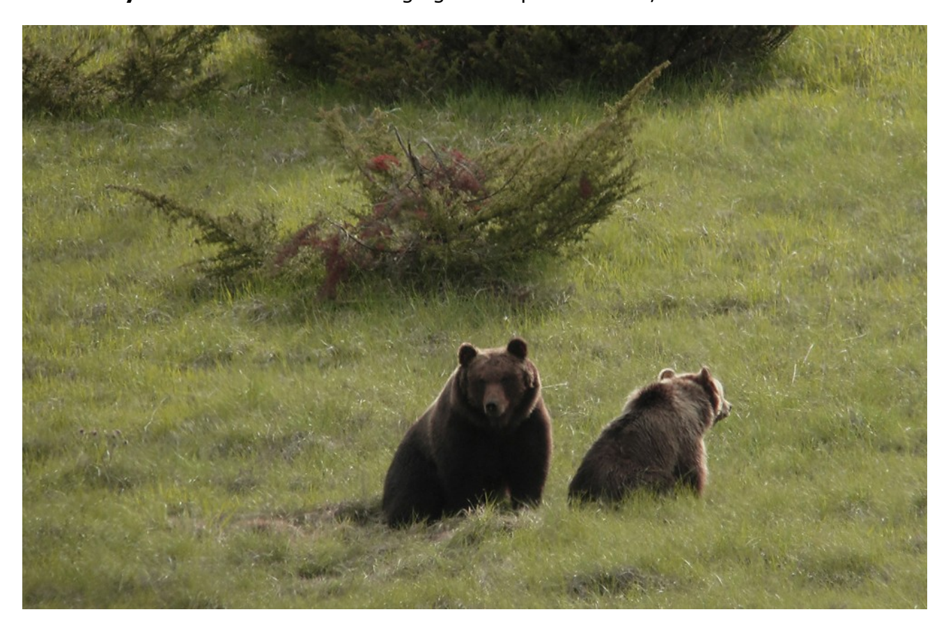
These two fantastic Marsican Brown Bears were watched for an hour on our last morning in Abruzzo.

White-backed (Lilford's) Woodpecker: A male seen very well on two days. Collared Flycatcher: A number of singing males plus females, both seen well.