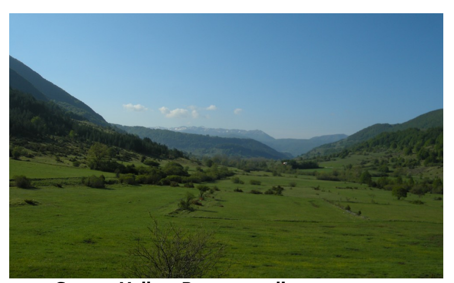
Sangro Valley, Pescasseroli

This is an EU-funded project aiming to find the best ways to assure a co-existence between bears and human activities. This is a joint effort of several institutions and organizations, including WWF Italy. The project focuses on working with local shepherds and looking at livestock husbandry to try and resolve any negative views towards bears. The project invests some money for protecting livestock from possible bear attacks, through donating electric fences to shepherds. The project also investigates any potential risks from the transmission of livestock diseases to bears and other wild fauna. The project works together with researchers to get reliable estimates of the bear populations through non invasive methods, such as the genetic analysis of hair. A lot of time is also invested in raising public awareness on the importance of this special animal.