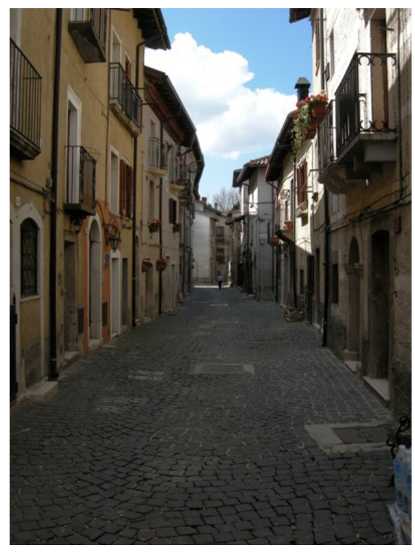
Historic Pescasseroli near our guest house