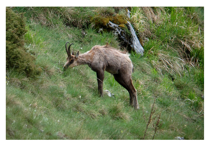
Apennine Chamois, Monte Amaro