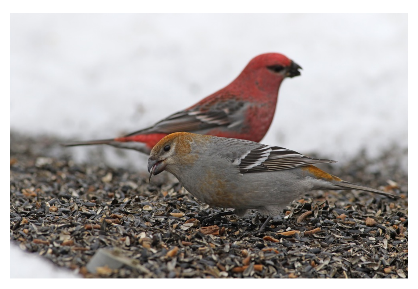
Pine Grosbeaks were seen well on a number of occasions and allowed great photographic opportunities