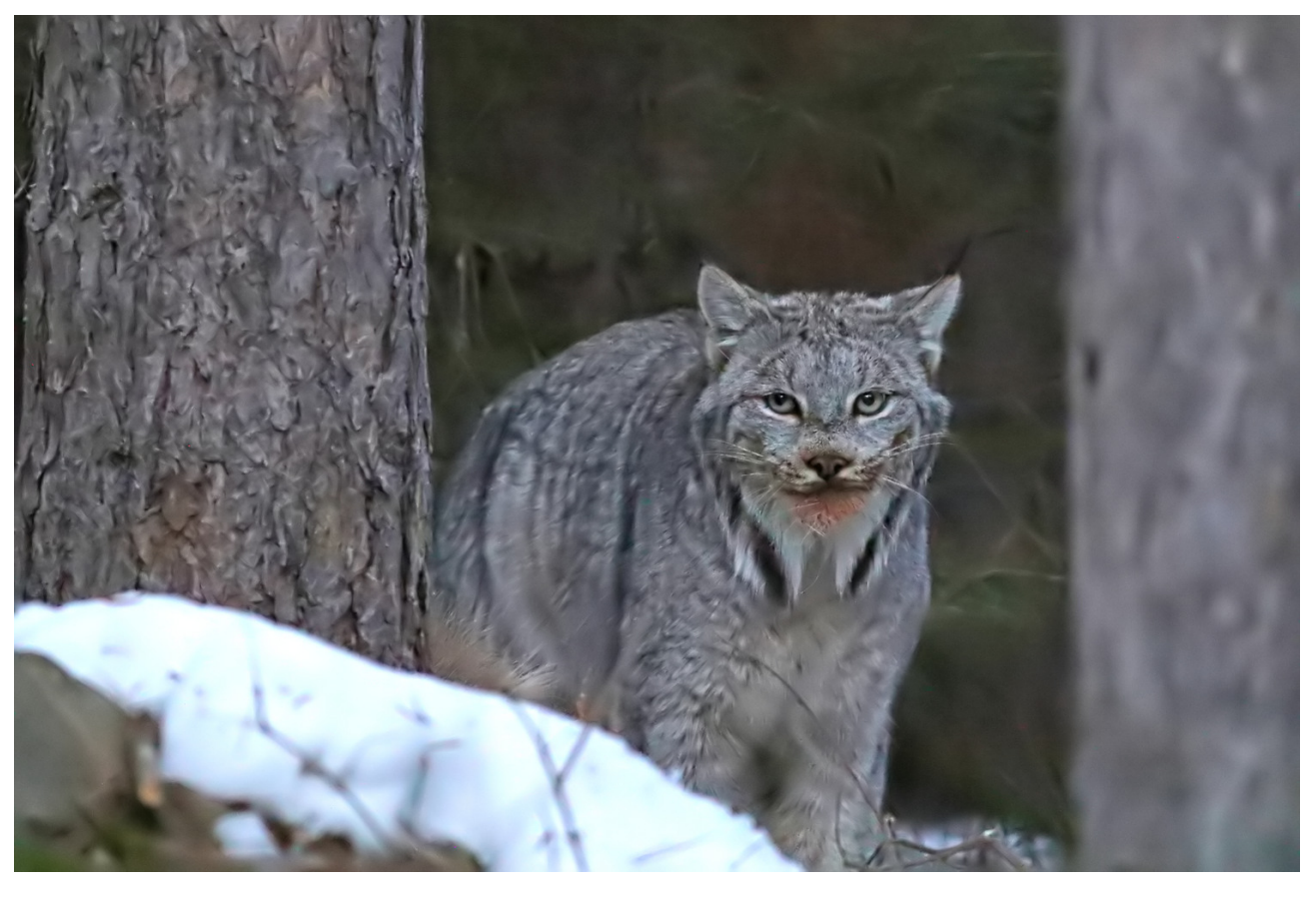
WISE BIRDING HOLIDAYS LTD - USA, MINNESOTA: Canada Lynx Quest, Feb 2017