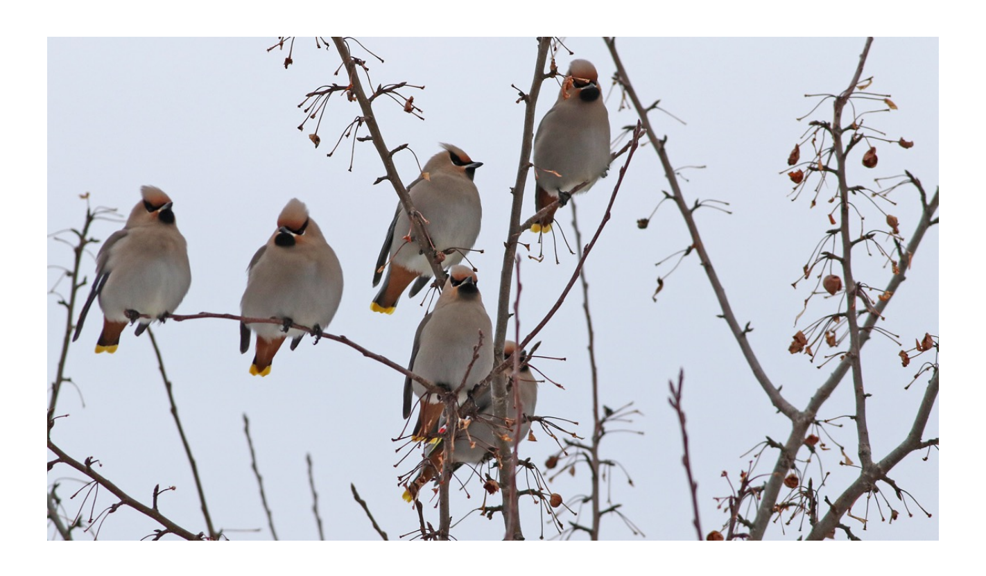
Bohemian Waxwings showed well near Thunder Bay