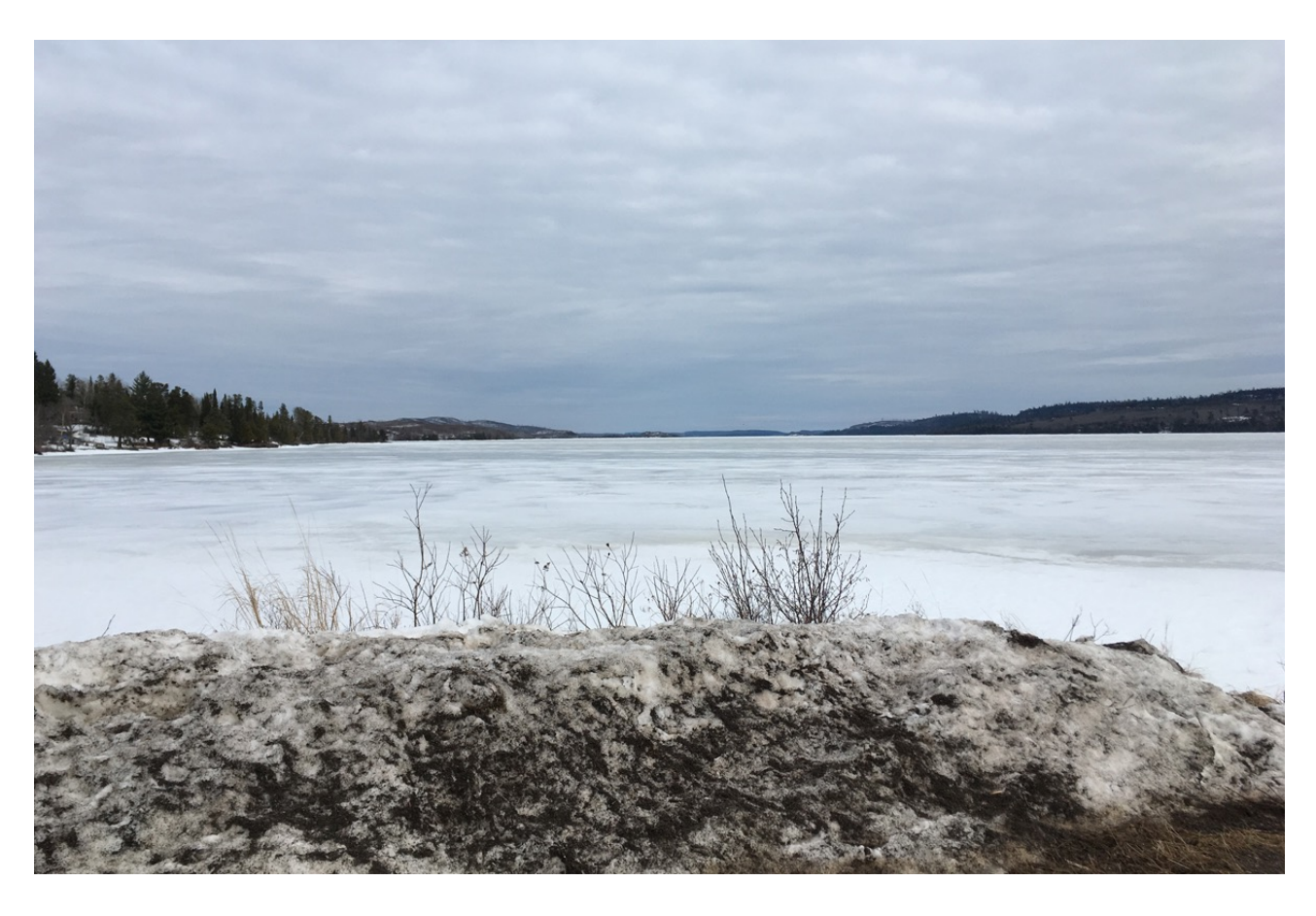
Gunflint Lake, the border of Canada and the US (above) and male Spruce Grouse (below)