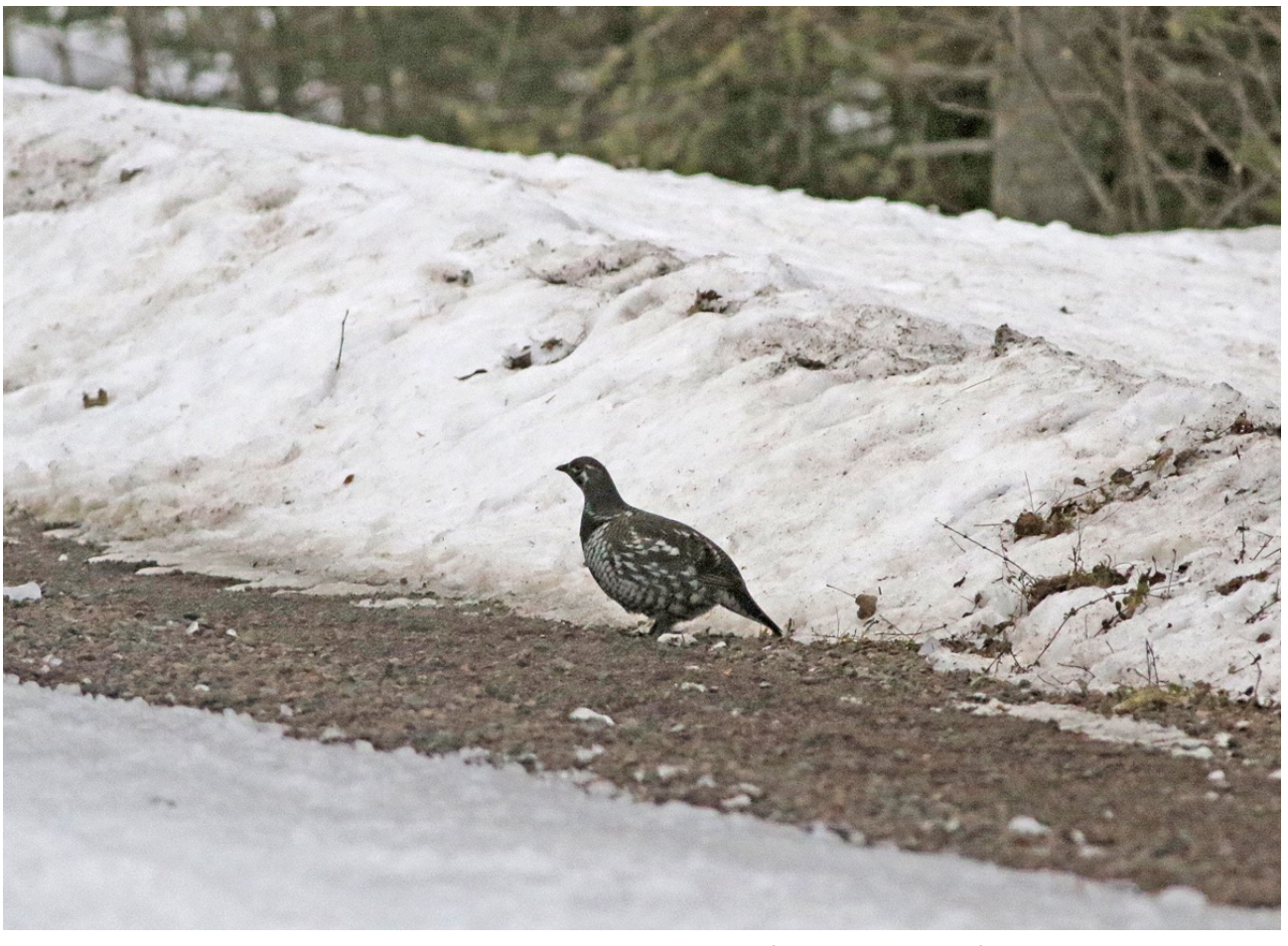
WISE BIRDING HOLIDAYS LTD - USA, MINNESOTA: Canada Lynx Quest, Feb 2017