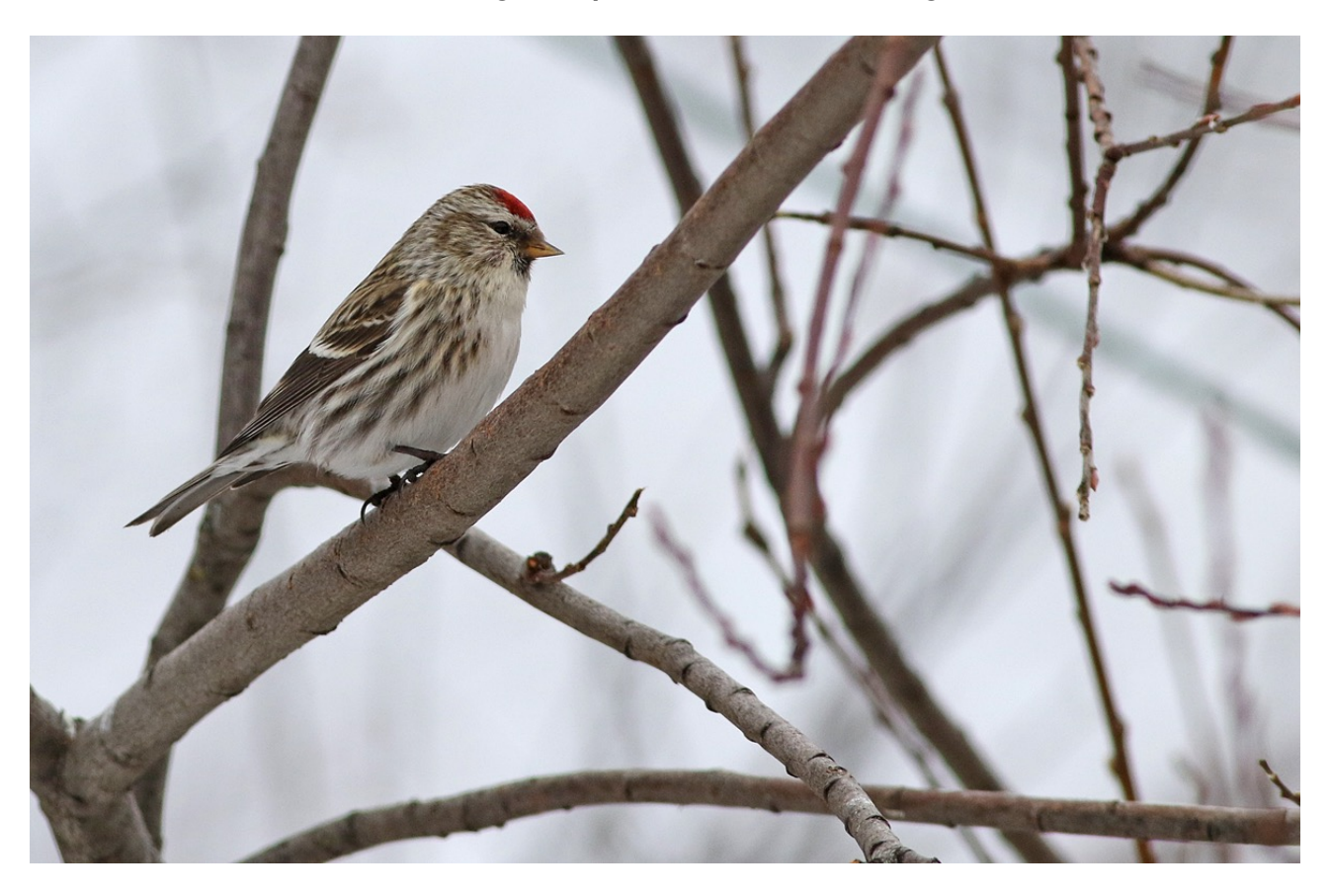
WISE BIRDING HOLIDAYS LTD - USA, MINNESOTA: Canada Lynx Quest, Feb 2017