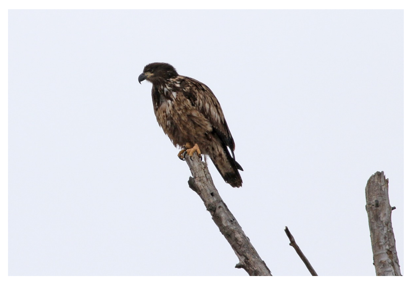
Immature Bald Eagle (above) along the shore of Lake Superior and the Great Grey Owl hunting area (below)