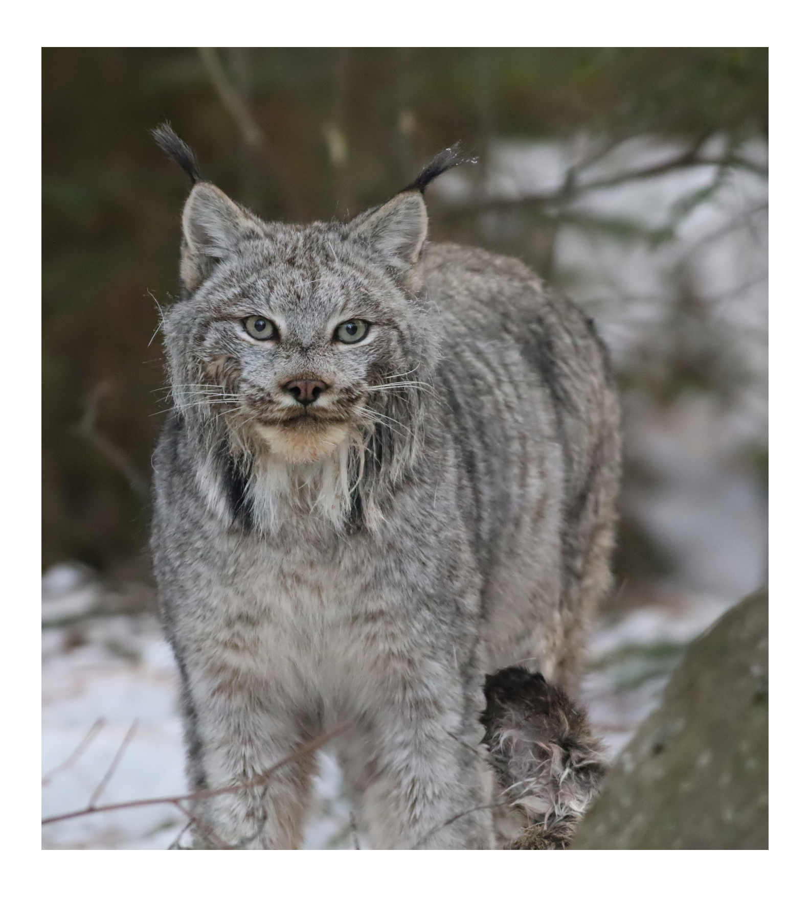
The beautiful Canada Lynx showed again on our final morning.

After having fed on the deer carcass for over an hour, the Lynx came out into the open and seemed inquisitive of our presence. It looked straight at us for a few moments and then slinked back into the forest - A moment never to forget!