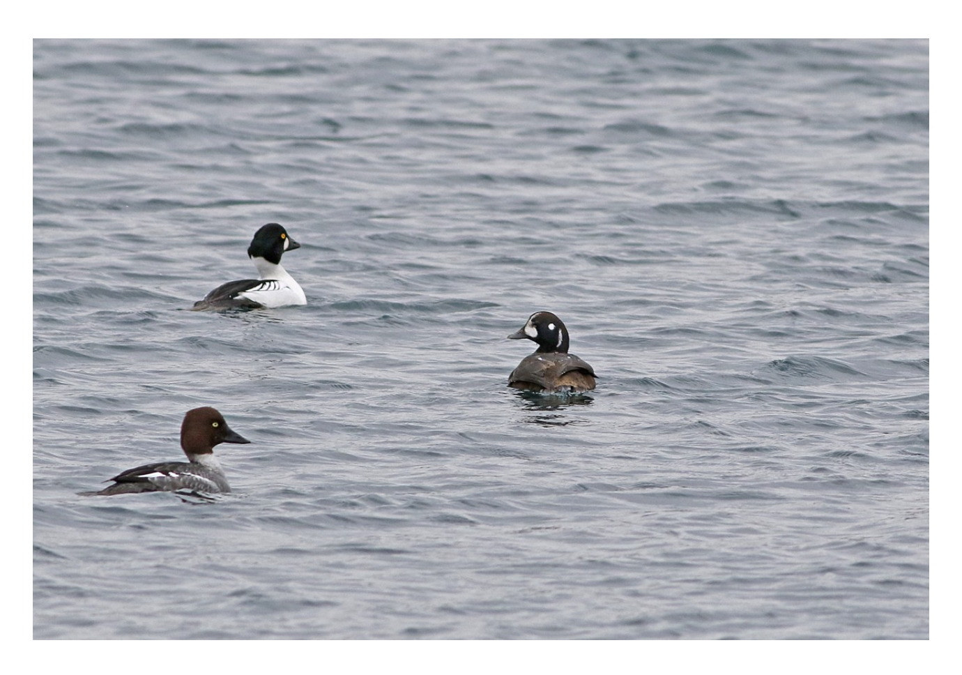
Grand Marais Harbour hosted male Harlequin Duck (above) and Bufflehead (below) Both species were associating with Common Goldeneyes