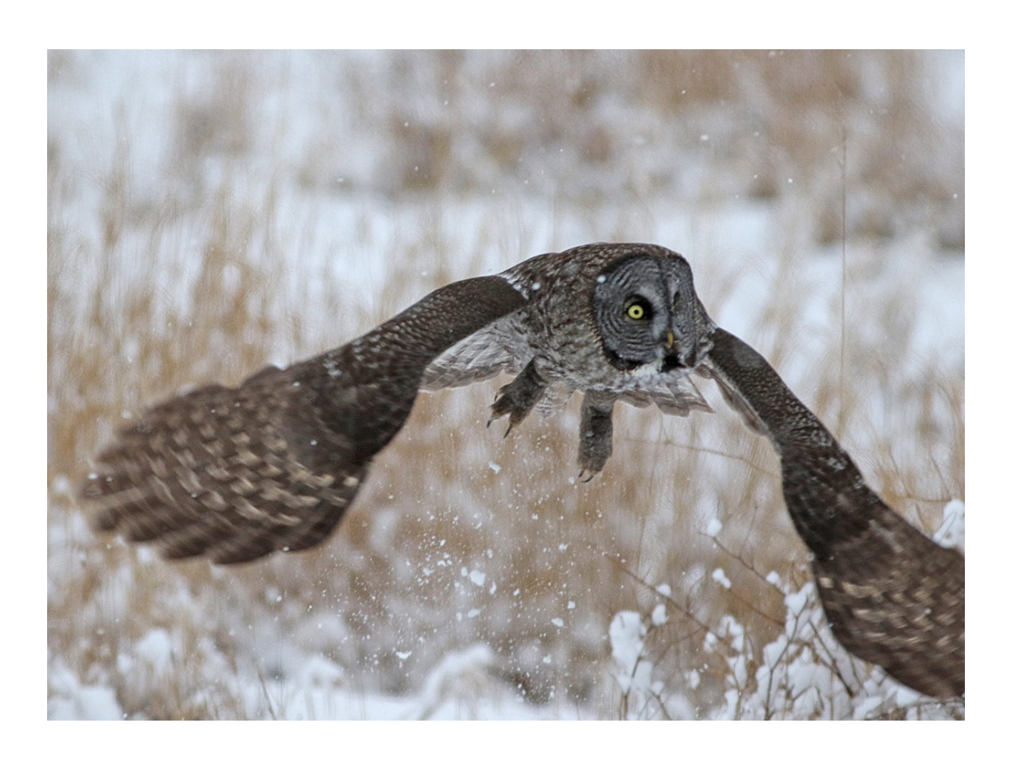
The Great Grey Owl hunting in the snow was a clear tour highlight