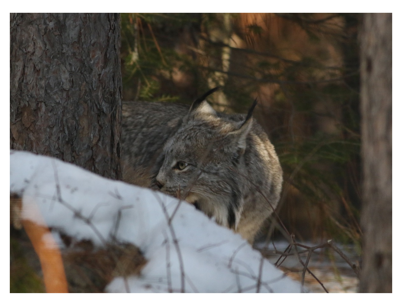
Our very first view of the Lynx (above) and the animal after having fed well (below)