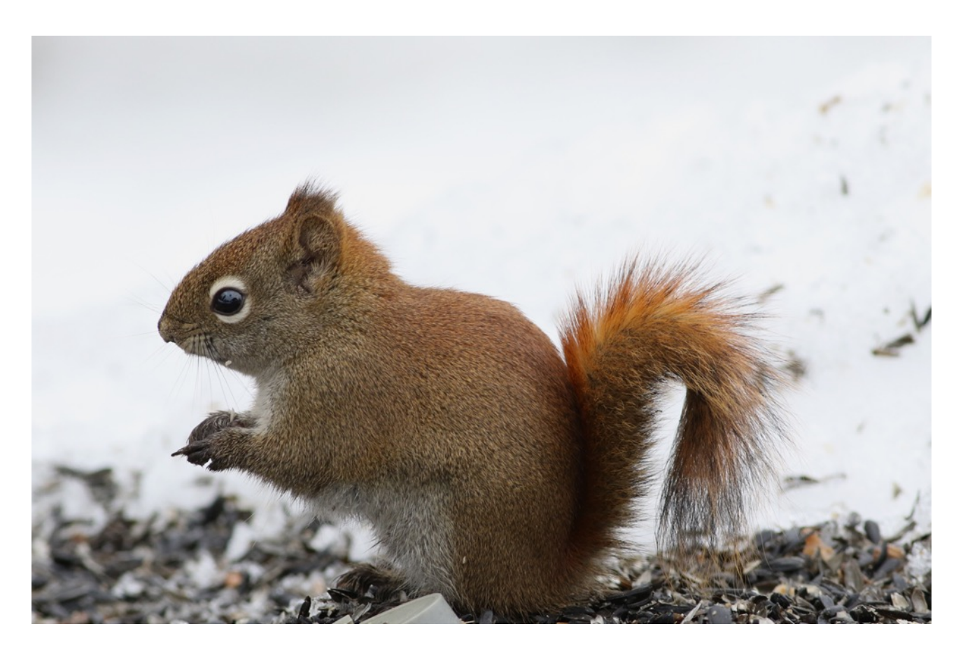
American Red Squirrel (above) and Northern Flying Squirrel (below)