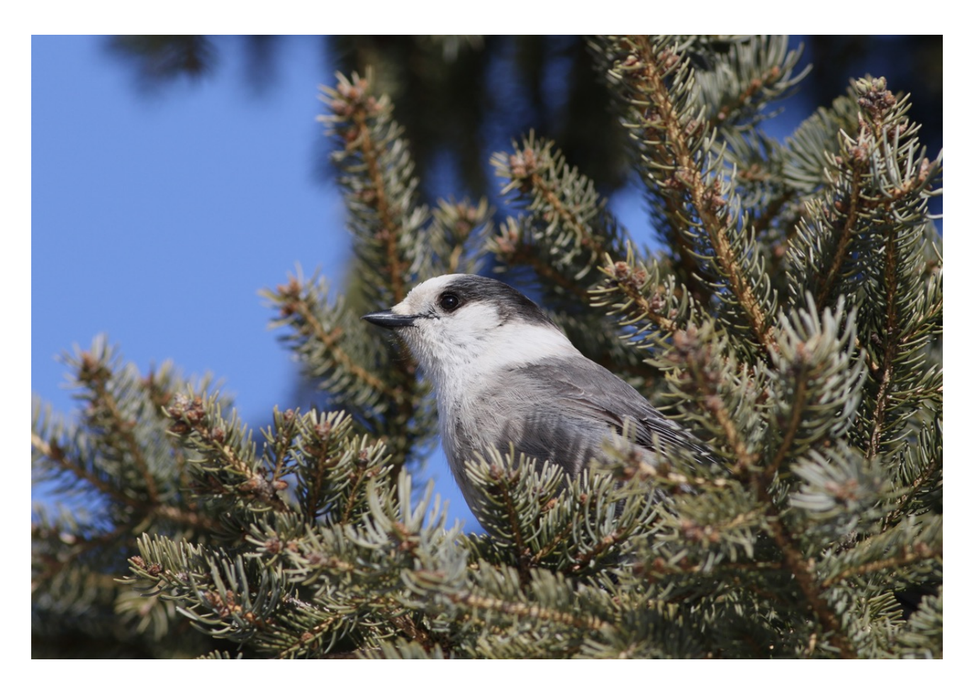
Grey Jays were seen most days (above) and the impressive Pileated Woodpecker showed very well at Gunflint Lodge (below)