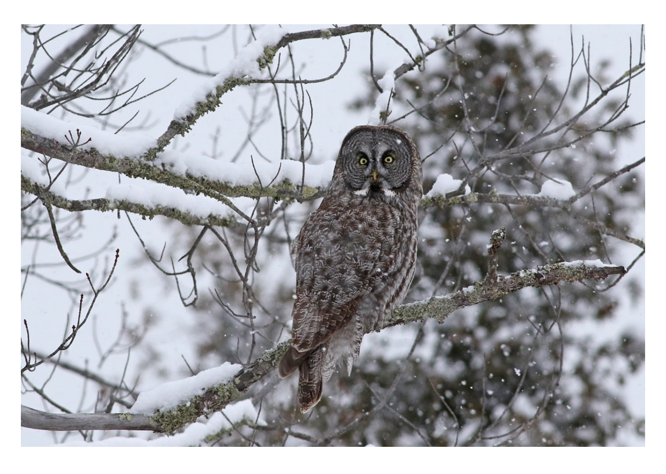
WISE BIRDING HOLIDAYS LTD - USA, MINNESOTA: Canada Lynx Quest, Feb 2017