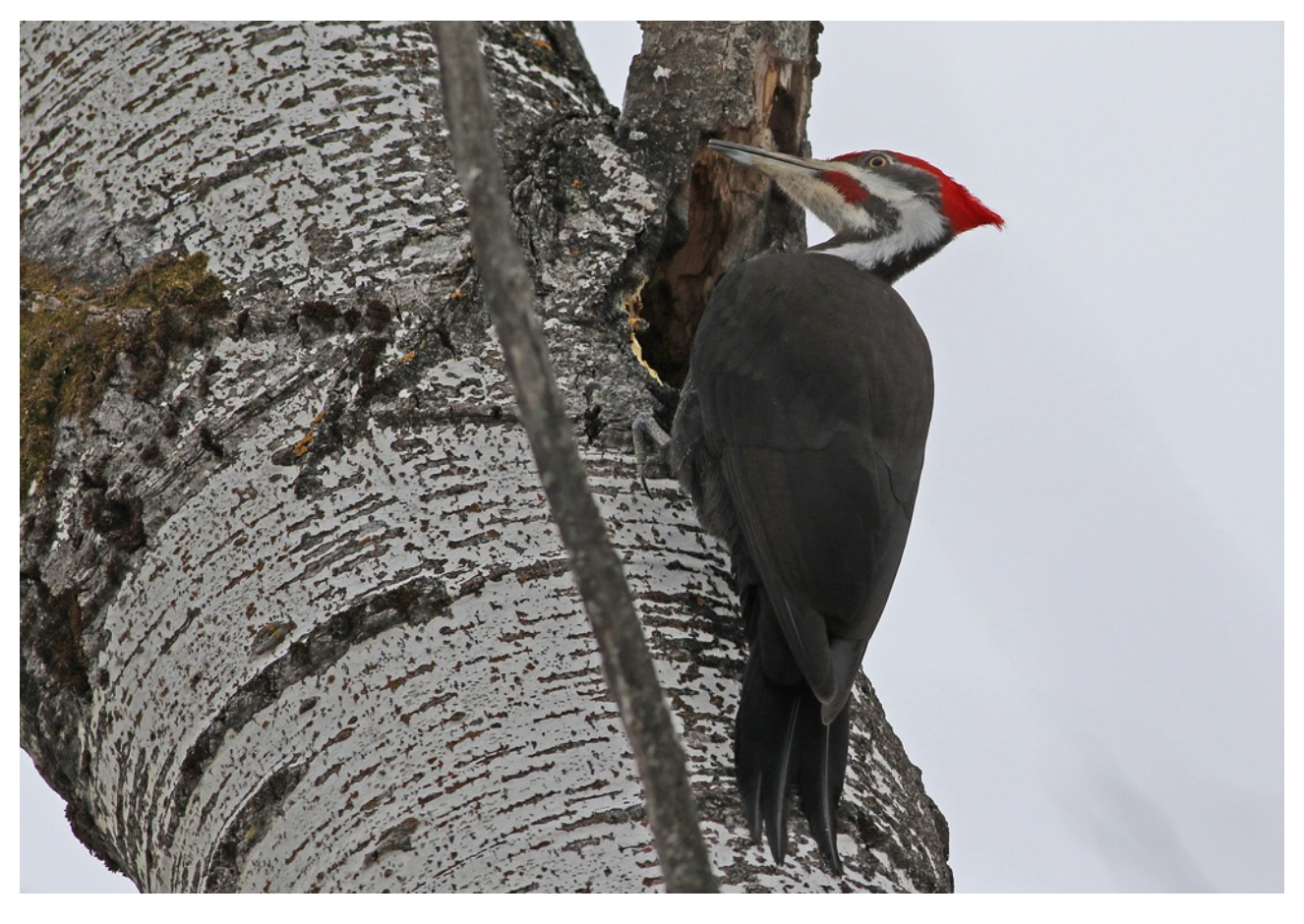
WISE BIRDING HOLIDAYS LTD - USA, MINNESOTA: Canada Lynx Quest, Feb 2017