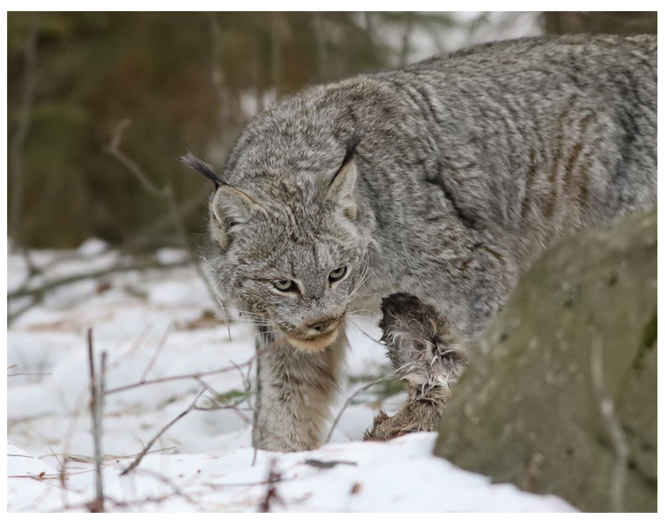
WISE BIRDING HOLIDAYS LTD – USA, MINNESOTA: Canada Lynx Quest, Feb 2017