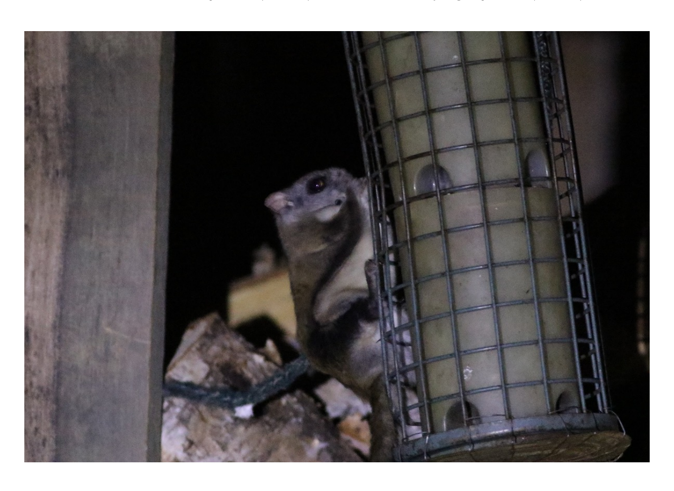
WISE BIRDING HOLIDAYS LTD – USA, MINNESOTA: Canada Lynx Quest, Feb 2017