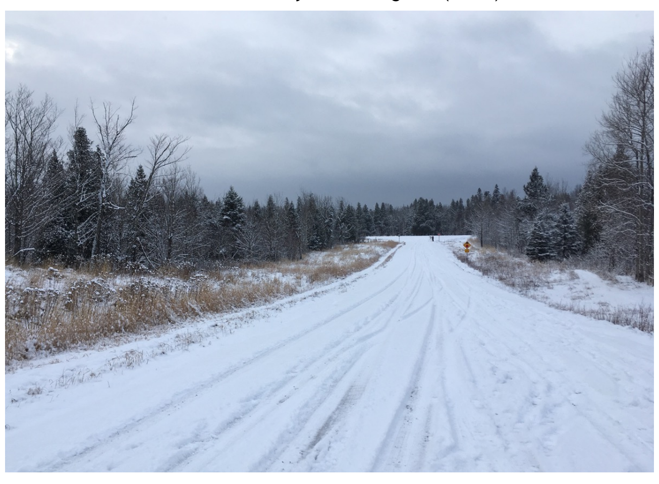
WISE BIRDING HOLIDAYS LTD – USA, MINNESOTA: Canada Lynx Quest, Feb 2017