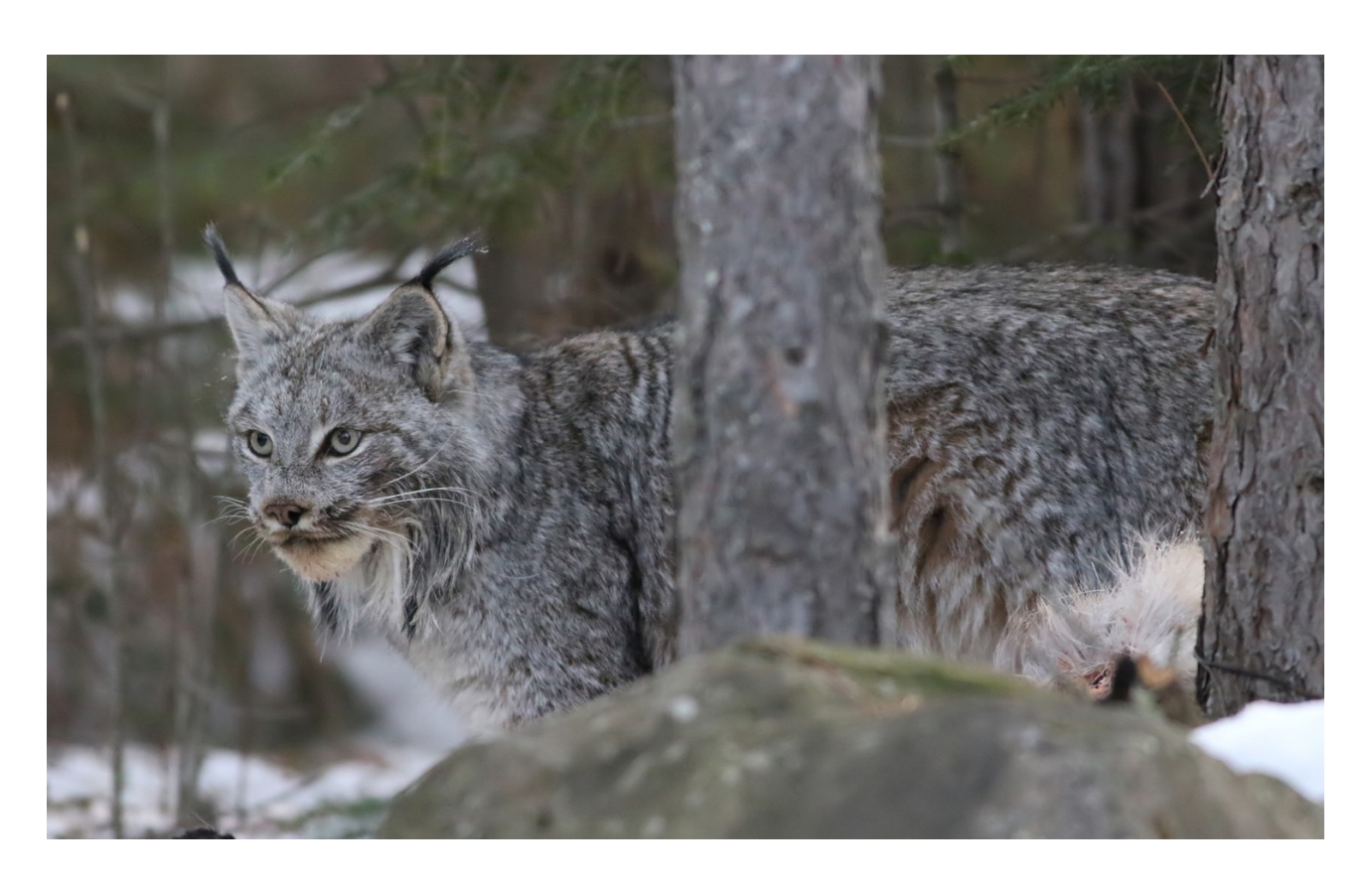
The beautiful Canada Lynx showed again on our final morning