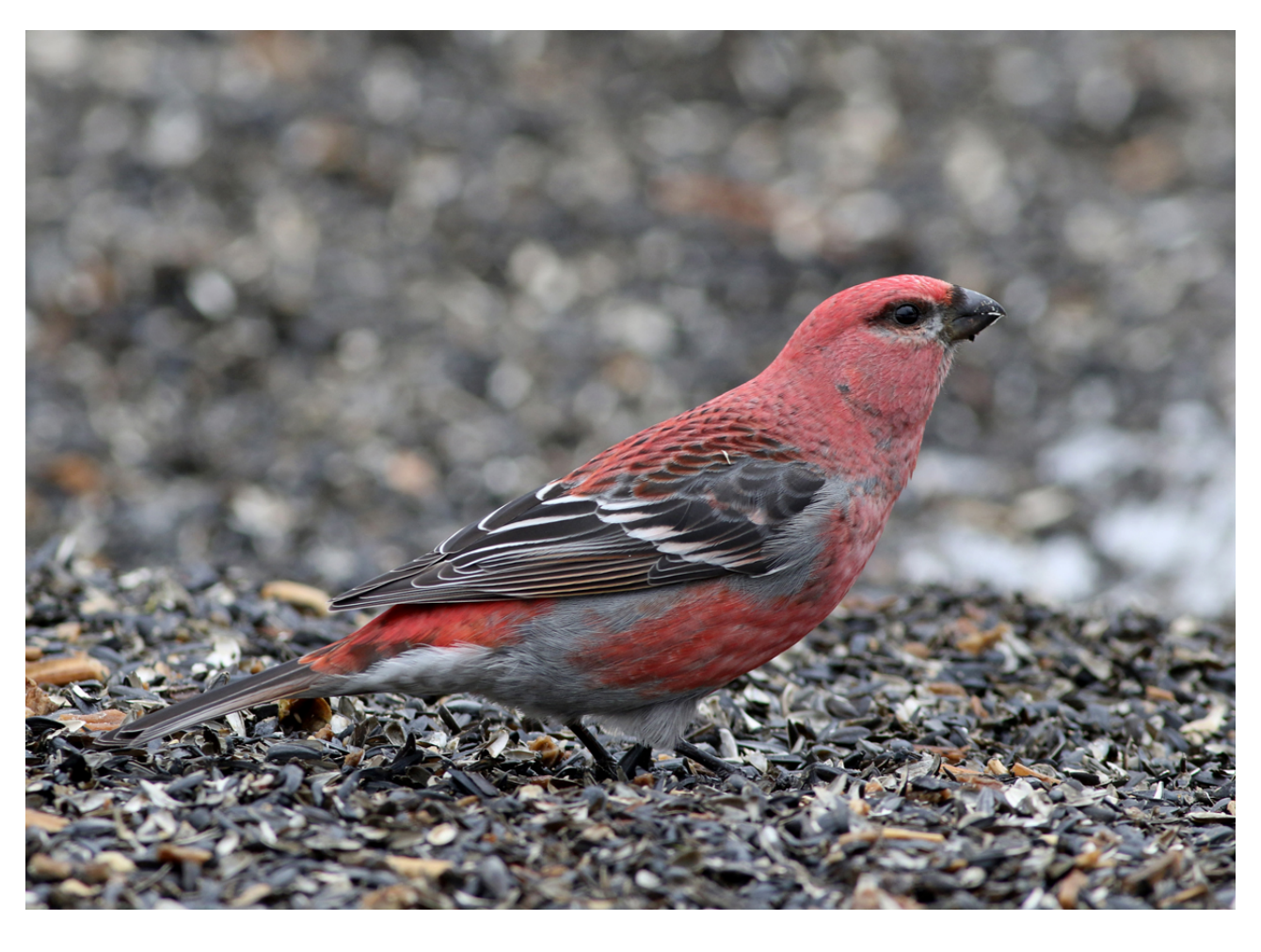
WISE BIRDING HOLIDAYS LTD - USA, MINNESOTA: Canada Lynx Quest, Feb 2017