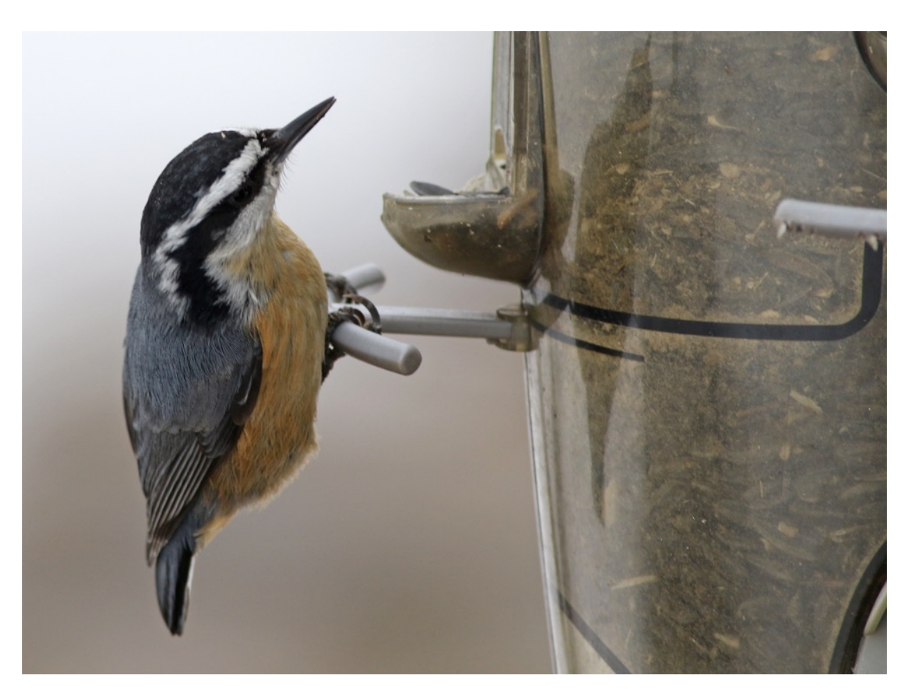
Red-breasted Nuthatches (above) and Common Redpolls (below) were a regular species found at feeding stations