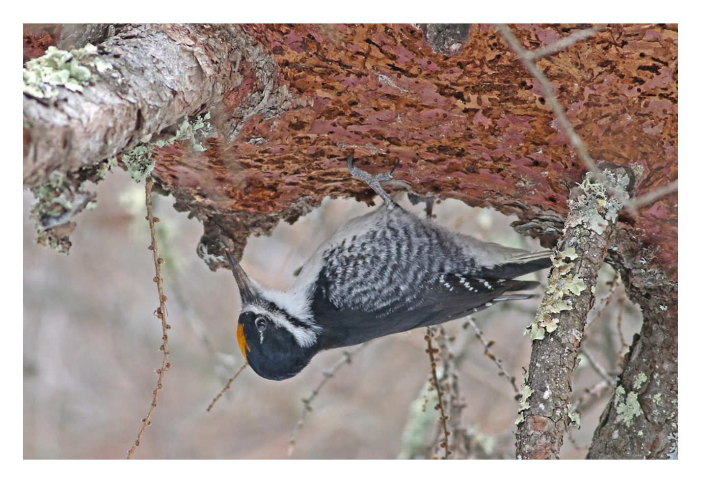
Male Black-backed Woodpecker (above) and Great Grey Owl (below)