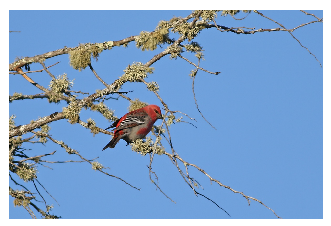
Male Pine Grosbeak (above) and male Spruce Grouse (below)