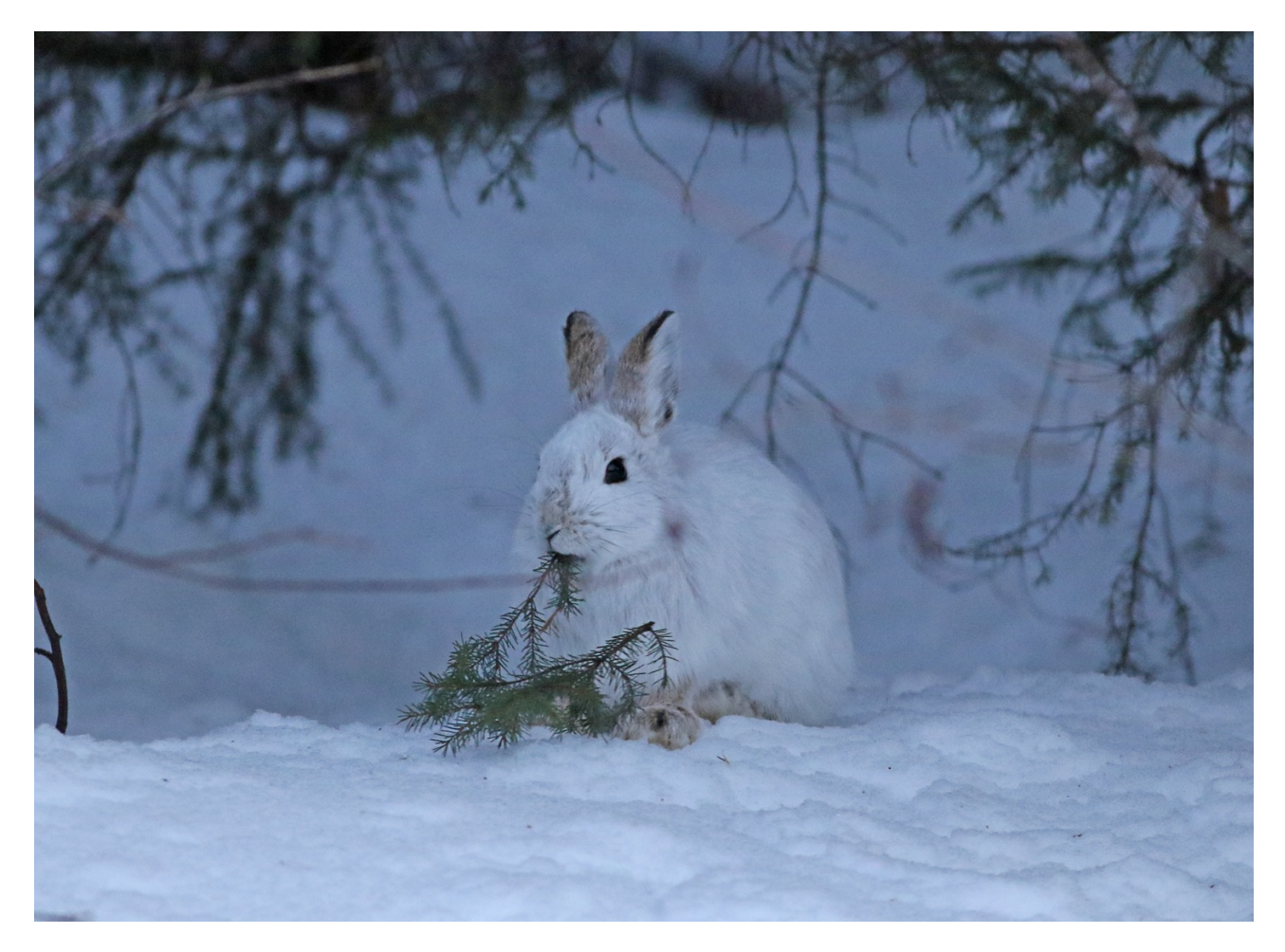
Snowshoe Hare (above) and Stoat (below)