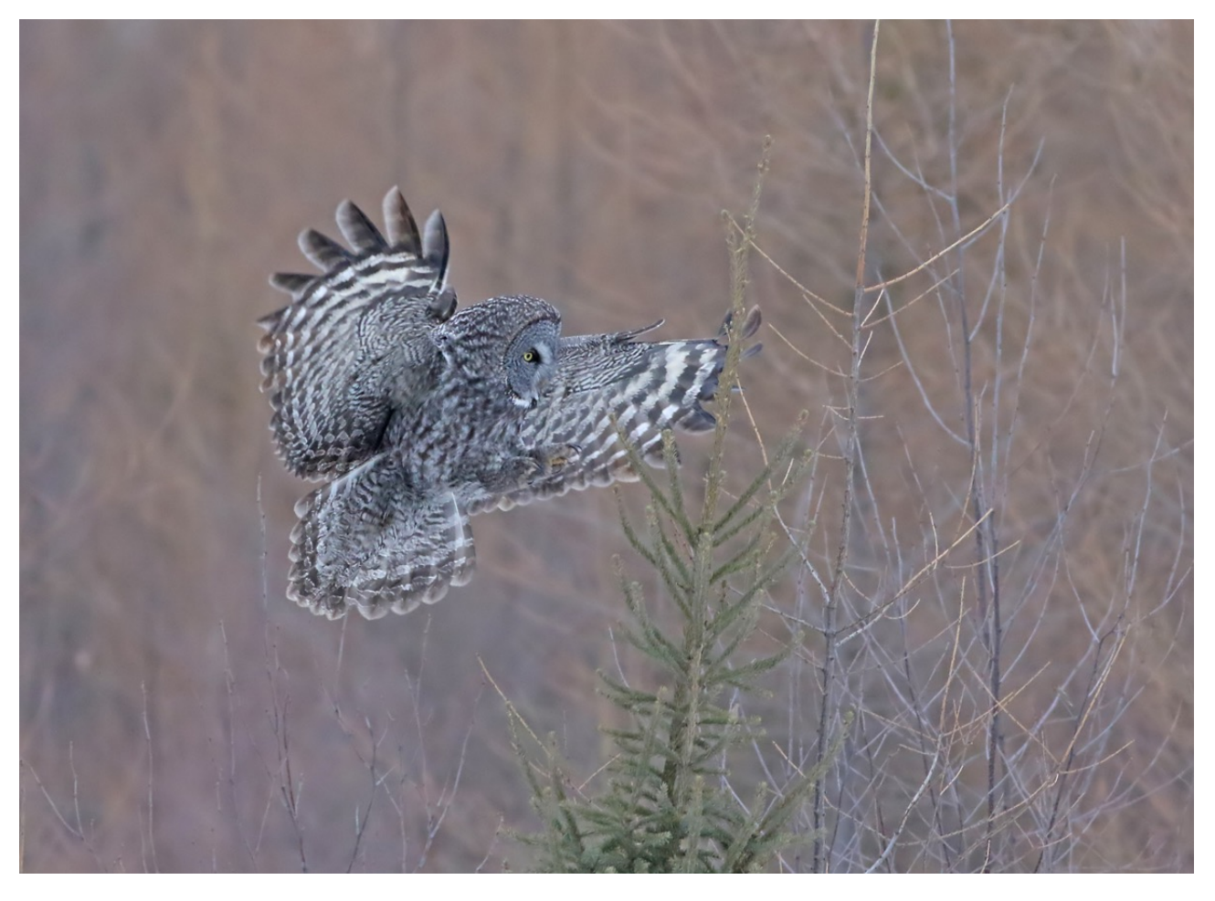
This Great Grey Owl at Sax Zim Bog performed incredibly well