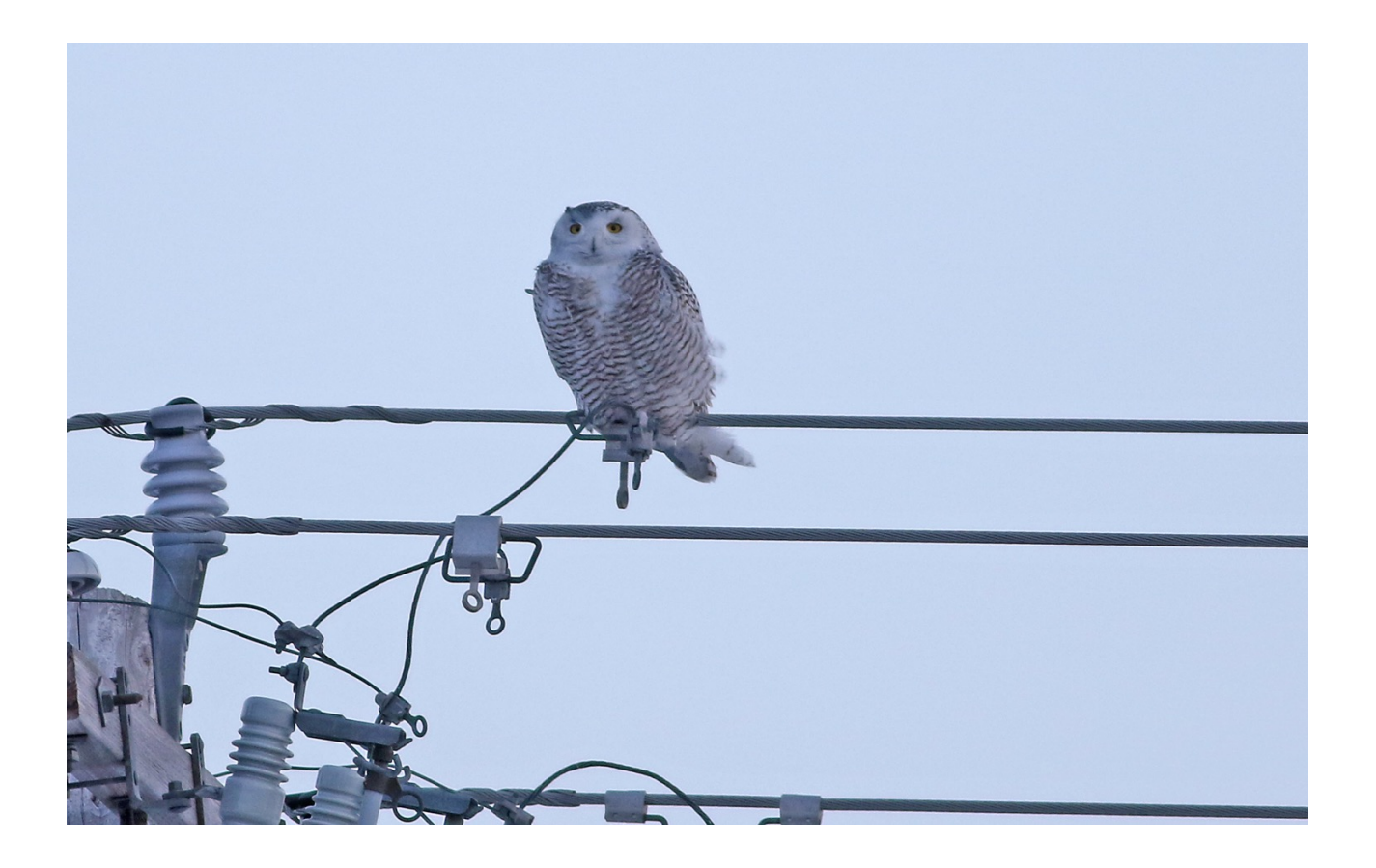
One of four Snowy Owls seen on one evening In flight by Andy Stanbury