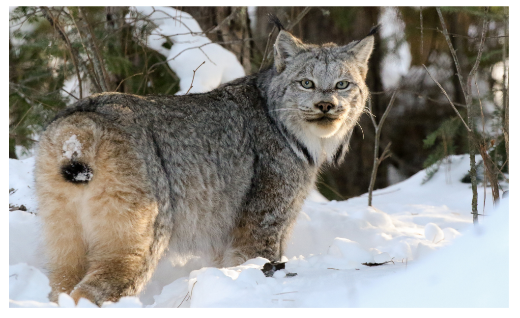
The undoubted highlight of the tour was seeing at least 3 different Canada Lynx for a number of hours!

Moose: Three animals on the Gunflint Trail on evening was a welcome sight particularly after the recent decline in numbers in the region.