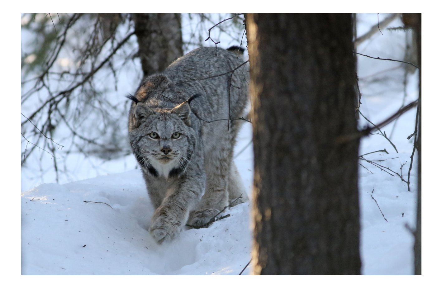
The Canada Lynx views this year were exceptional!