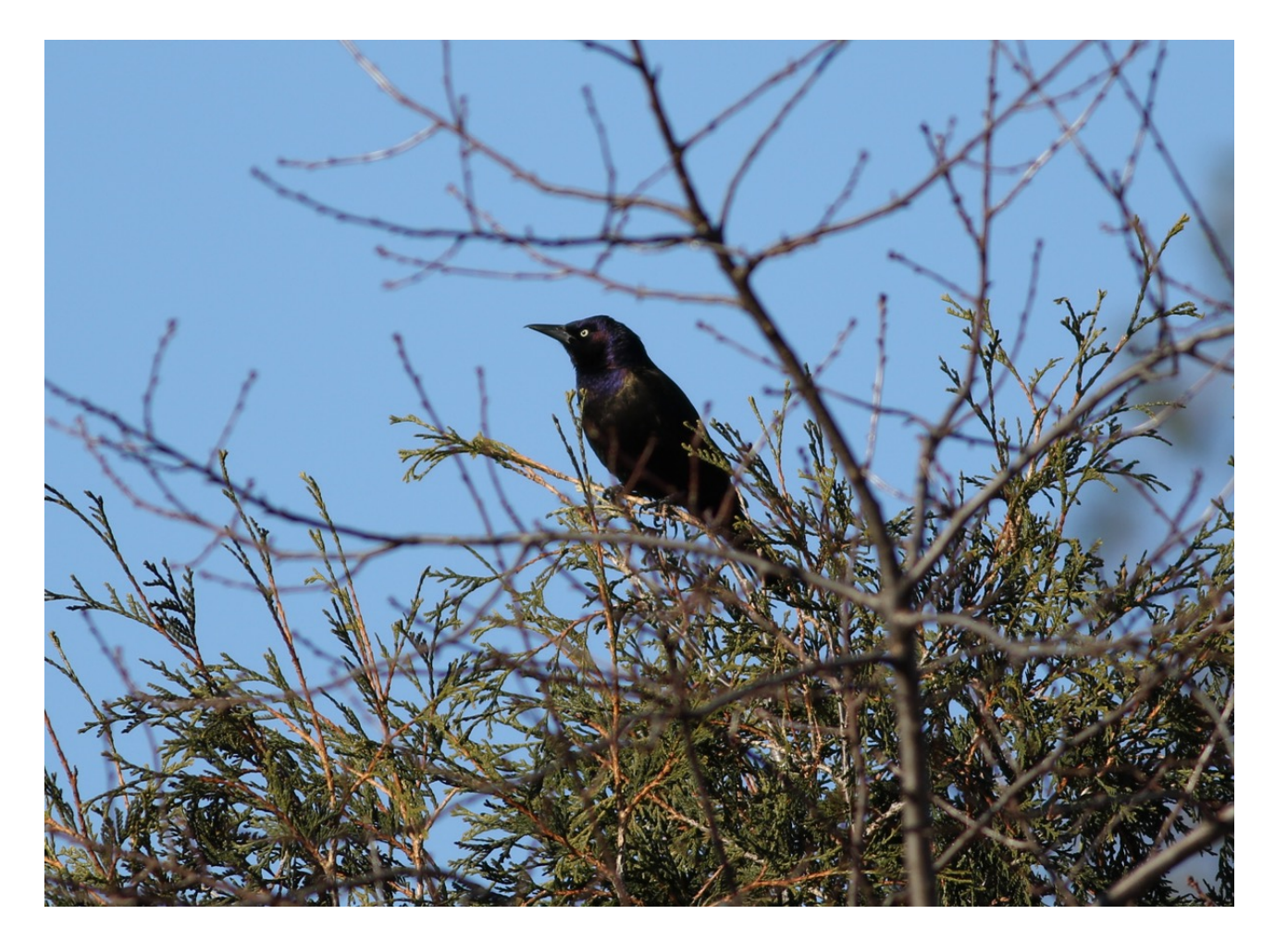
Common Grackle (above) and another Canada Lynx! (below)