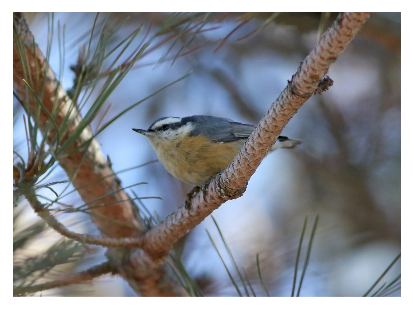
Red-breasted Nuthatch (above) and Black-capped Chickadee (below)