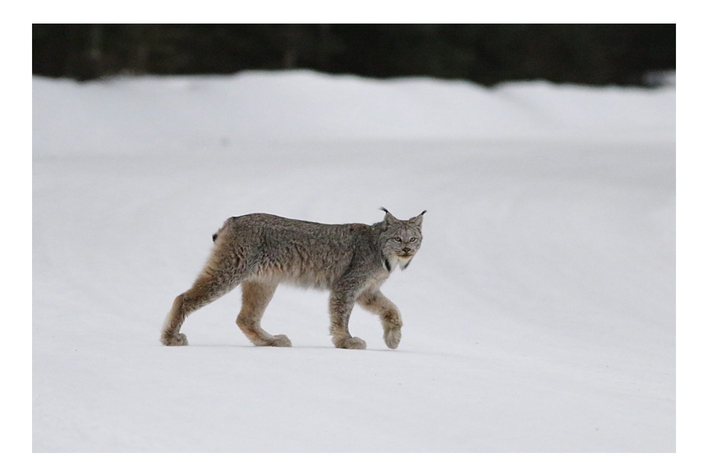
More Canada Lynx! Bottom photo by Andy Stanbury