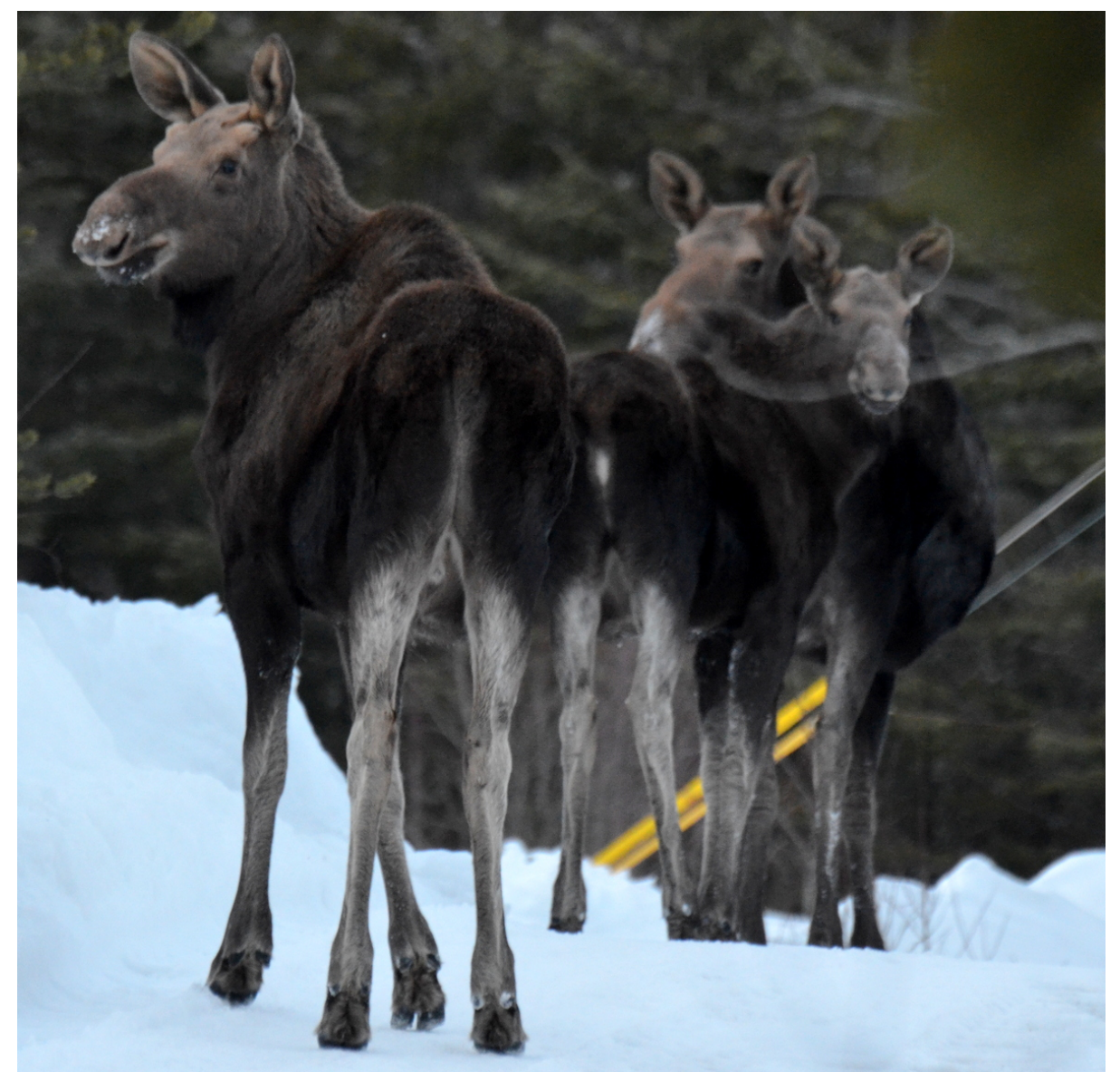
Moose (above) and Common Muskrat (below)