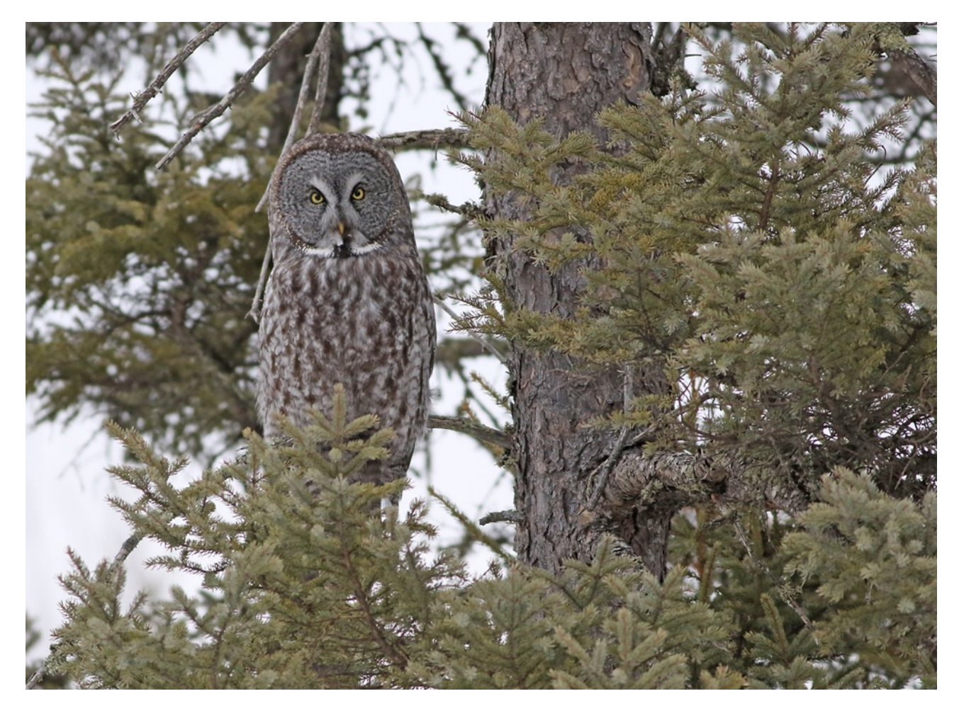
The hunting Great Grey Owl caught a vole just metres from us all!