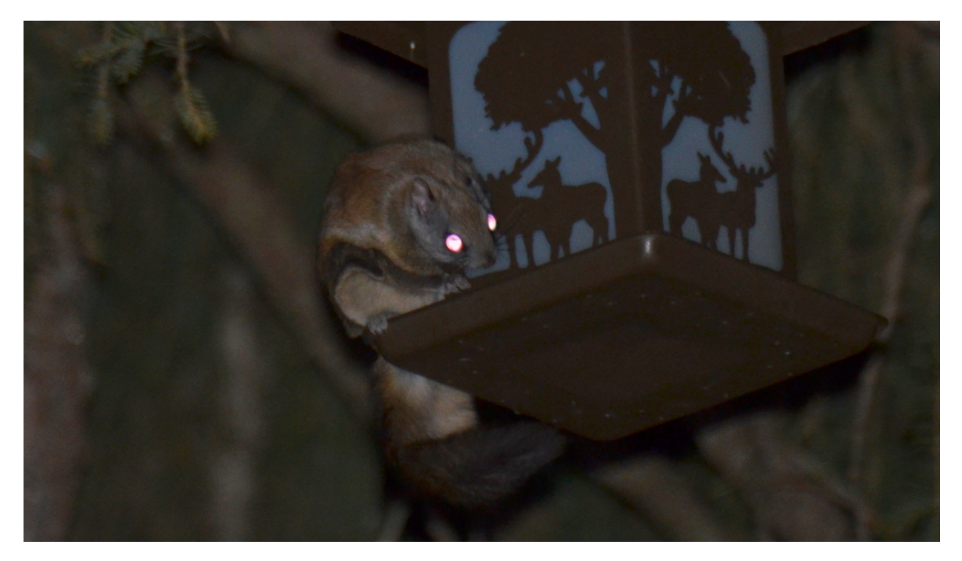
Northern Flying Squirrel (above) and American Red Squirrel (below)