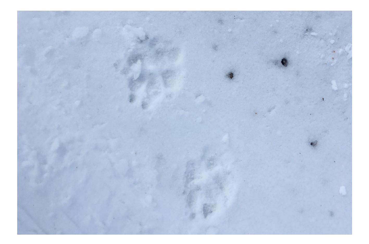
Wolf tracks (above) and Snowshoe Hare tracks (below)