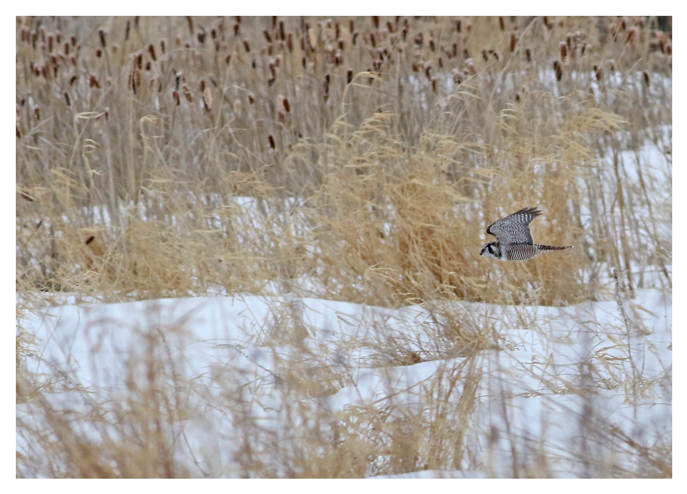
Northern Hawk Owl (above) and Boreal Owl (below)