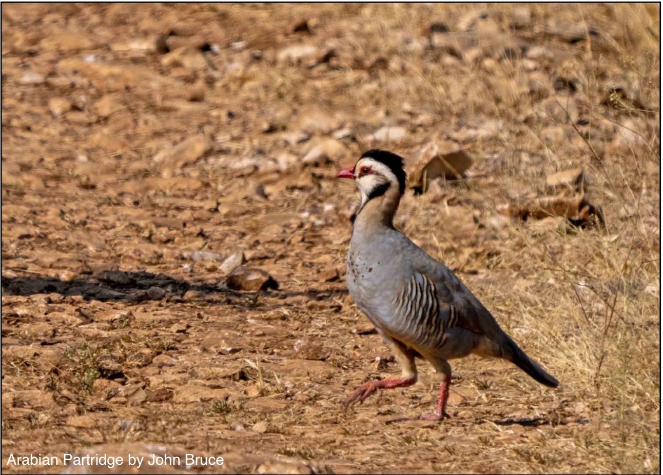
Arabian Partridge