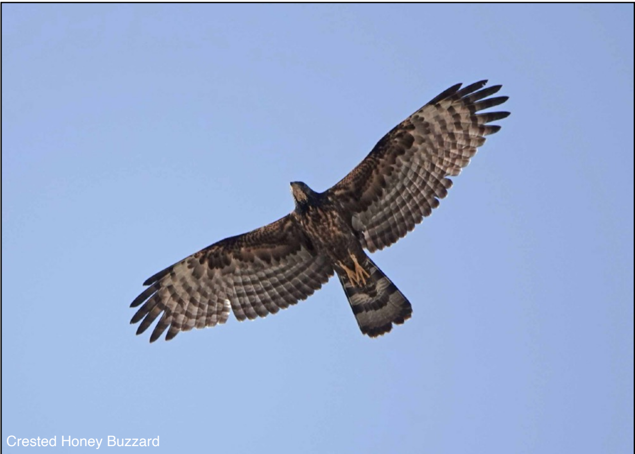
Crested Honey Buzzard