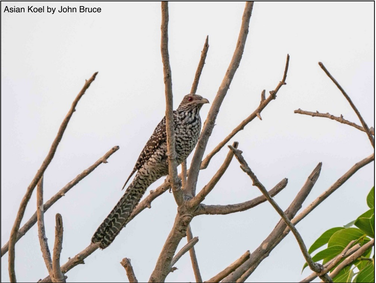
Asian Koel