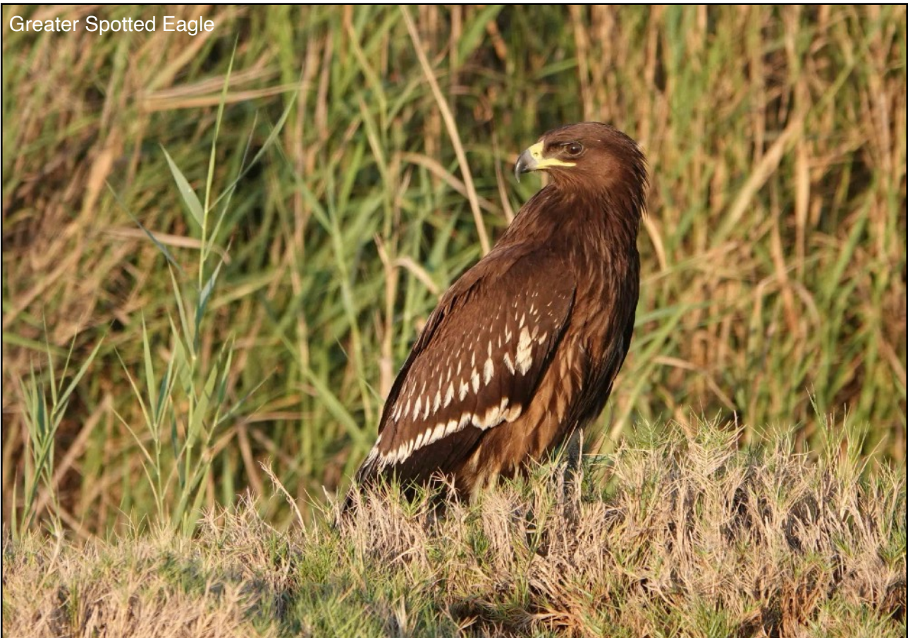
Greater Spotted Eagle