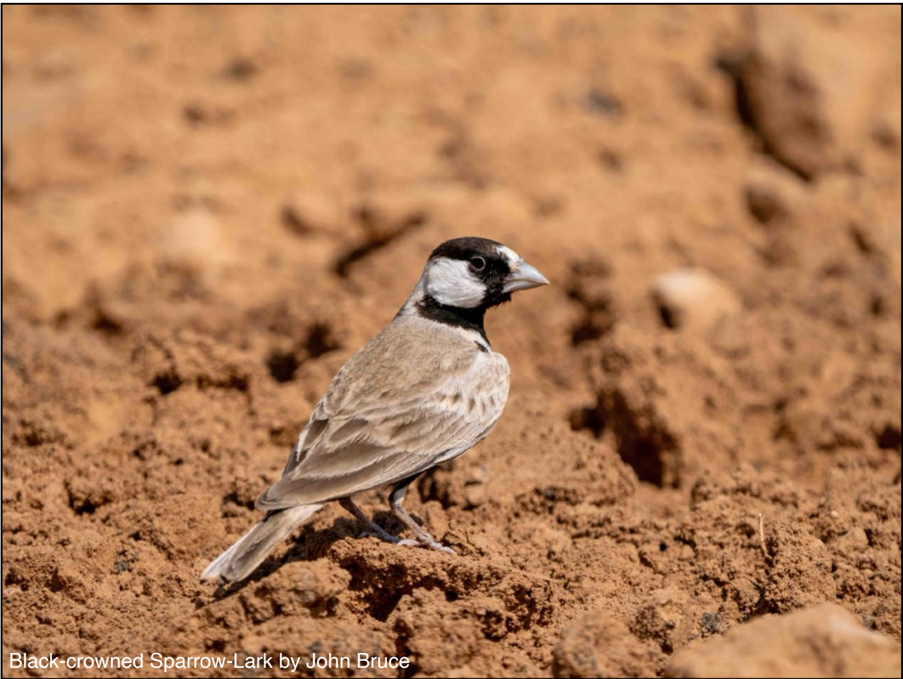
Black-crowned Sparrow-Lark