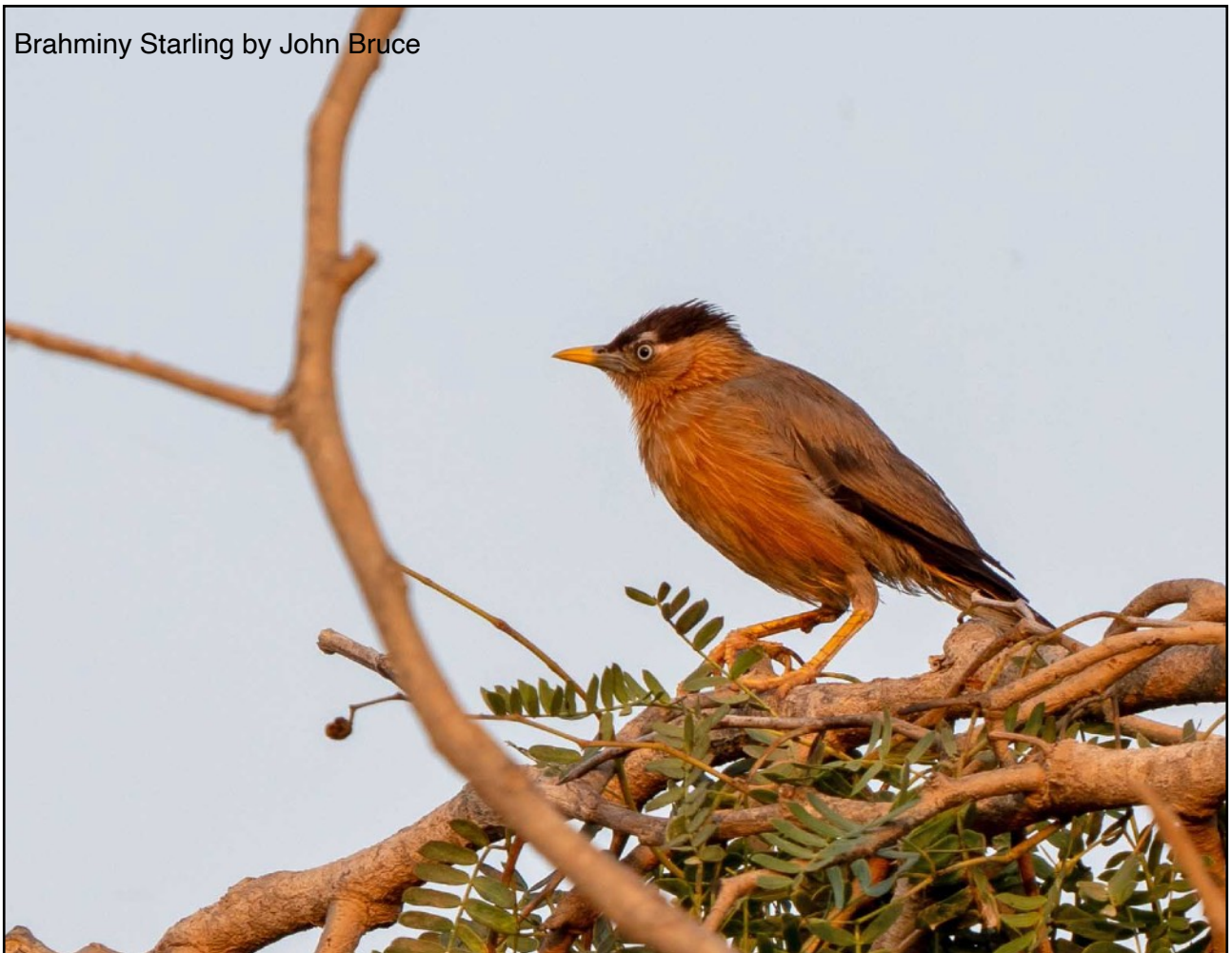
Brahminy Starling