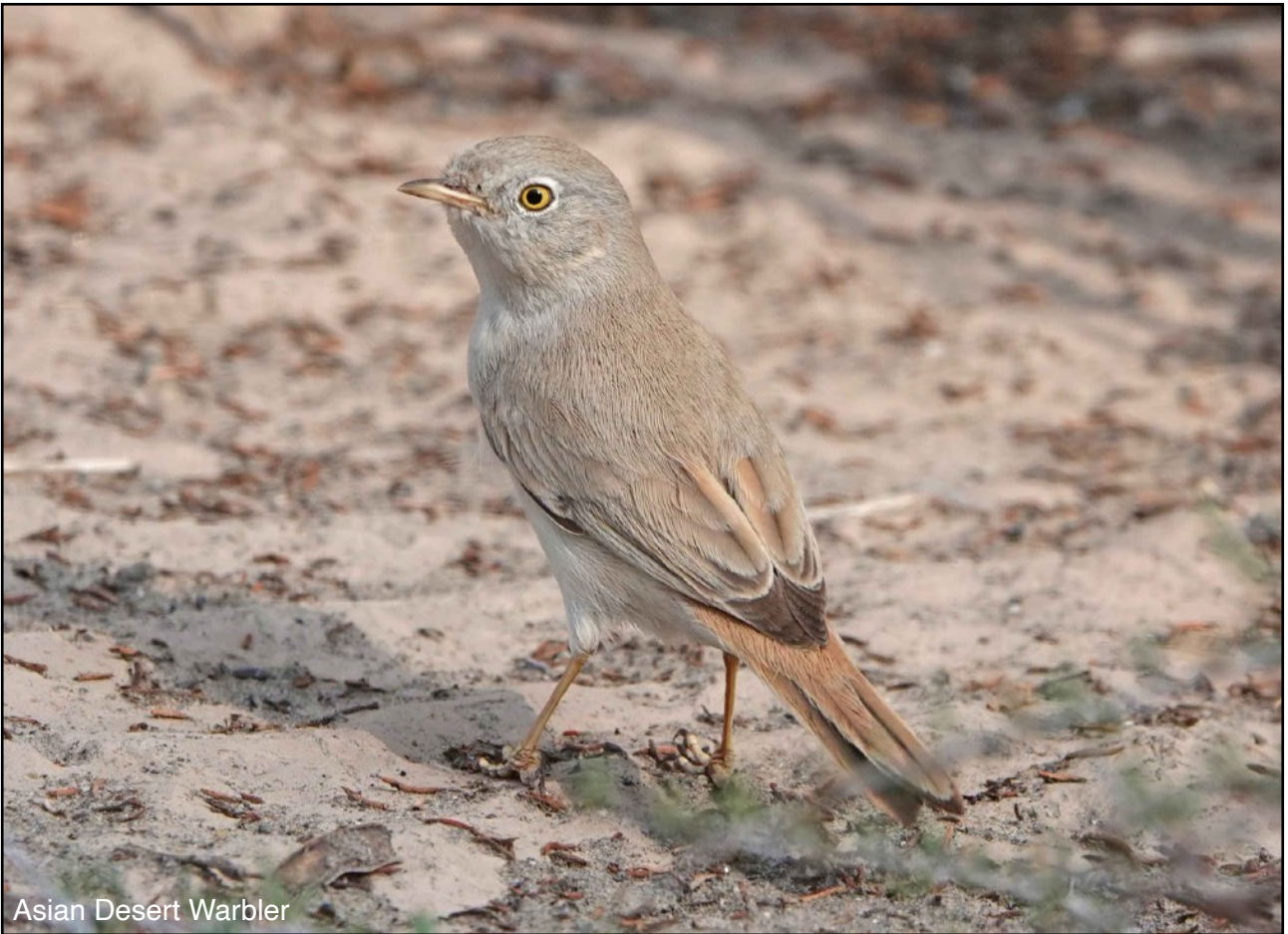
Asian Desert Warbler