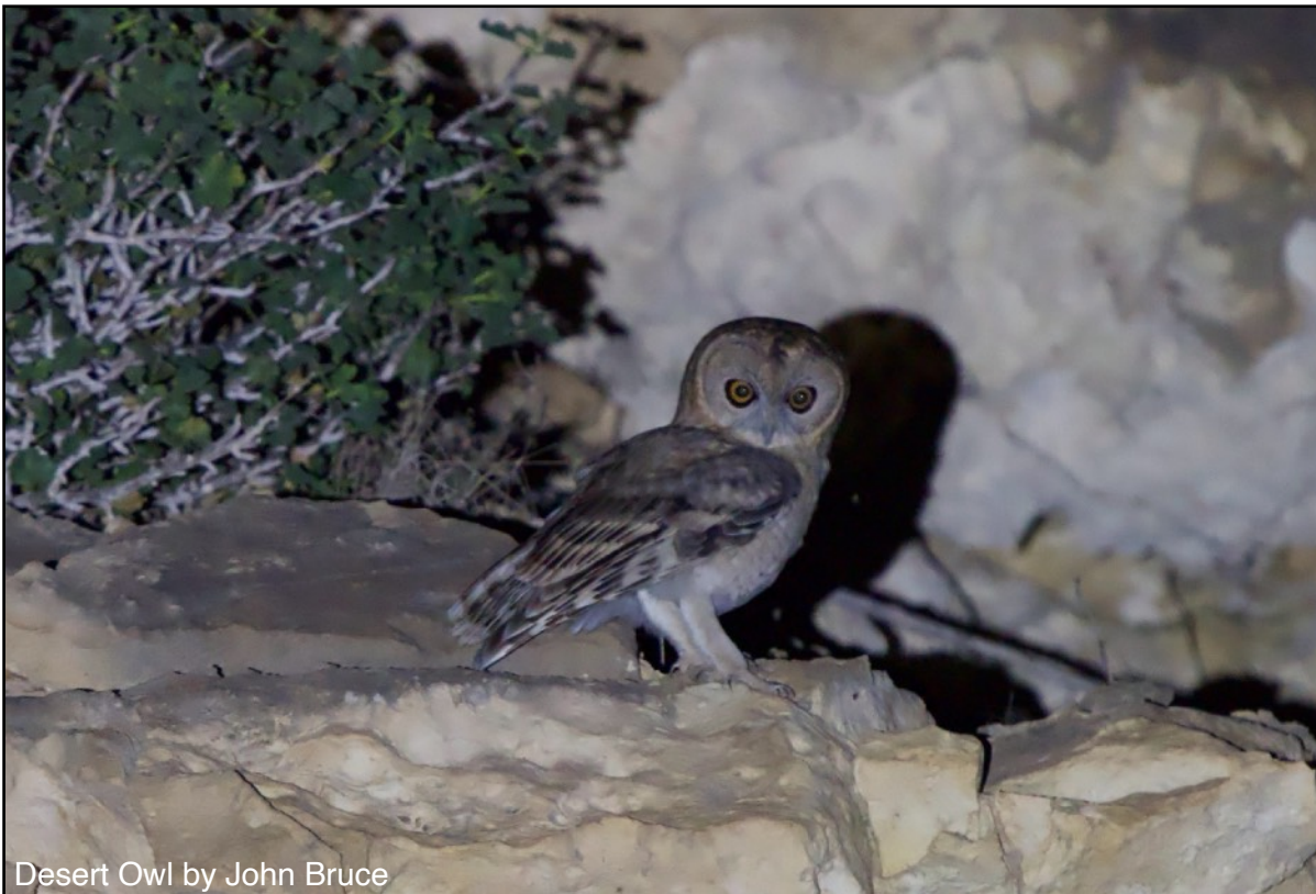
Desert Owl

Desert Owl: This species was voted 2 nd best bird of the trip, in another remote wadi, this time in the south. We weren't overly optimistic as a large group from the Netherlands arrived at the same spot, but a quick discussion and agreement for co-operation was soon reached, and Wise Birding took the lead with the strategy. We were soon rewarded with brilliant views of a calling male, and spirits were again high as we made our way out of a magical wadi with a sky full of stars shining down on us.