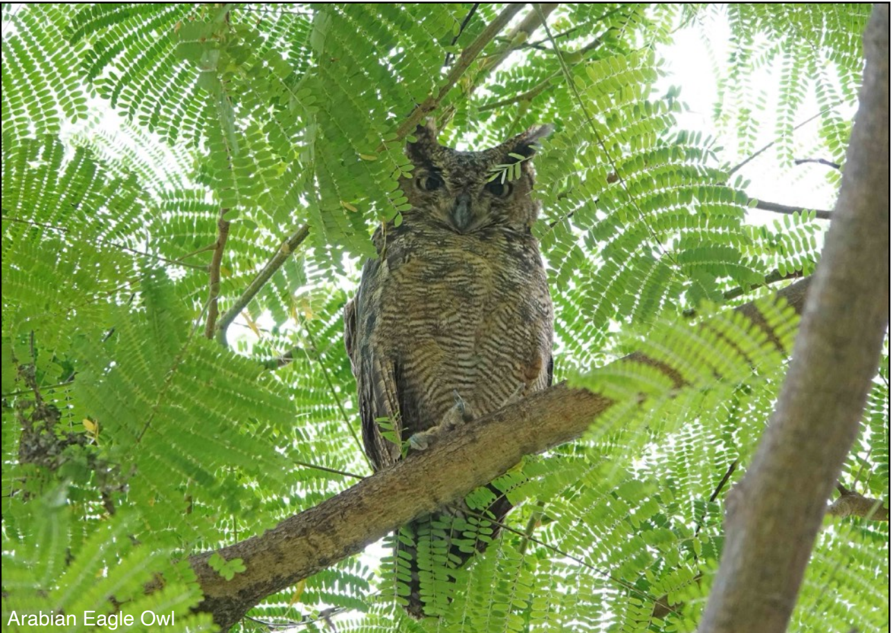
Arabian Eagle Owl