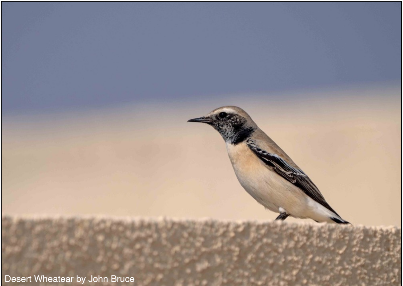
Desert Wheatear