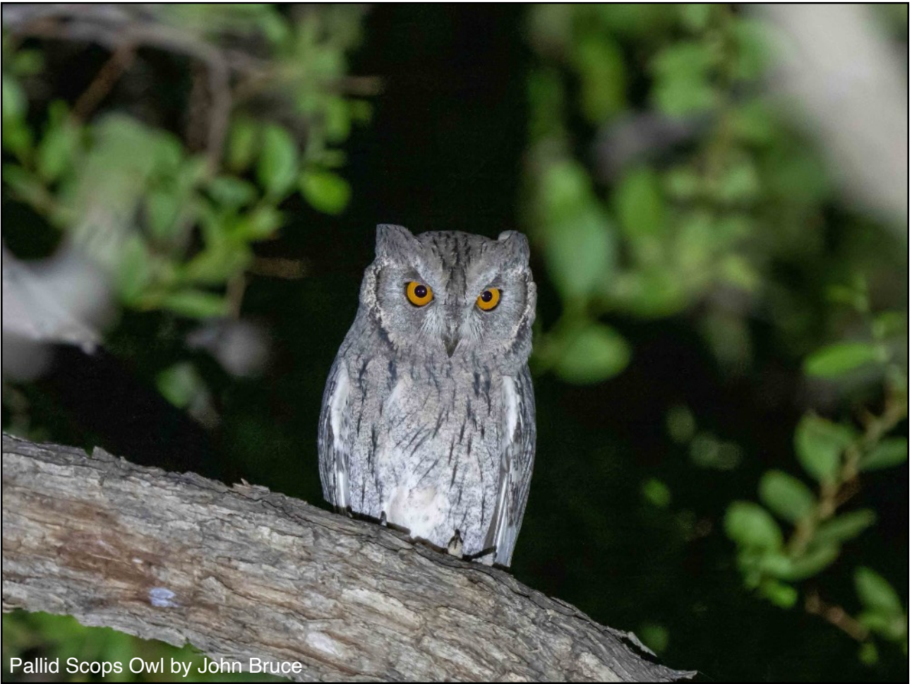
Pallid Scops Owl