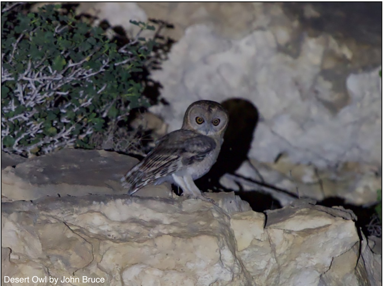
Desert Owl