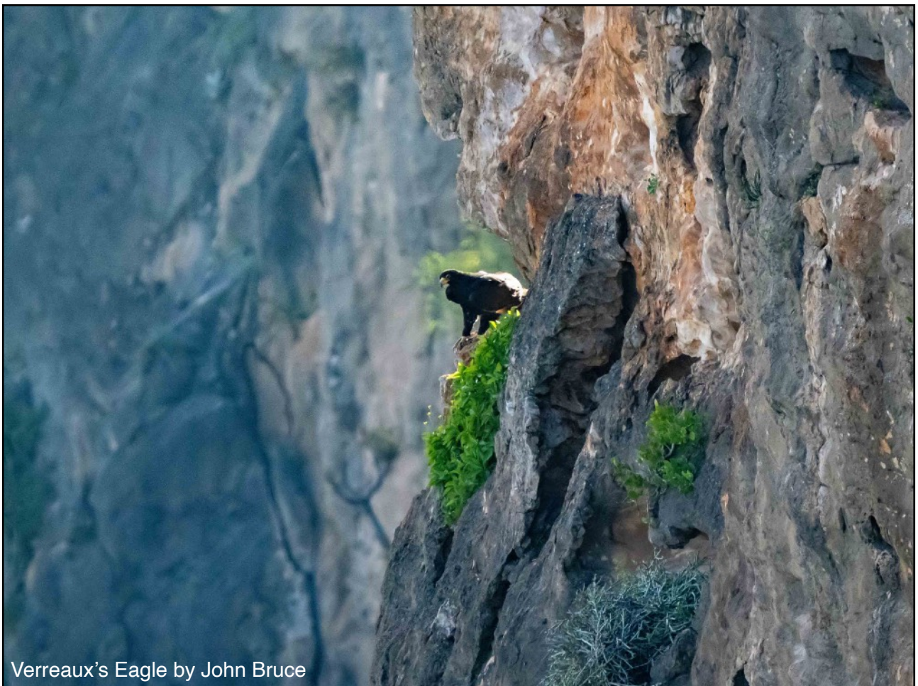
Verreaux's Eagle by John Bruce

To try and make a bigger difference to conservation we pool the donations from most of our tours into one central fund. Once a target amount has been reached this money will be used to support a single project in the hope of achieving more for species conservation. Currently this amounts to over £10,000. However, we do still donate money to support smaller conservation projects that we believe still benefit from smaller donations. Please visit www.wisebirding.co.uk to find out more.