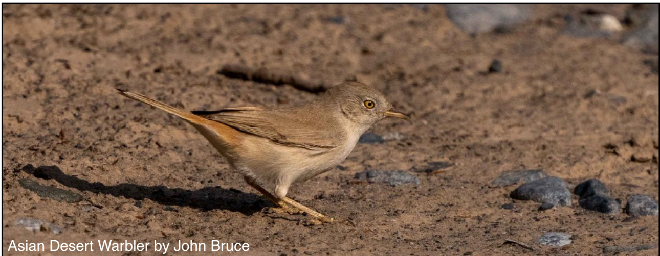
Asian Desert Warbler

The eBird Trip Report for this tour can be found HERE .