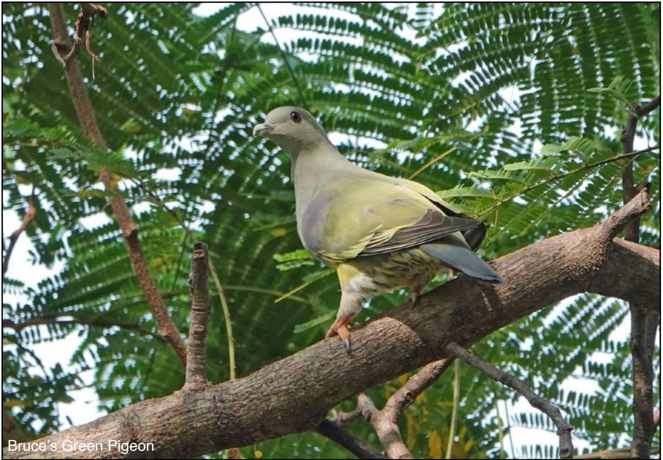
Bruce's Green Pigeon