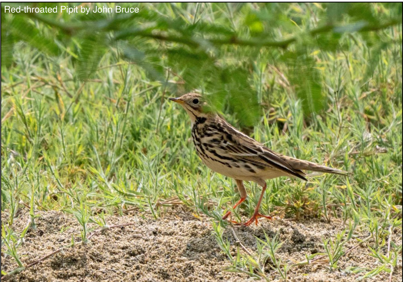
Red-throated Pipit