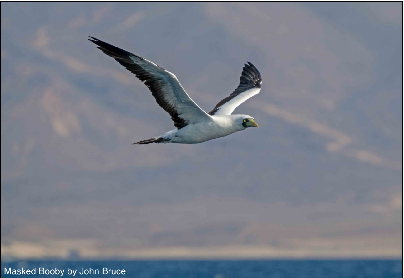
Masked Booby