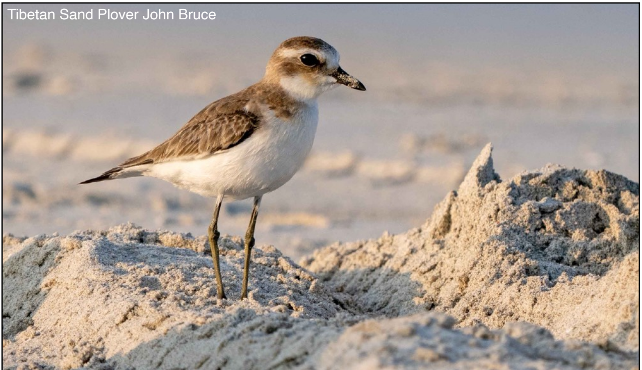
Tibetan Sand Plover