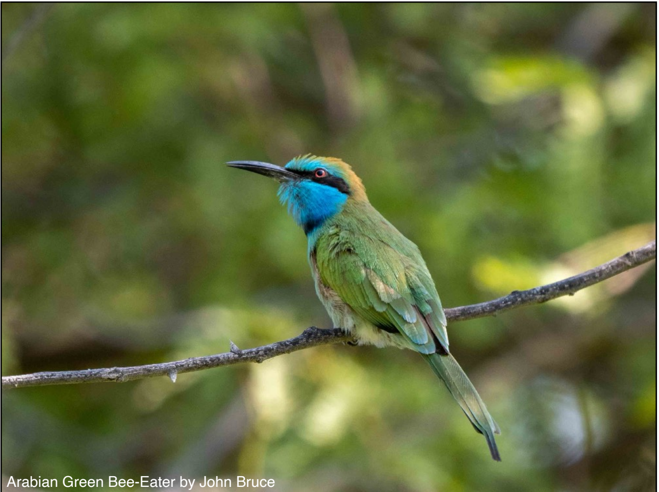
Arabian Green Bee-Eater