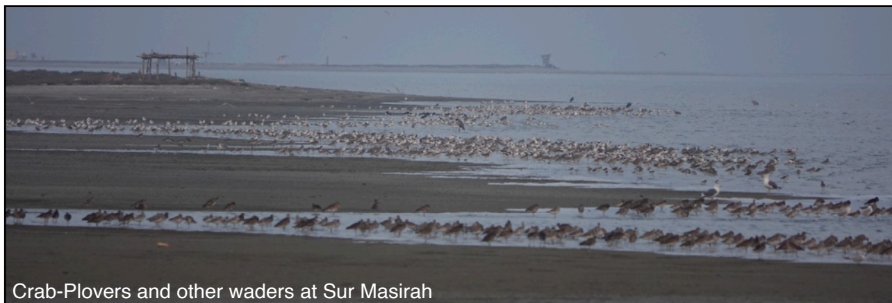
Crab-Plovers and other waders at Sur Masirah

Common in the Dhofar foothills, e.g. Ayn Razat, Ayn Hamran, Wadi Kheesh & Ayn Tobruk junction.