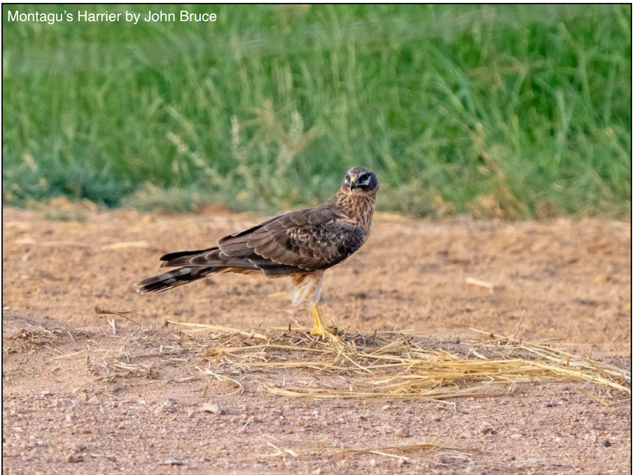
Montagu's Harrier