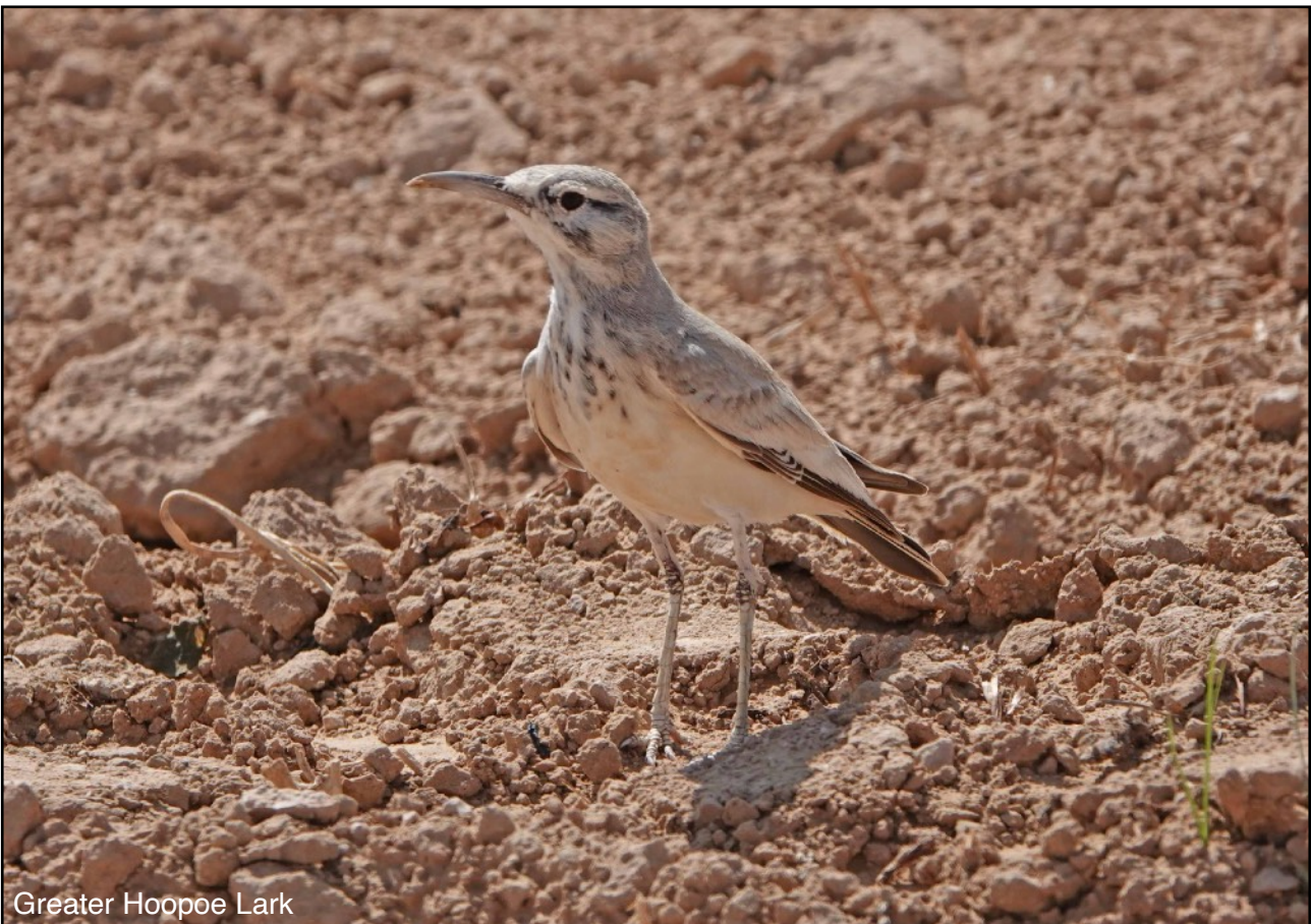
Greater Hoopoe Lark