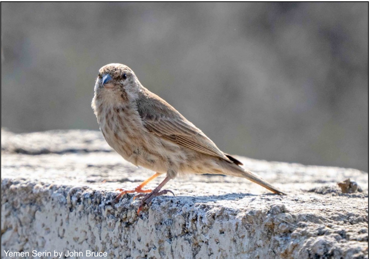
Yemen Serin