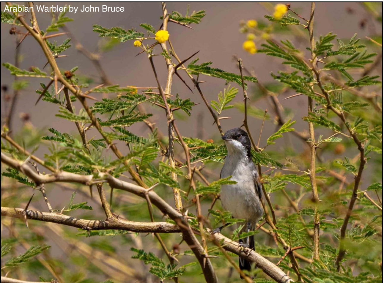
Arabian Warbler