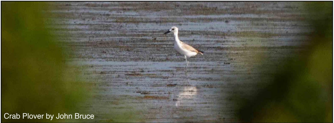
Crab Plover