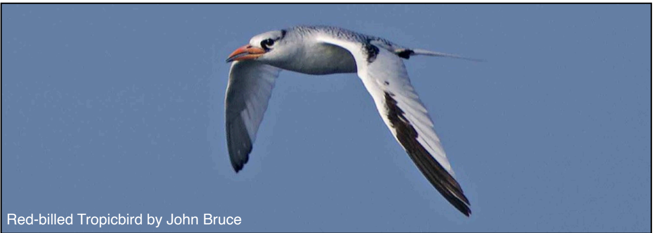
Red-billed Tropicbird