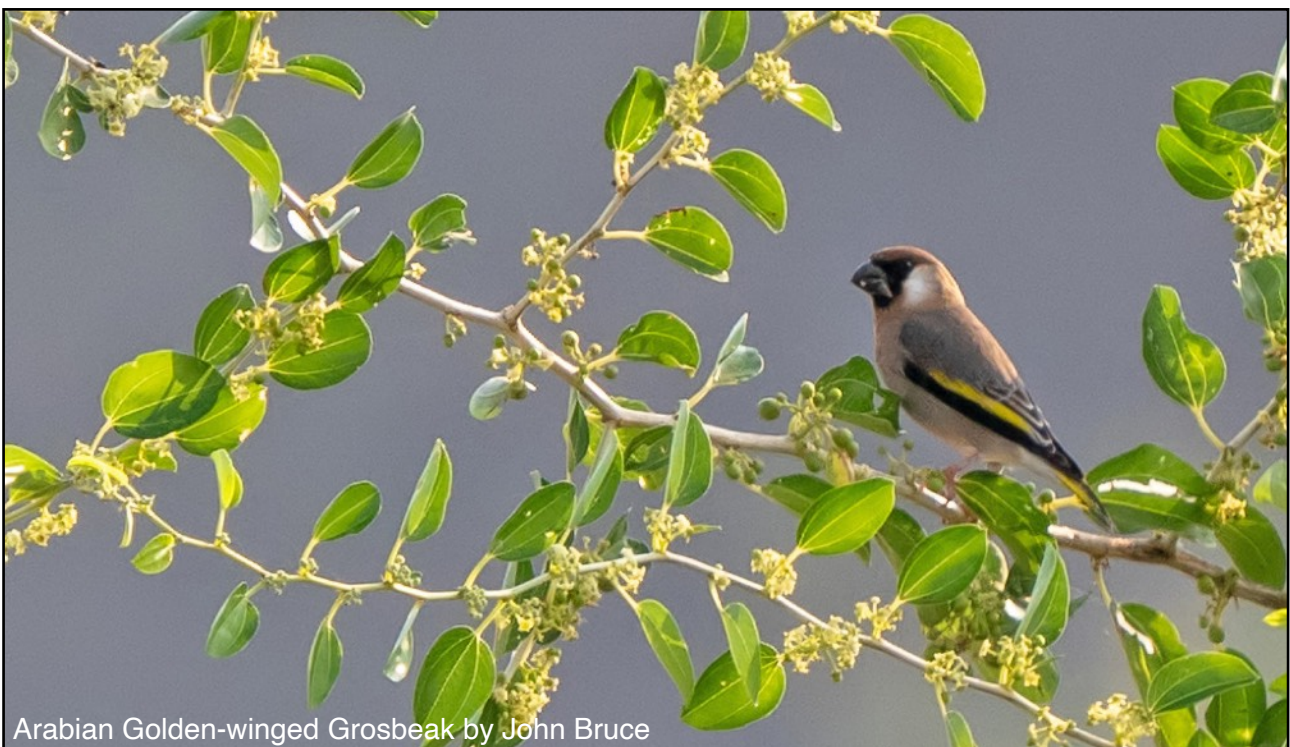
Arabian Golden-winged Grosbeak