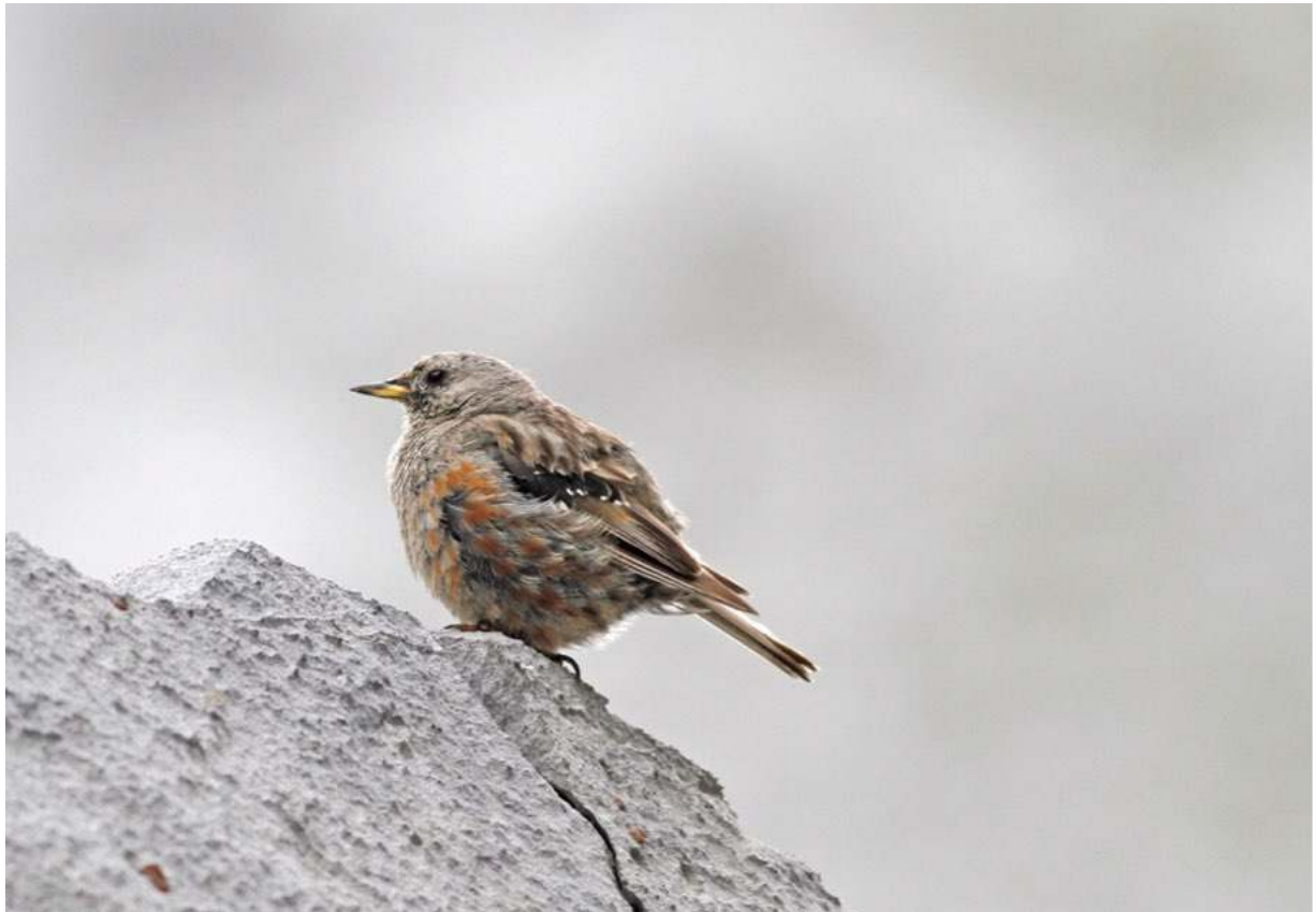
Alpine Accentor (above) and Yellow-billed Cough (below)