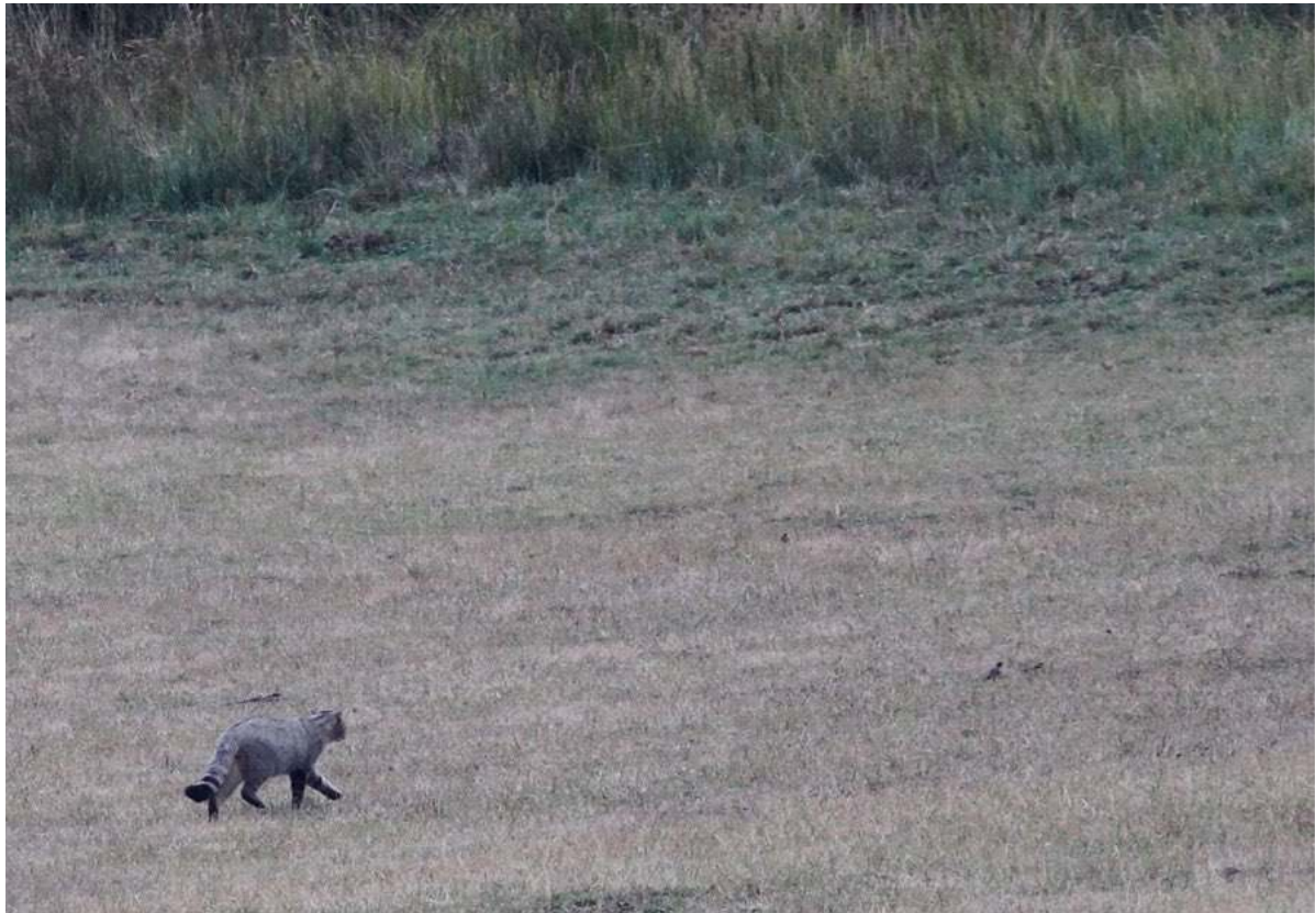
Our first European Wildcat (above) and the third animal (below) - Both seen on our first evening