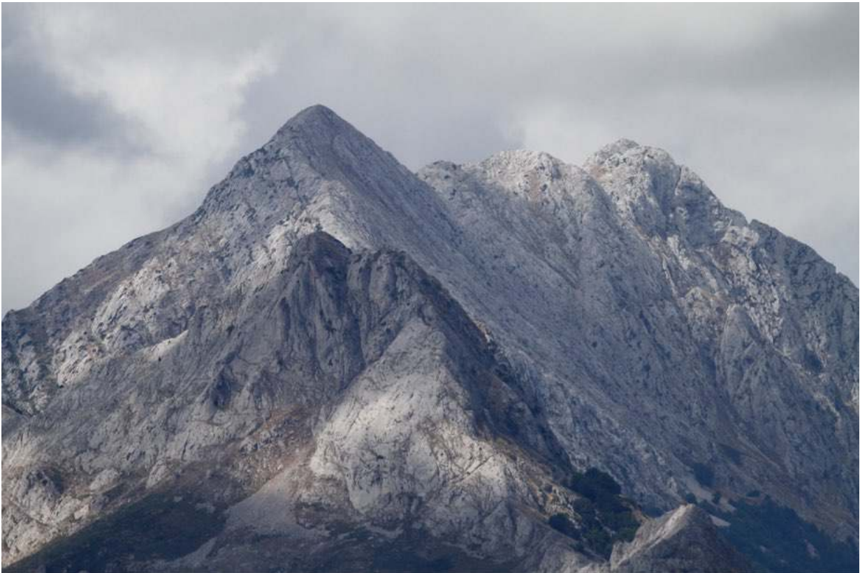
The view from the top of the cable car(above) and one of the many Cantabrian Chamois (below)