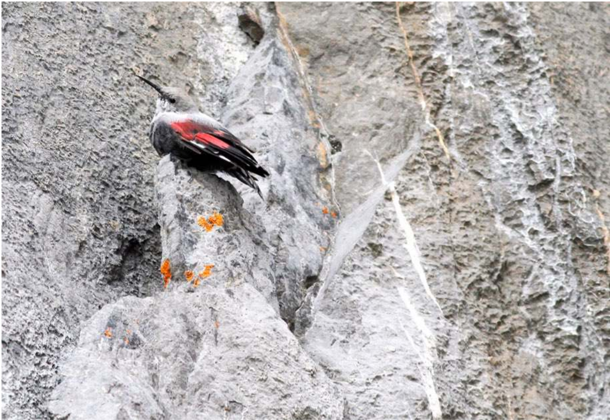
This fabulous Wallcreeper showed exceptionally well at the well known site of La Vueltona in the Picos de Europa