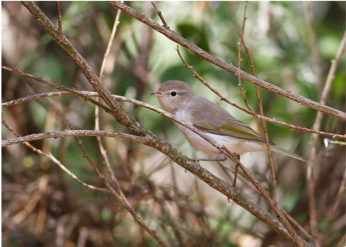
Western Bonelli's Warbler (above) and the cable car at Fuente Dé (below)