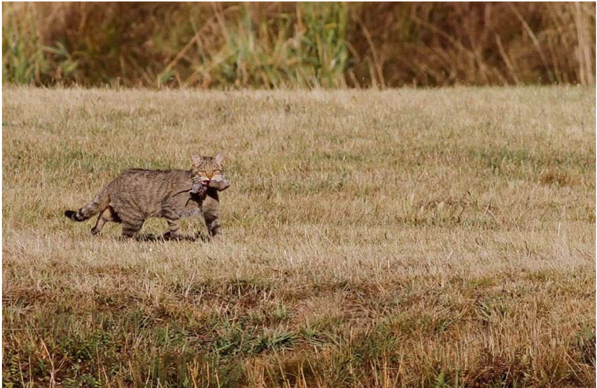
Two of the European Wildcats seen on our last morning