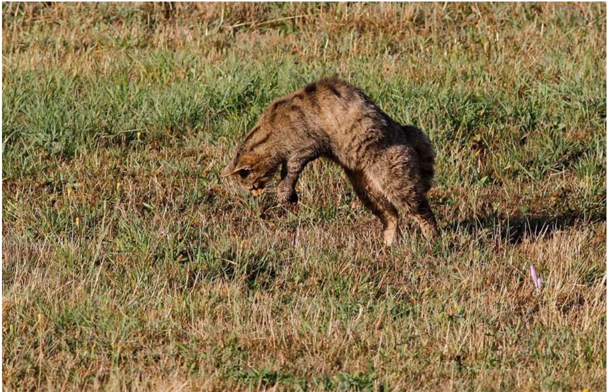
This European Wildcat showed very well on our last morning as it hunted small mammals