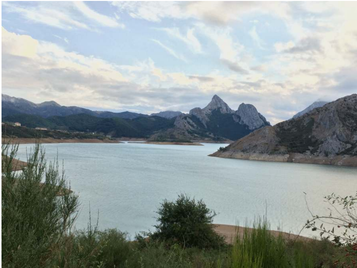
Riaño Reservoir and Peak Gilbo (above) and looking towards La Vueltona, Picos de Europa NP (below)