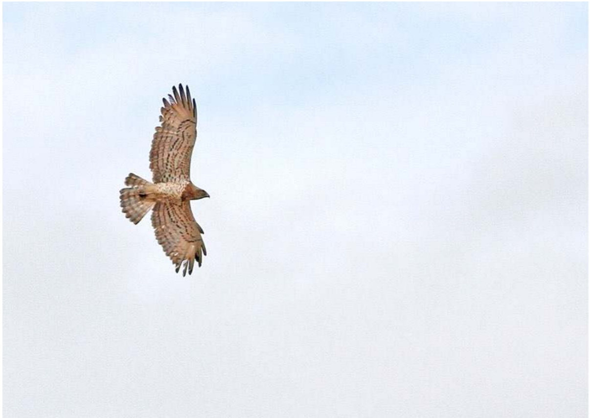
Short-toed Eagle (above) and Honey Buzzard (below)