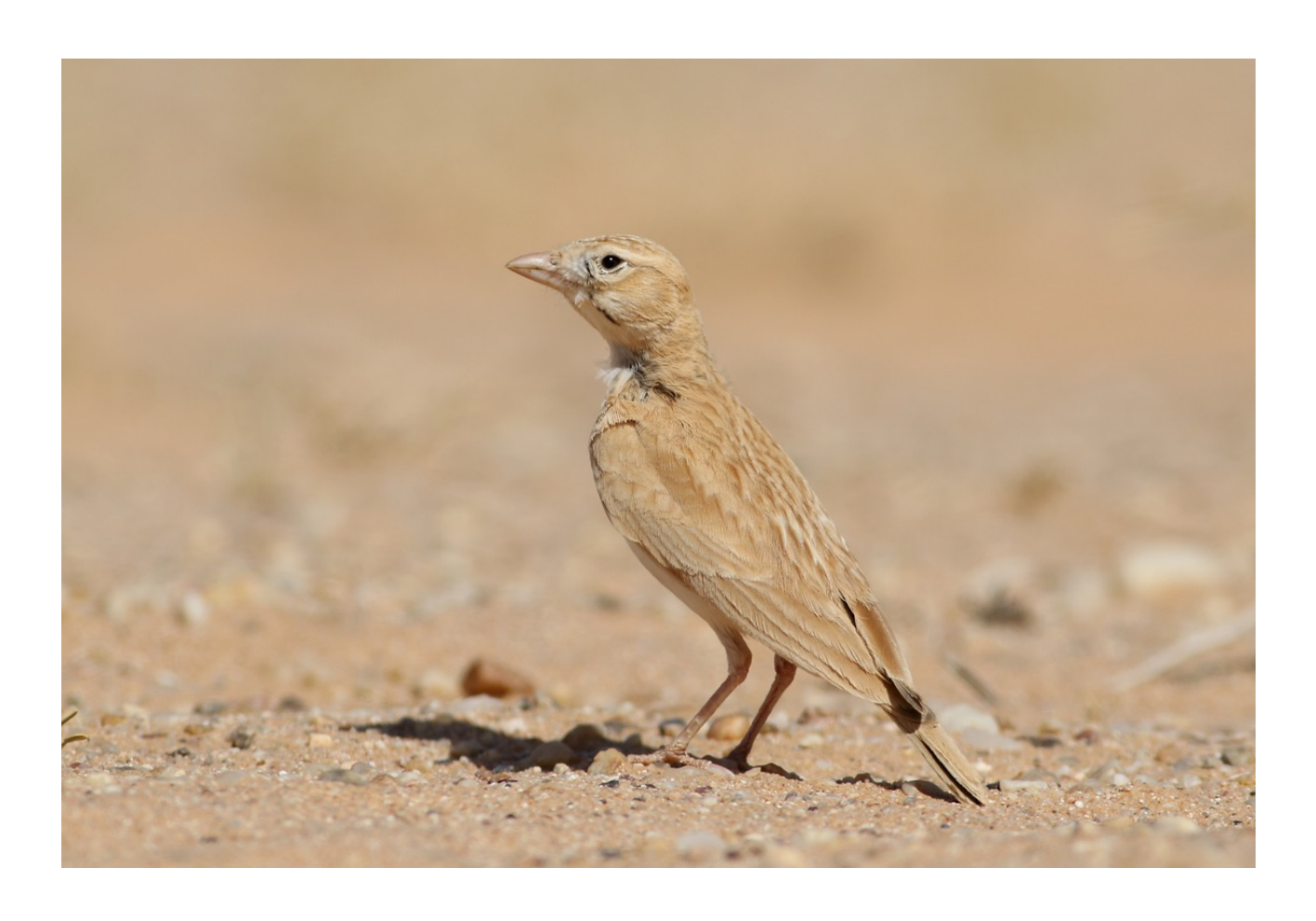
The "African" Dunn's Lark was a key target (above) Bar-tailed Lark (below)