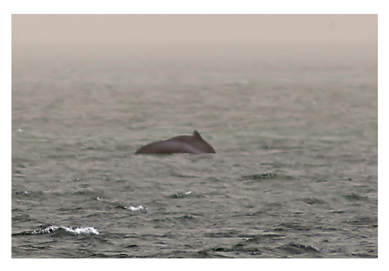
Atlantic Humpback Dolphin (above) "White-breasted" Cormorants (below)