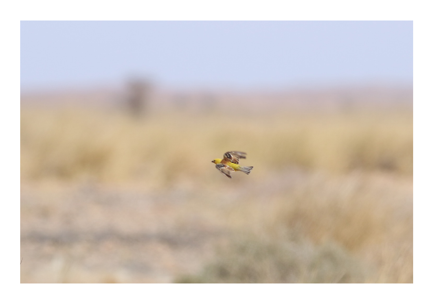
The unmistakable male Sudan Golden Sparrow in Oued Jenna