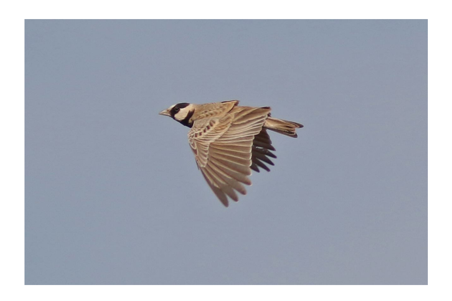
Male Black-crowned Sparrow-lark (above) and male Montagu's Harrier (below)