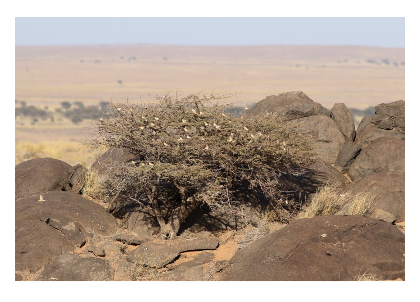
WISE BIRDING HOLIDAYS LTD - WESTERN SAHARA: Birds & Mammals Tour March 2018