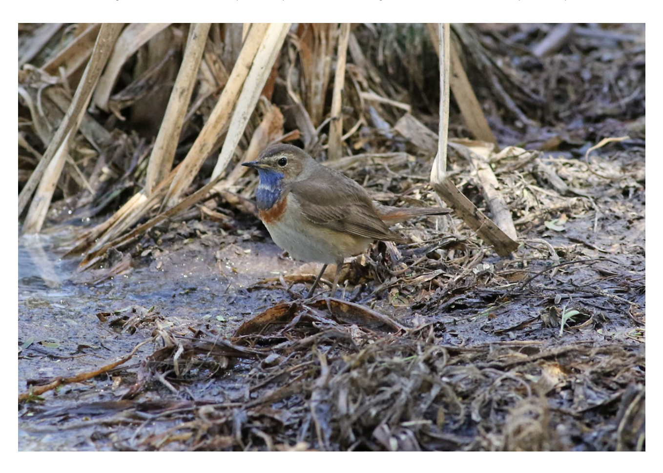
WISE BIRDING HOLIDAYS LTD - WESTERN SAHARA: Birds & Mammals Tour March 2018