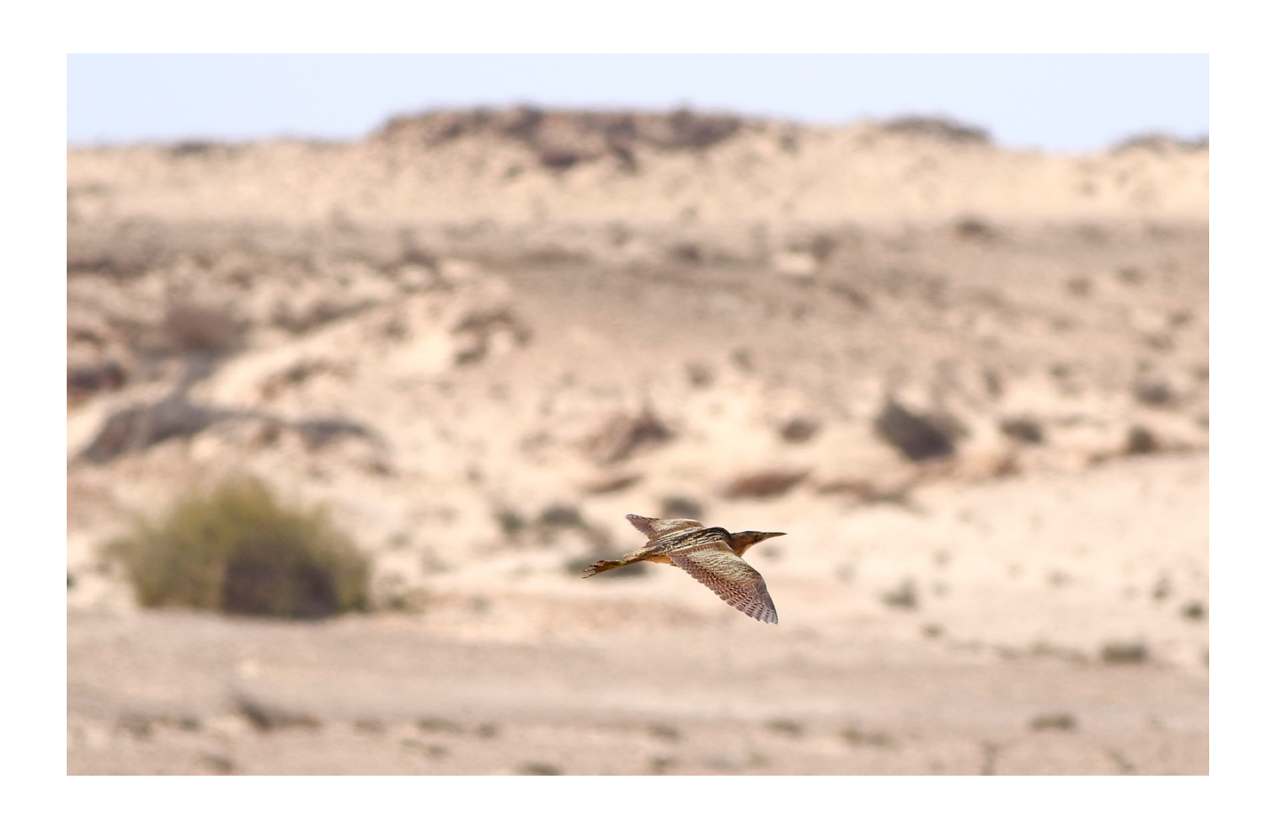
This Eurasian Bittern in the desert was totally unexpected. Only the 2nd record for the region!