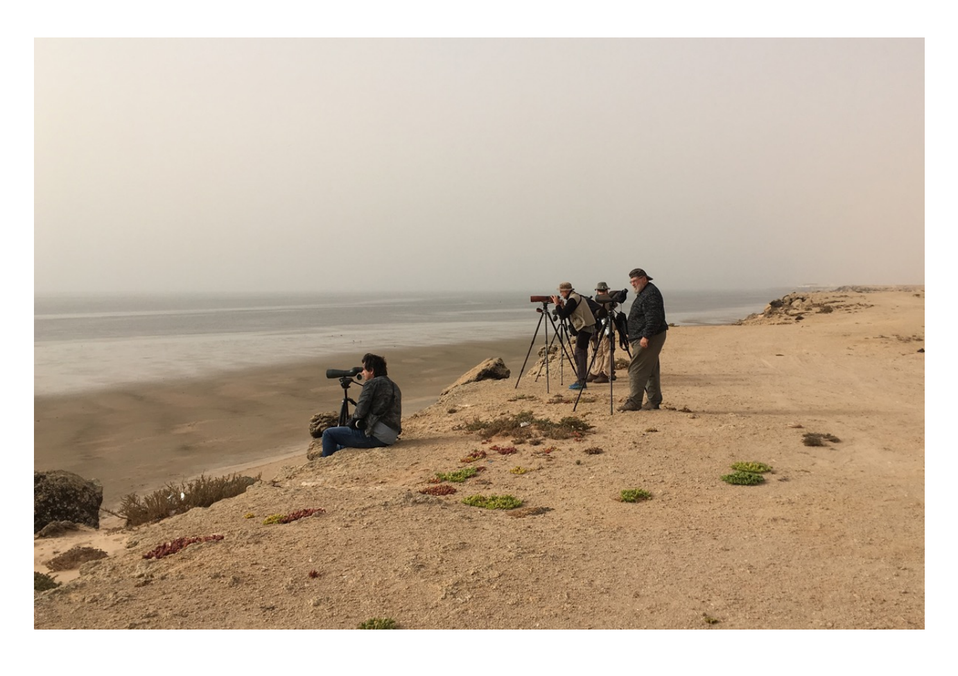
WISE BIRDING HOLIDAYS LTD - WESTERN SAHARA: Birds & Mammals Tour March 2018