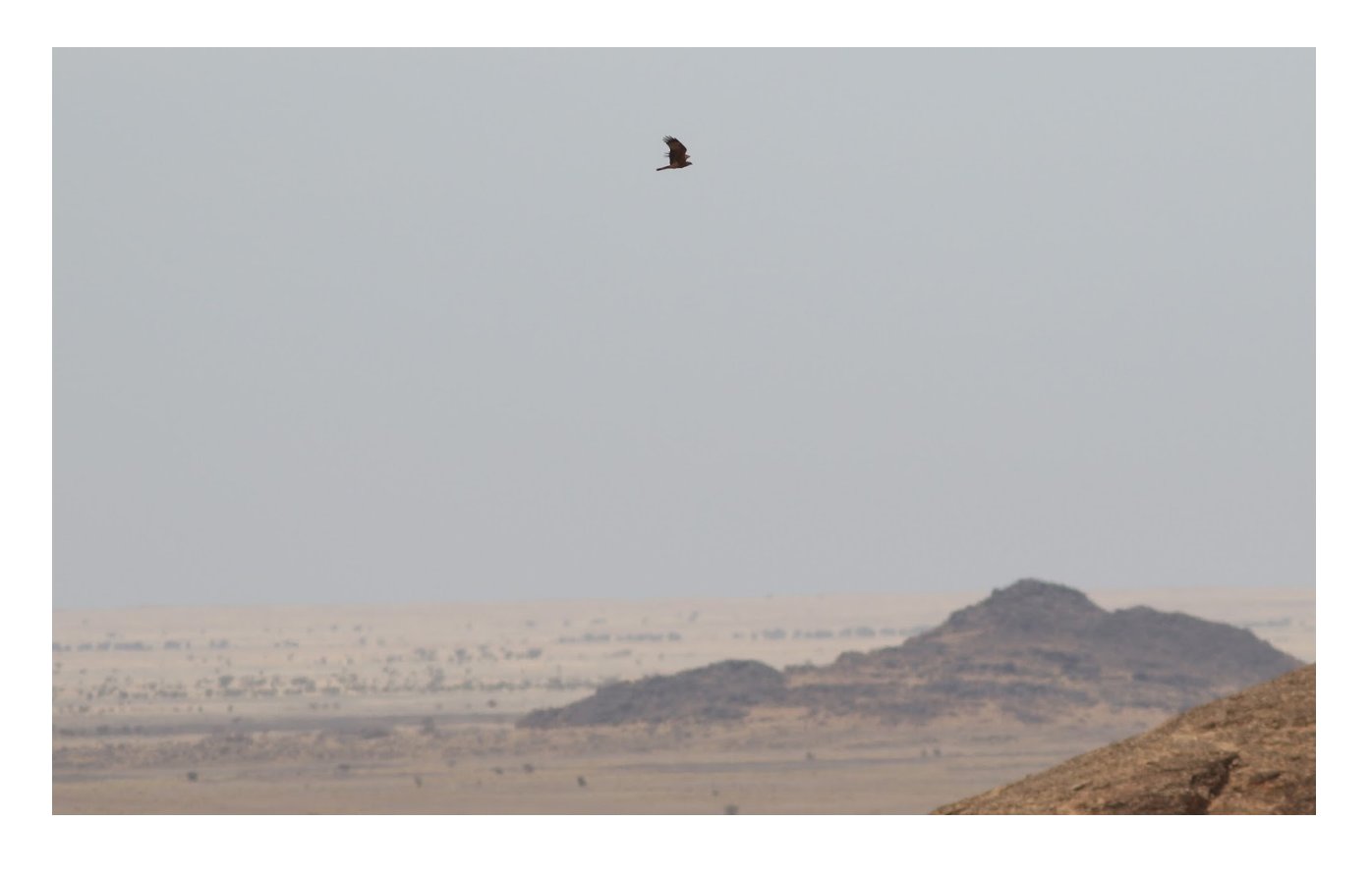
WISE BIRDING HOLIDAYS LTD - WESTERN SAHARA: Birds & Mammals Tour March 2018