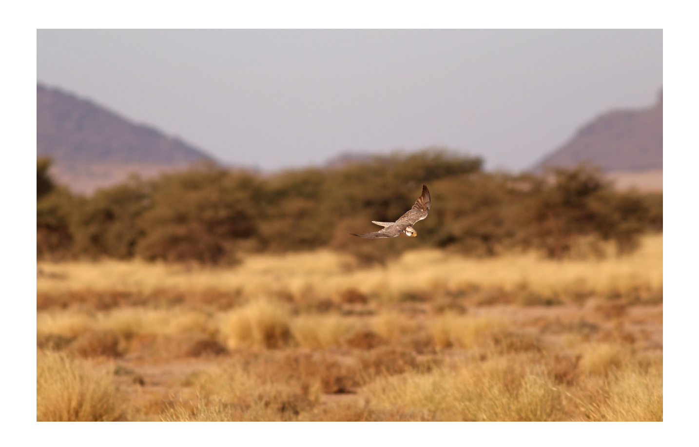
The erlangeri race of Lanner Falcon gave us an impressive aerial display