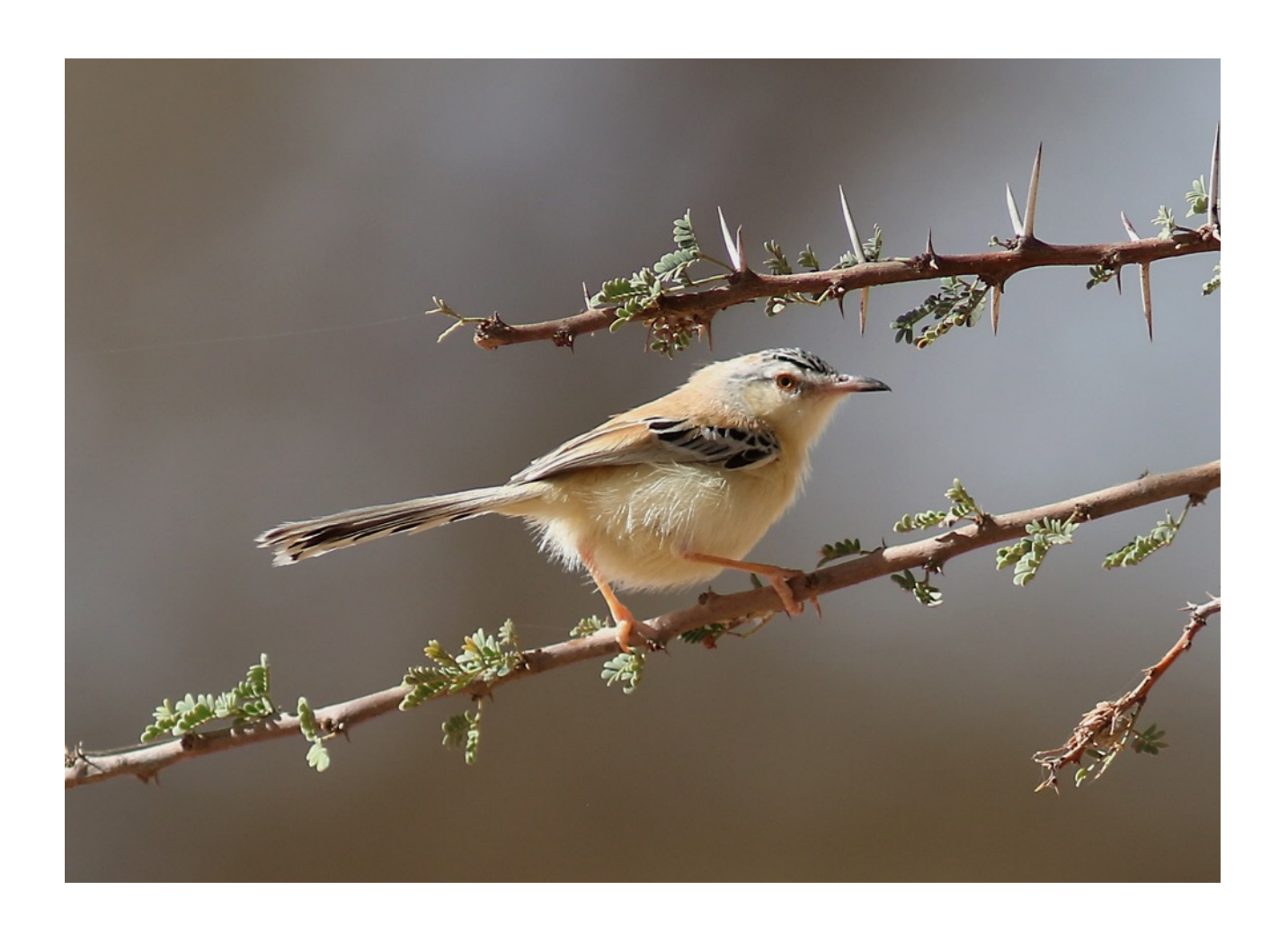
Cricket Warbler (above) Western Olivaceous or Isabelline Warbler (below)