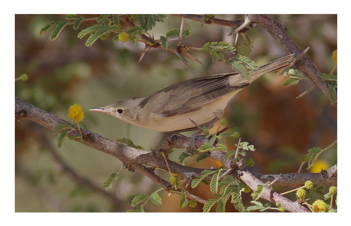
WISE BIRDING HOLIDAYS LTD - WESTERN SAHARA: Birds & Mammals Tour March 2018