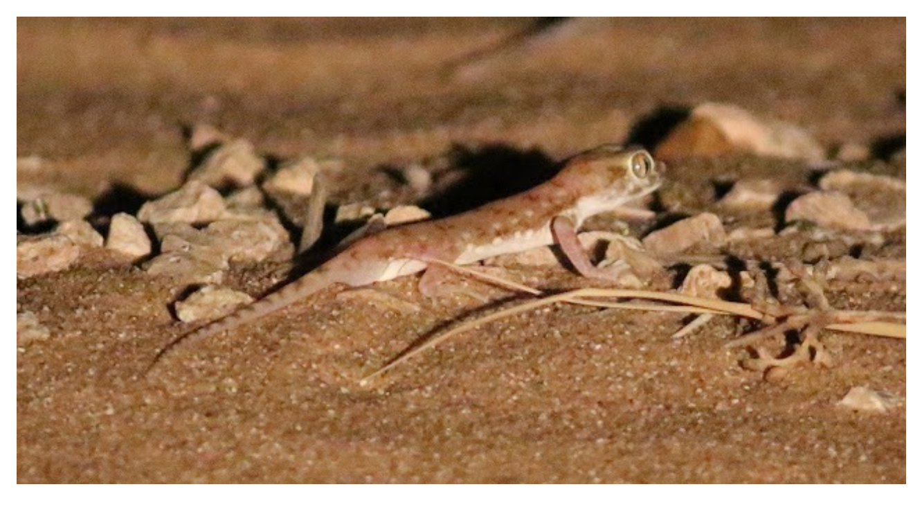
WISE BIRDING HOLIDAYS LTD - WESTERN SAHARA: Birds & Mammals Tour March 2018