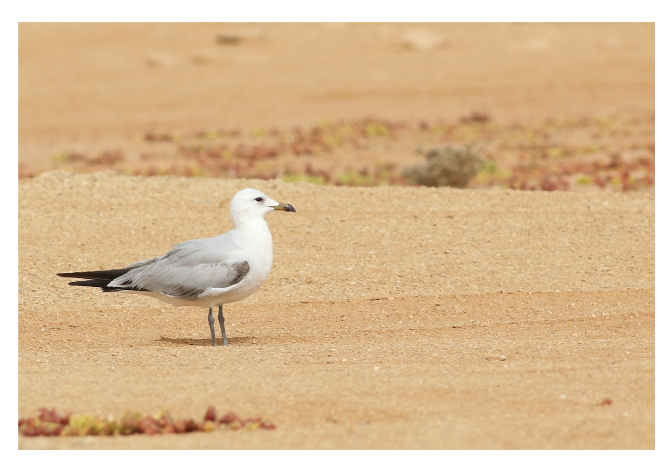
WISE BIRDING HOLIDAYS LTD - WESTERN SAHARA: Birds & Mammals Tour March 2018