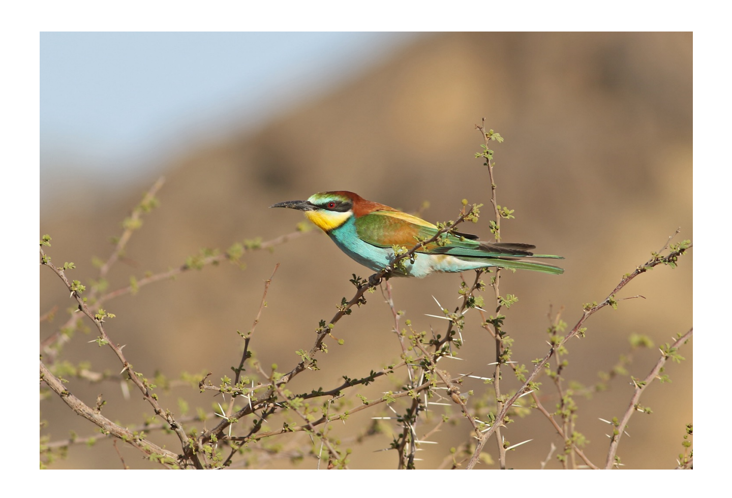
European Bee-Eater (above) and White-spotted Bluethroat (below)