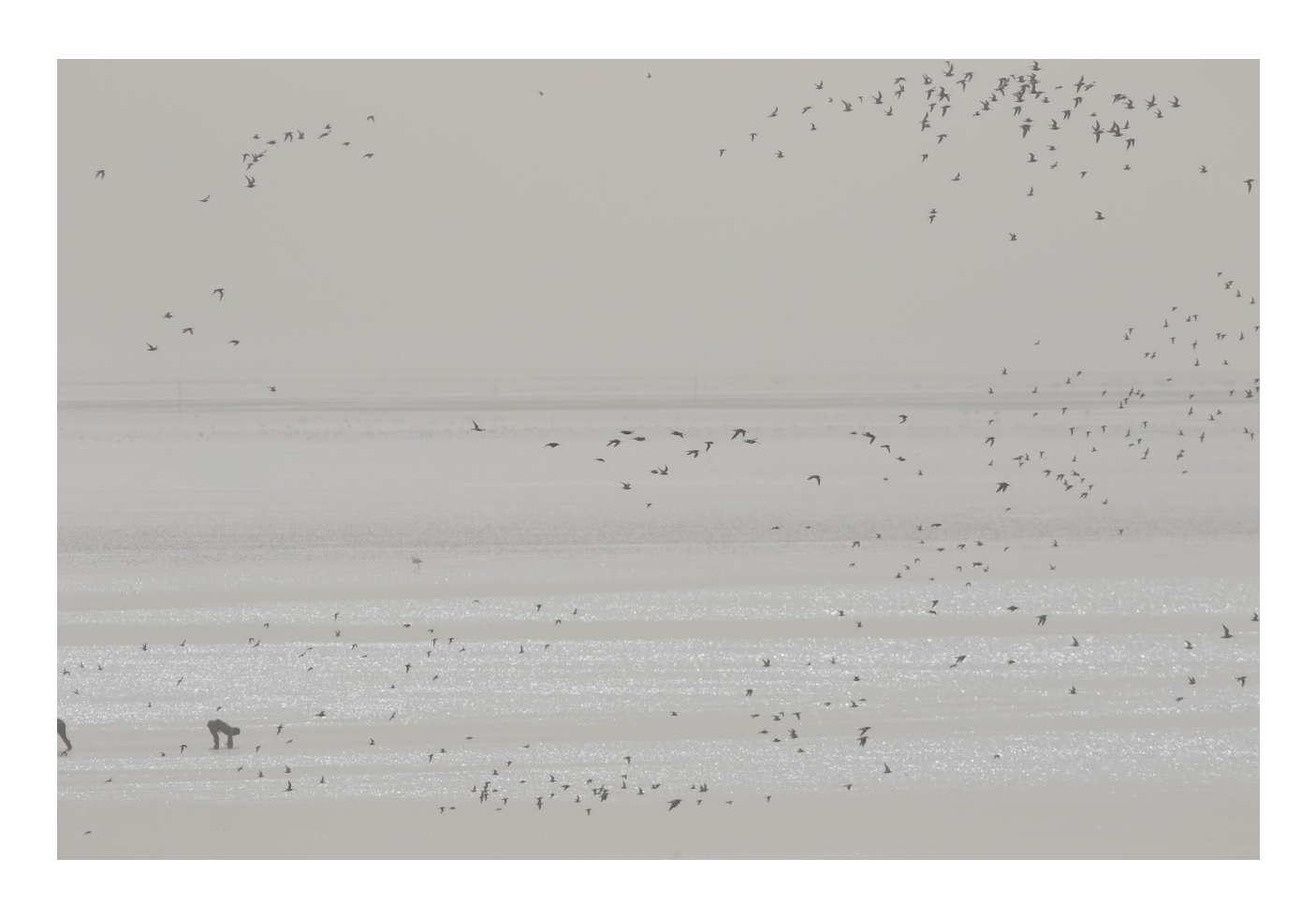
Dakhla Bay is an internationally important site for wintering waders