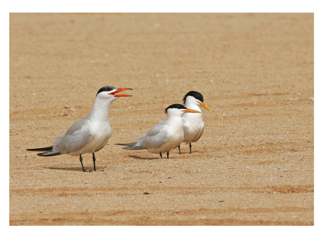
Caspian and Royal Terns (above) Audouin's Gull (below)