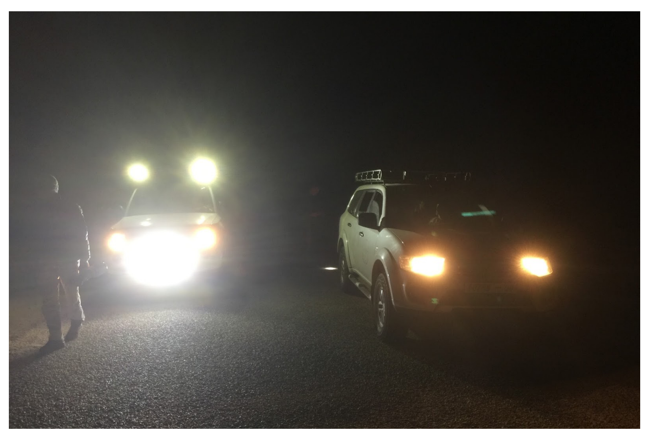
WISE BIRDING HOLIDAYS LTD - WESTERN SAHARA: Birds & Mammals Tour March 2018