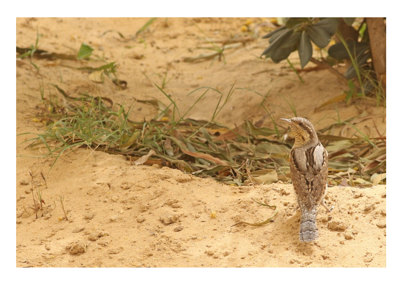
Eurasian Wryneck (above) and Western Orphean Warbler (below)