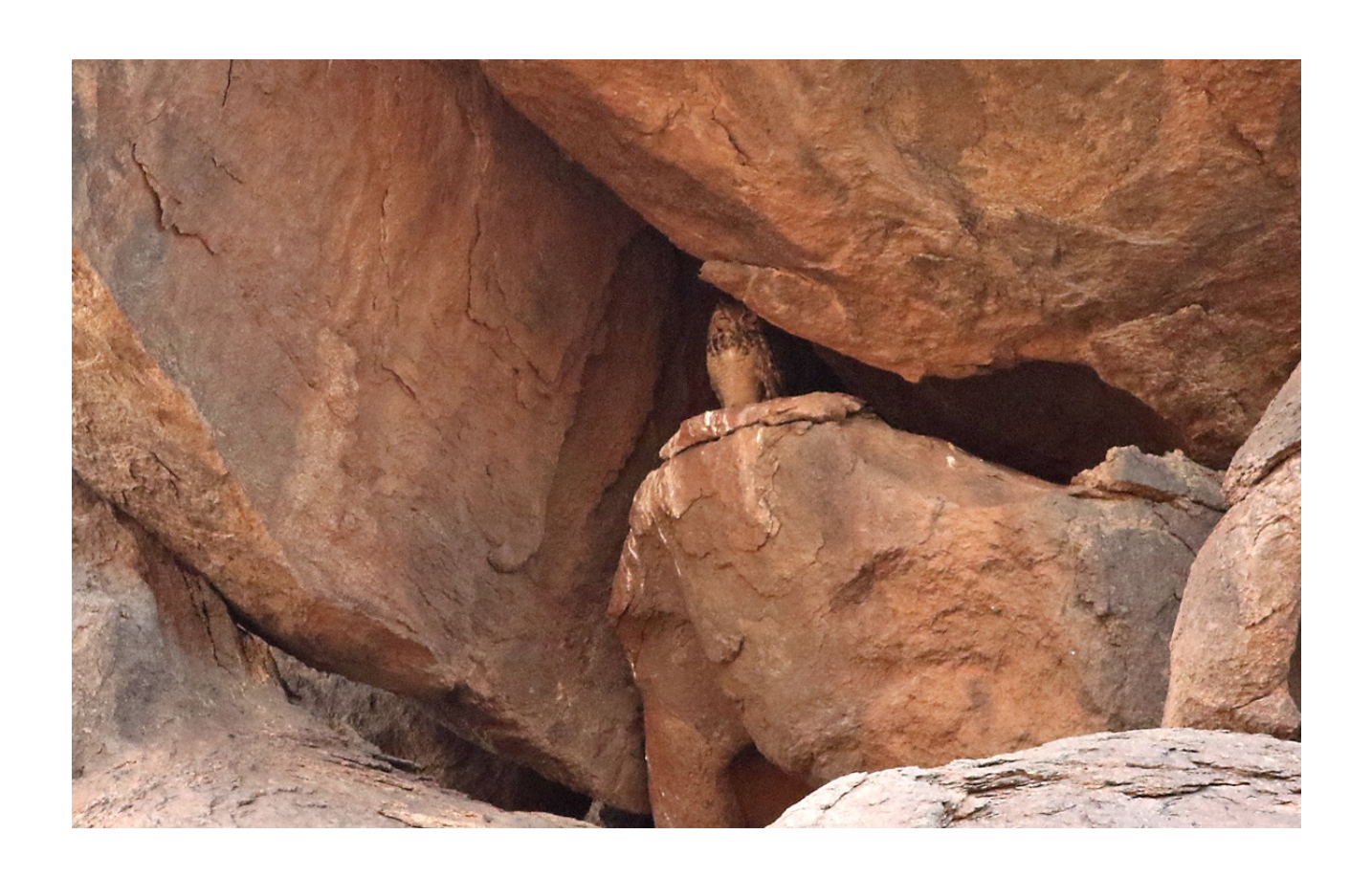
Pharaoh Eagle Owl (above) and migrating Black Kite (below)