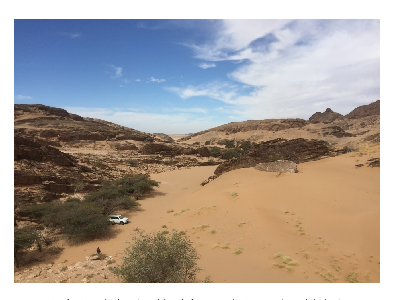
Leglat Massif (above) and Spotlighting on the Aousserd Road (below)