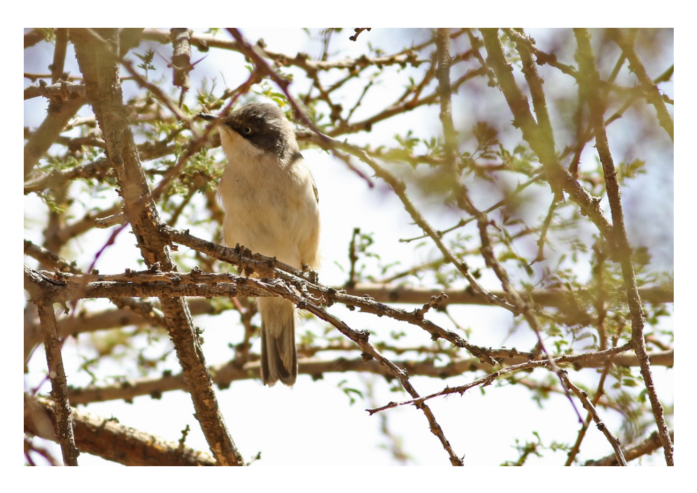
WISE BIRDING HOLIDAYS LTD - WESTERN SAHARA: Birds & Mammals Tour March 2018