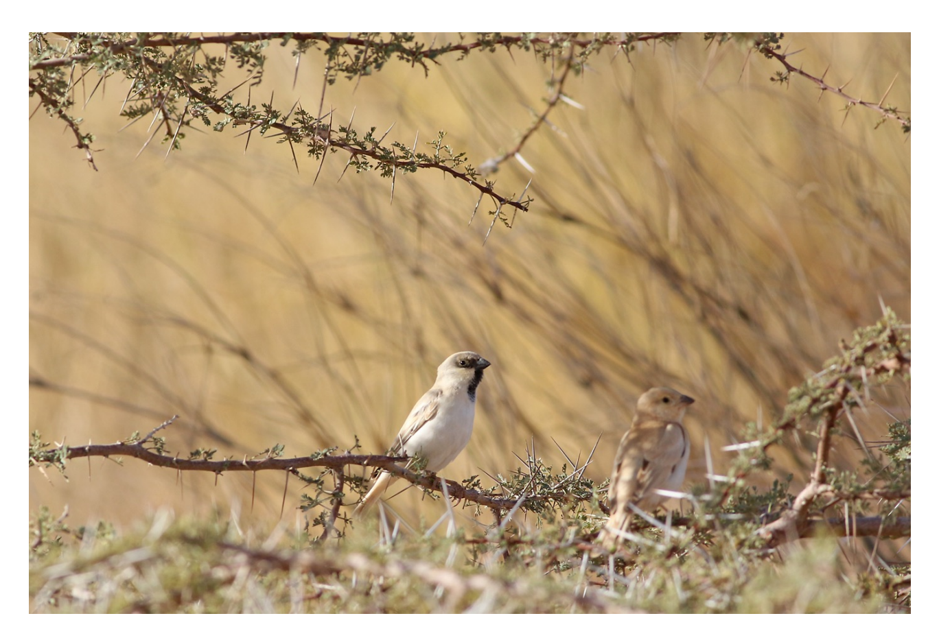
Desert Sparrow counts were impressive with 400+ birds in one day!