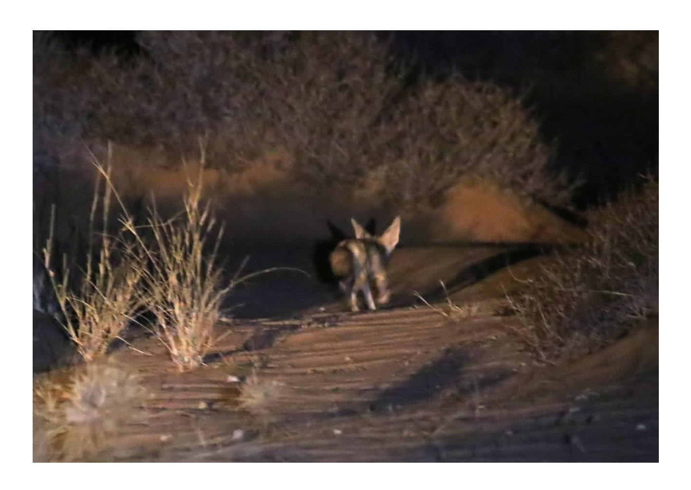
Fennec Fox (above) and African Wildcat (below)